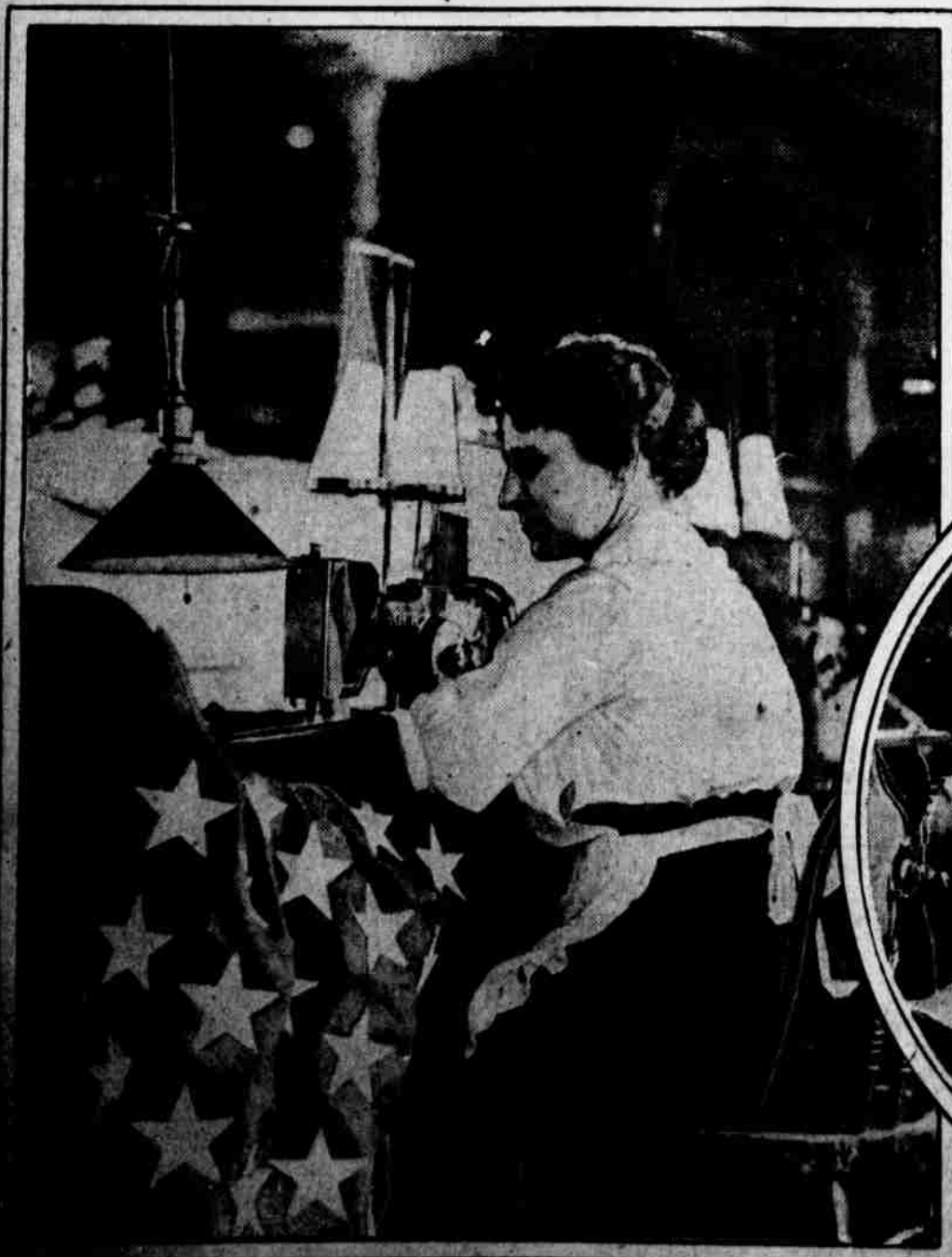
"A STAR FOR EVERY STATE" IS NEXT CUT FROM THE FABRIC