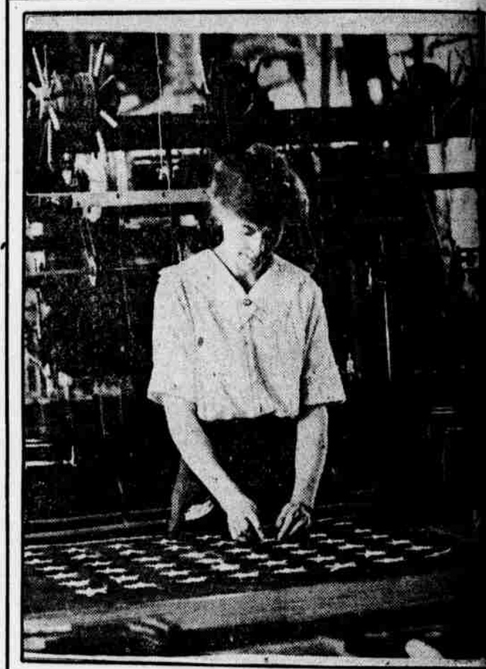
EACH STAR MUST BE PREPARED AND THEN ATTACHED TO THE BLUE FIELD