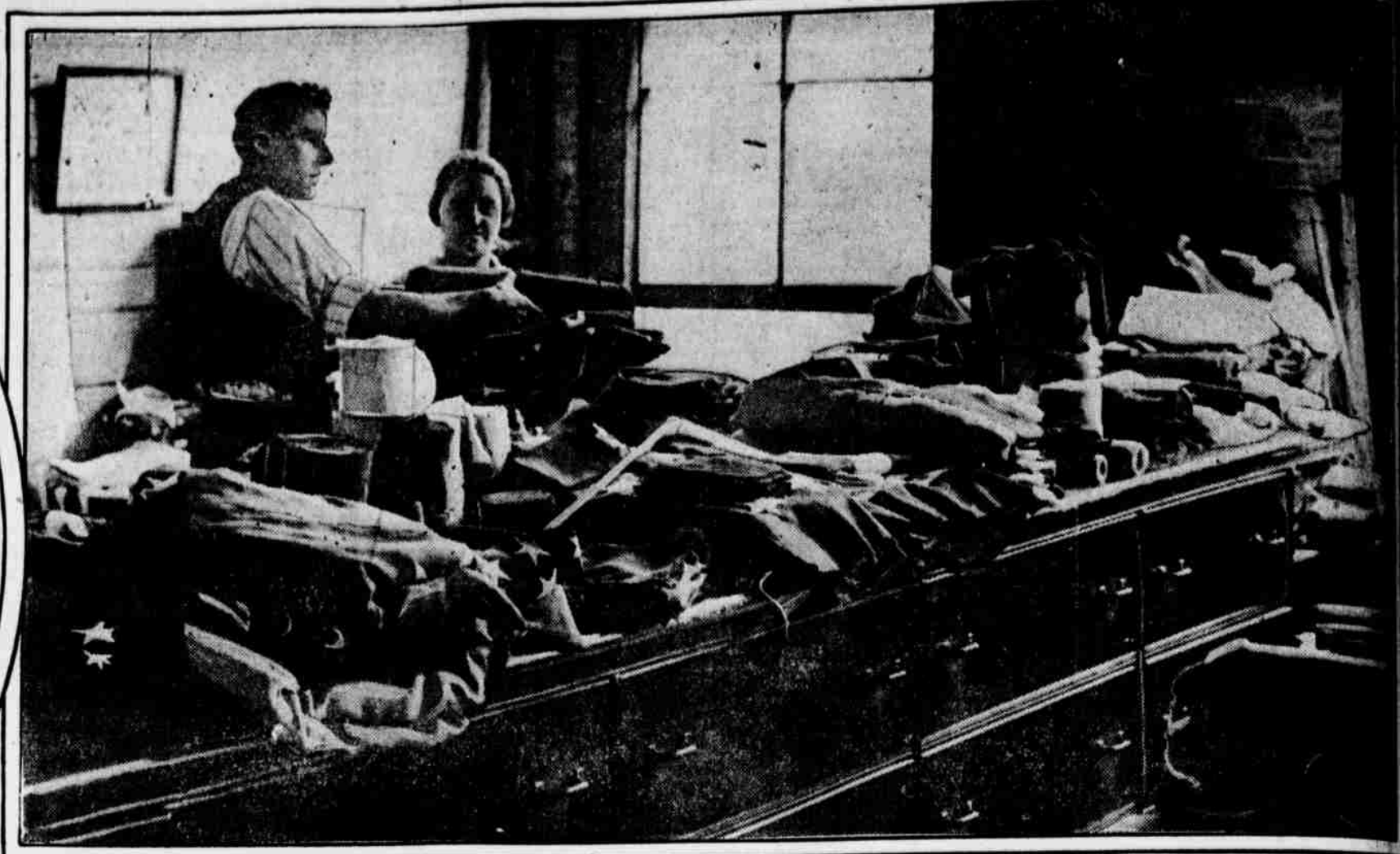
THE MATERIAL CUT, THE WORK IS GIVEN OUT TO THE SEAMSTRESSES