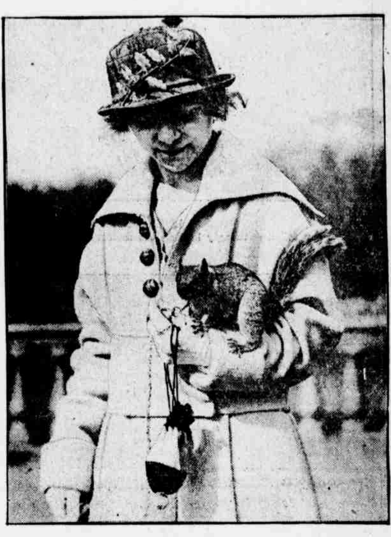
A PARK DENIZEN MAKES A NEW FRIEND Emerging from his winter lair, this fuzzy resident of George's Hill captivates a fair stroller through that woodland region.