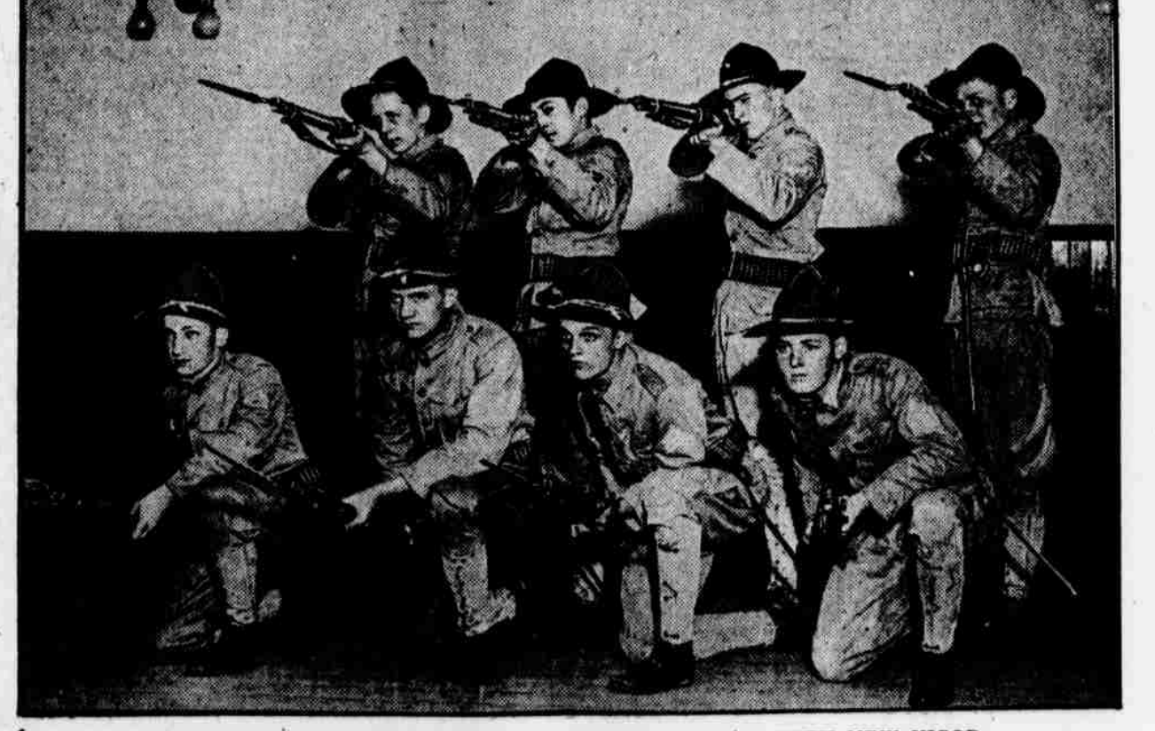
A SPANISH-AMERICAN WAR ECHO THAT VIBRATES WITH NEW VIGOR The Olney Guard, organized in 1898, is drilling at St. James Church, with signal corps, wireless and first-aid squads as adjuncts to its regular equipment.