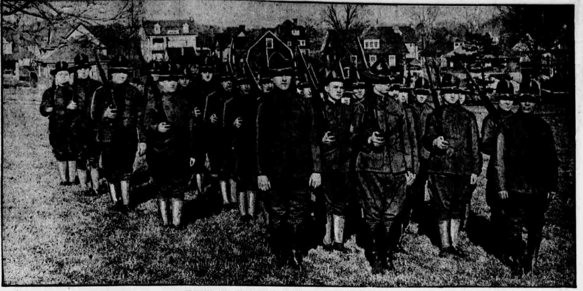
CLERKS OF FINANCIAL DISTRICT IN MILITARY ARRAY Employes of the Pennsylvania Company for Insurances on Lives, whose building, 517 Chestnut street, faces Independence Hall, have organized an infantry command of sixty members.