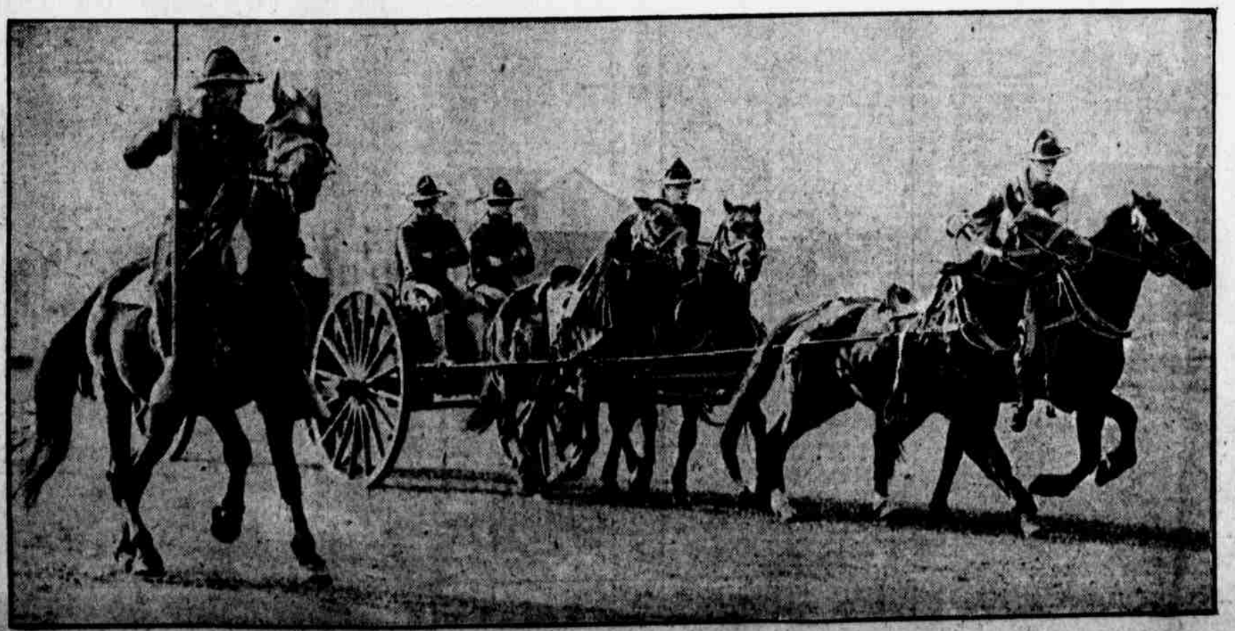
CAN MANDLE FIELD ABTILLERY LIKE REGULAR GUNNERS

A PIONEER AMONG THE SCHOOL MILITARY COEPS OF Girard College has contributed a goodly quota to the country's buildfully