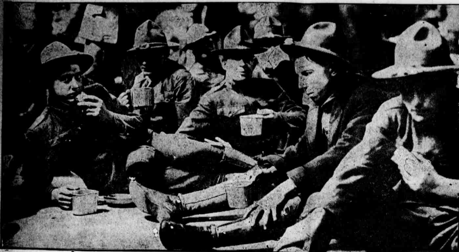
WAR TALK HAS NO EFFECT ON THEIR APPETITES, UNLESS TO MAKE THEM MORE VORACIOUS There is no suggestion of a "diet squad" in this group at the First Regiment Armory, Broad and Callowhill streets, where the meals are "hand-outs."