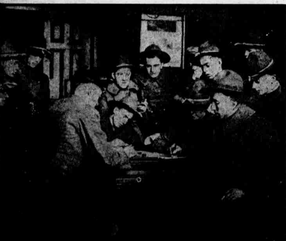
TRANSFERRING THE GUARDSMEN FROM SERVICE COME ON STEADILY AT THE