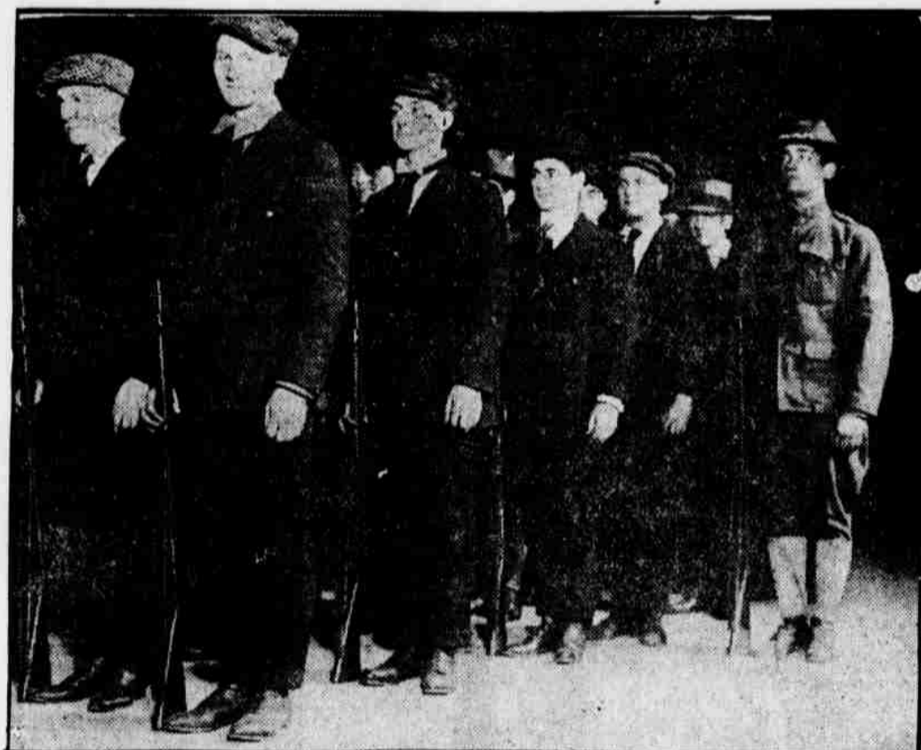
"THE AWKWARD SQUAD" LIVES UP TO ITS REPUTATION AT THE FIRST REGIMENT ARMORY