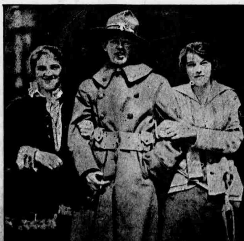
"GOOD-BY, DOLLIES, I MUST LEAVE YOU," WILL BE THIS LADY'S PARTING SONG