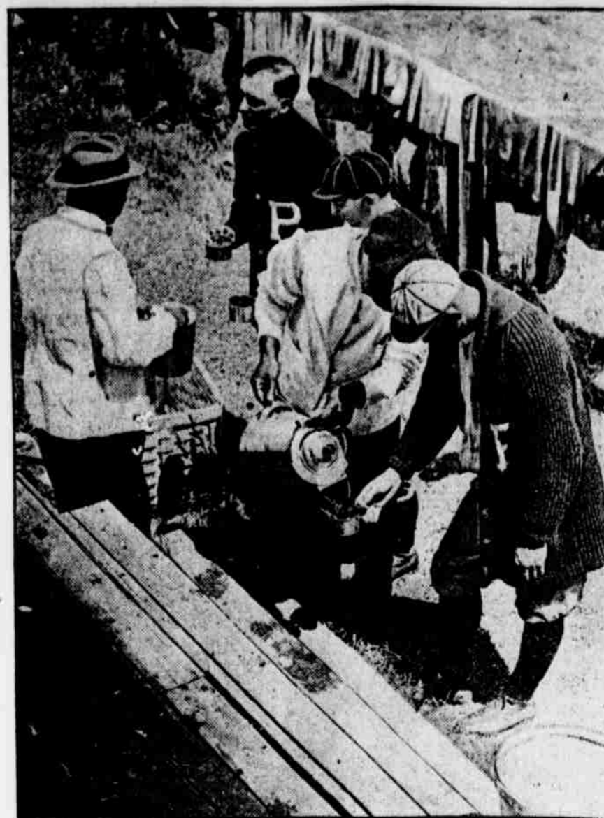
THAT'S WHY THEY CALL IT COFFEE POT PARK Being a lunch-hour intermission at the Southern training quarters of the Philadelphia baseball team.