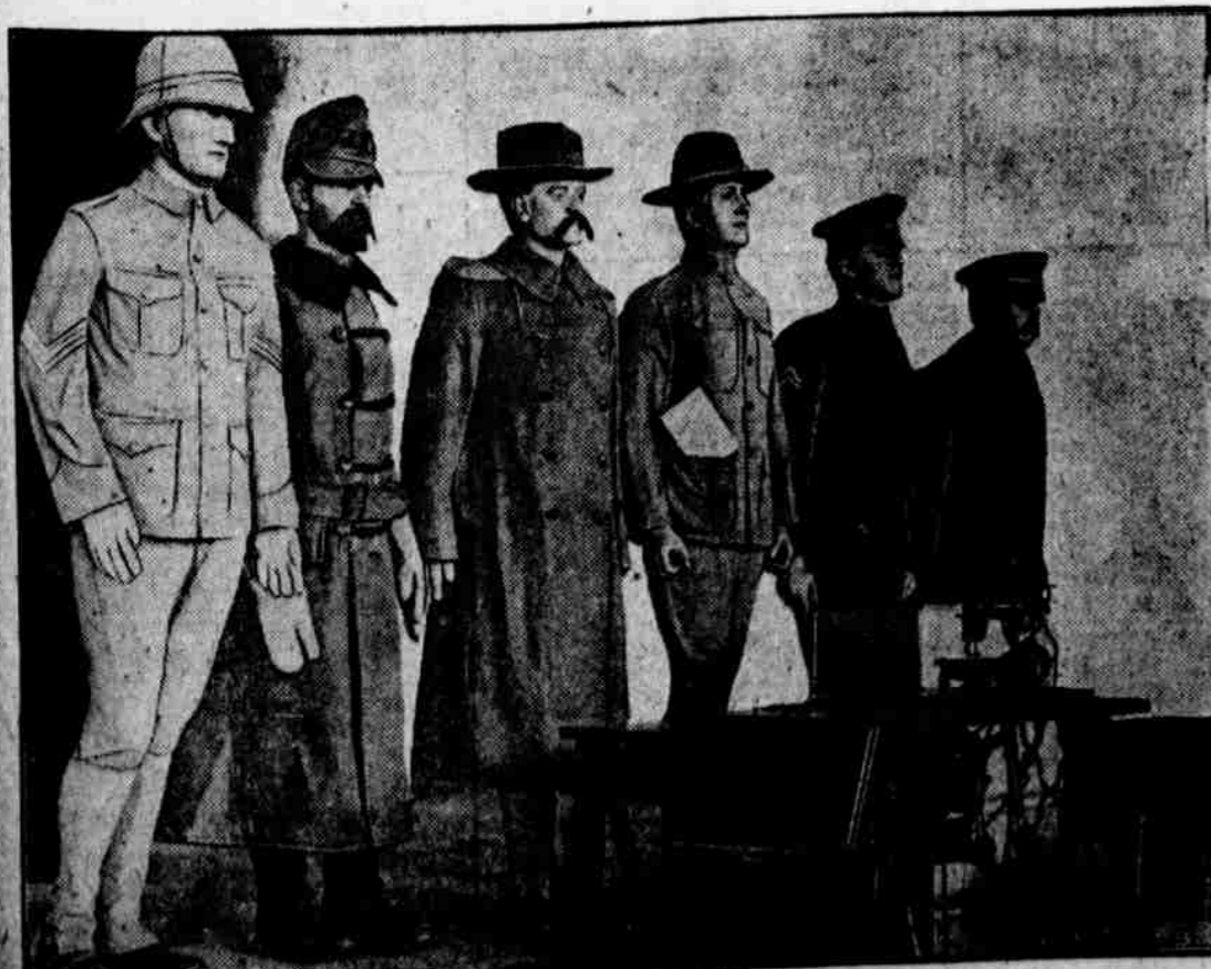
EASTER SUITS FOR UNCLE SAM'S SOLDIER BOYS Not made at the Schuylkill Arsenal but at outside factories adept needlewomen are busily working upon thousands of these latest types of army uniforms.