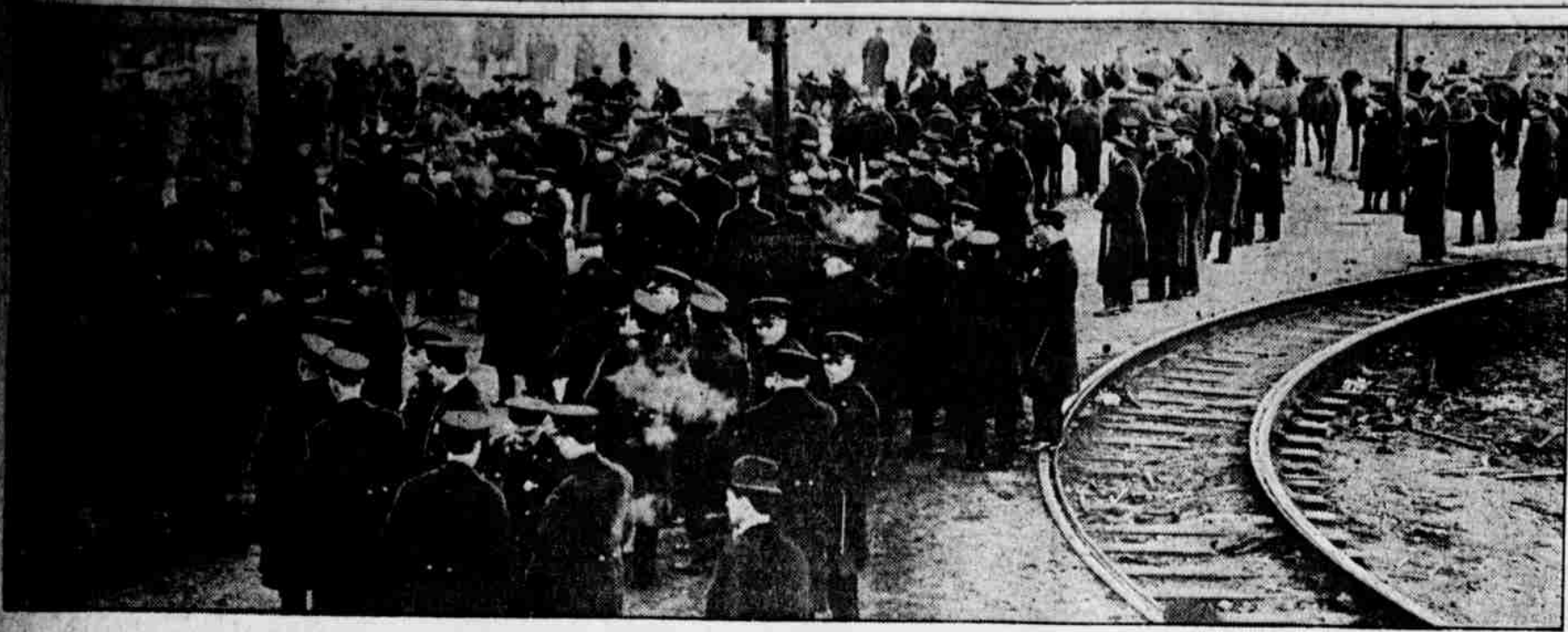
INTERNED GERMAN SAILORS HAD SMALL CHANCE TO ESCAPE During the transfer of the crews of the Prinz Eitel Fredrich and Kronprinz Wilhelm from their ships to the waiting cars today nearly 500 policemen re-enforced the regular guard at the Navy Yard.