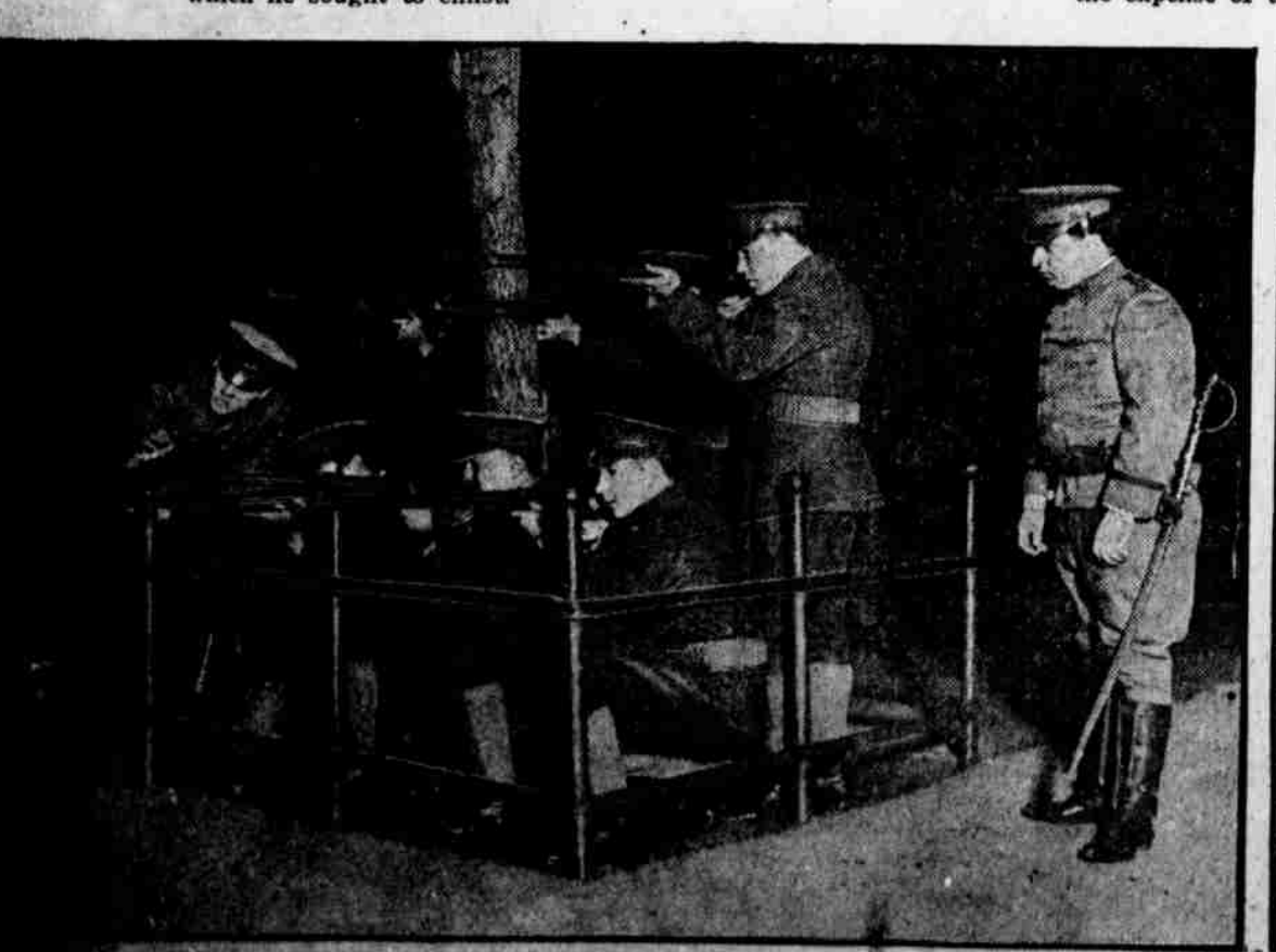
TALGAMS DEMONSTRATE THEIR LOYALTY TO UNCLE SAM Comprehensive belongs to the Columbus Volunteers of New York, com-