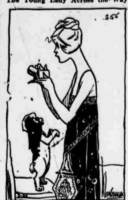
The young lady agross the way says this seems like a poor time to drop Latin and take up. Spanish in the schools when our commercial relations with Latin-America are just beginning to develop.