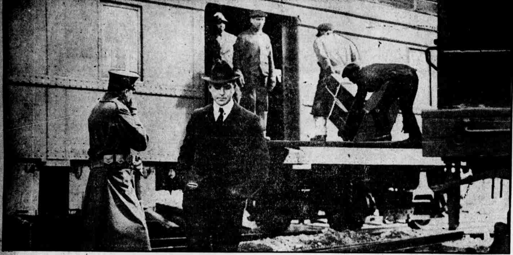
FIFTEEN CARLOADS OF BAGGAGE ACCOMPANY GERMAN RAIDERS SOUTHWARD Luggage weighing several tons was transferred from the two interned perman ships to cars standing on the siding at the north side of the Navy Yard. The work was done under the watchful eyes of marines.