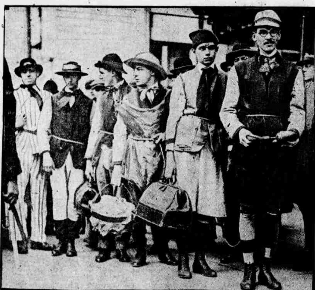
PITY THE POOR INITIATE IF HE'S JOINING THE "SATTELITES" No end of fun is had by the old members of this high school organization at the expense of their incoming brethren.