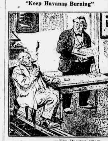
Auld Jock (to doctor who has left the room for a minute)—Here's your cigar, doctor; ah wis jist keeping her gaun till ye wud come back.