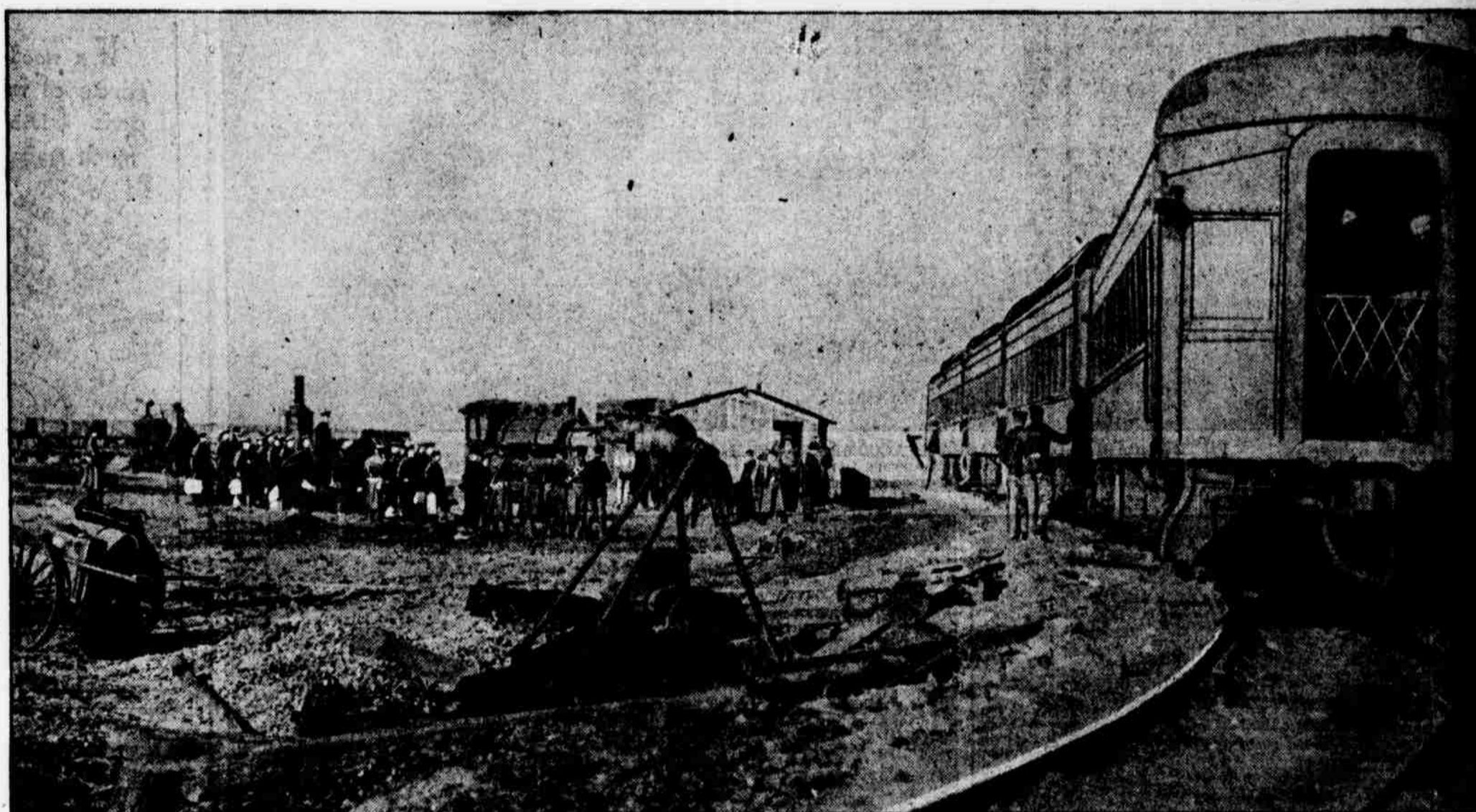
ESCORTING GERMAN SAILORS TO THEIR SPECIAL TRAIN Crews of interned liners going aboard cars backed up on Navy Yard siding under guard of marines and police. Freight cars loaded with baggage at right.