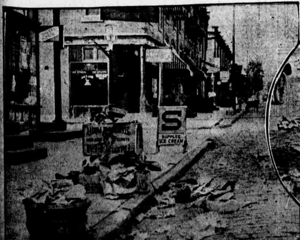
OBJECT LESSONS FOR MONDAY CONFERENCE DISCUSSION A few fragments from city highways which illustrate the purpose of today's consideration of "Clean Streets" at the New Century Club.