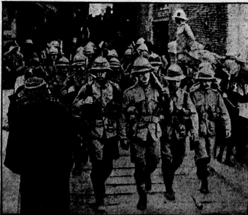
FIRST PHOTOGRAPH TO REACH THIS COUNTRY OF THE BRITISH

After it had been held fast for half an hour, a patient was removed and carried on a stretcher to the Jewish Hospital. The spot is on Thirteenth street between Loudon and Rockland.