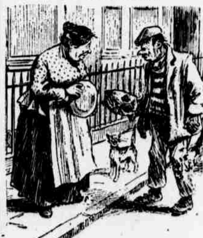
Not a Consideration

The Itinerant Fishmonger— Don't look nice, lady? Well, yer ain't buyin' 'im ter make a pet of 'im, are yer?