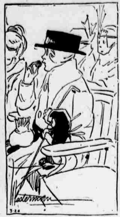
The Young Lady Across the Way

The young lady across the way says she saw in the paper that the coal miners might decide to walk out this spring, and you'd think they'd get enough exercise in their regular business.