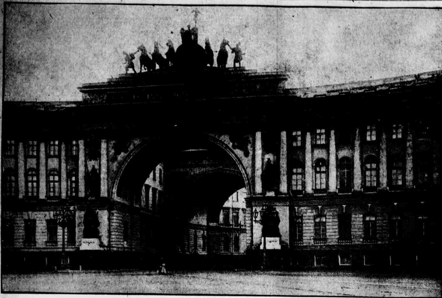
GATEWAY TO THE IMPERIAL WINTER PALACE IN PETROGRAD SEIZED BY THE REVOLUTIONISTS One of the most beautiful buildings in the world, it is to become the seat of the new democratic Government. The Assembly will meet there under the inspiration of the red flag.