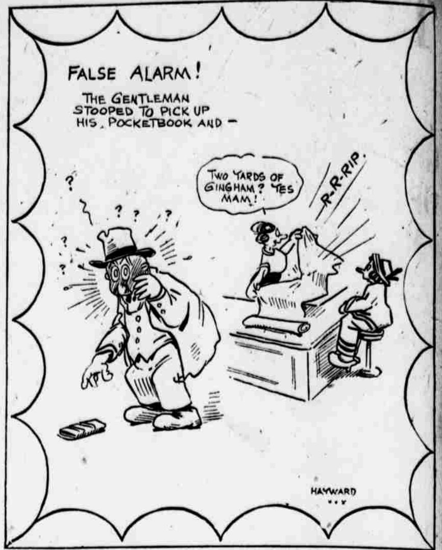
THE PADDED CELL

Miss Footlight—I have here a certificate from a doctor to the effect that I can't sing tonight. The Manager—Why go to all that trouble? I'll give you a certificate that you never could sing.