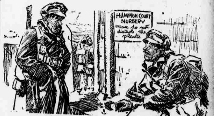
FORESIGHT AND THE WAR

"Uho Bill, watcher doin'?" "Plantin' a tulip, old sport." "Darn! You don't look a'ead, you don't. I've just been plantin' a acorn!"