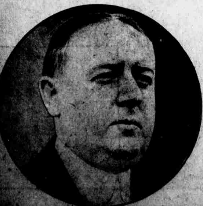
THE FLIGHT WHO IS HEADING THE

"A capable couple." "So?" "Yes, he is furnishing the house."