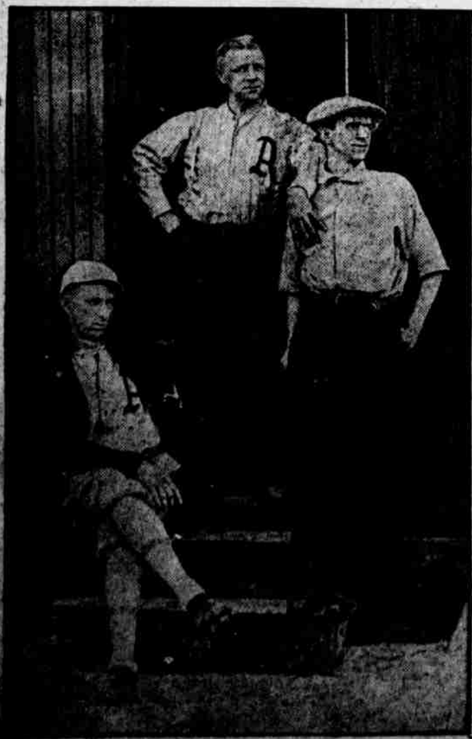
BEY KEEP THE MACKMEN IN TRIM