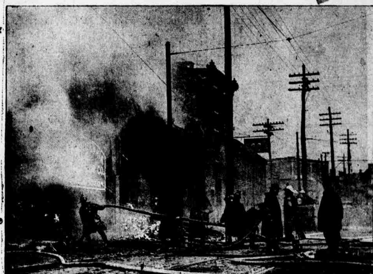
STUBBORN BLAZE IN KENSINGTON PLANT Smoke baffled firemen at noon today, when the Philadelphia Excelsior Company's establishment, on Beach street near Laurel, was seriously damaged by fire.