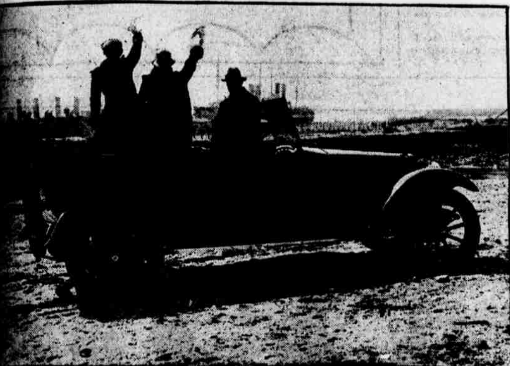
WAVING FAREWELL TO THEIR SAILOR SWEETHEARTS Fair Philadelphia girls signal a good-bye to members of the crews of the interned German commerce destroyers at League Island.