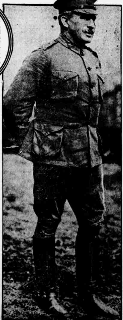
LEADER IN PREPAREDNESS Major General Leonard Wood, U. S. A., has done much to encourage the movement among Philadelphians.