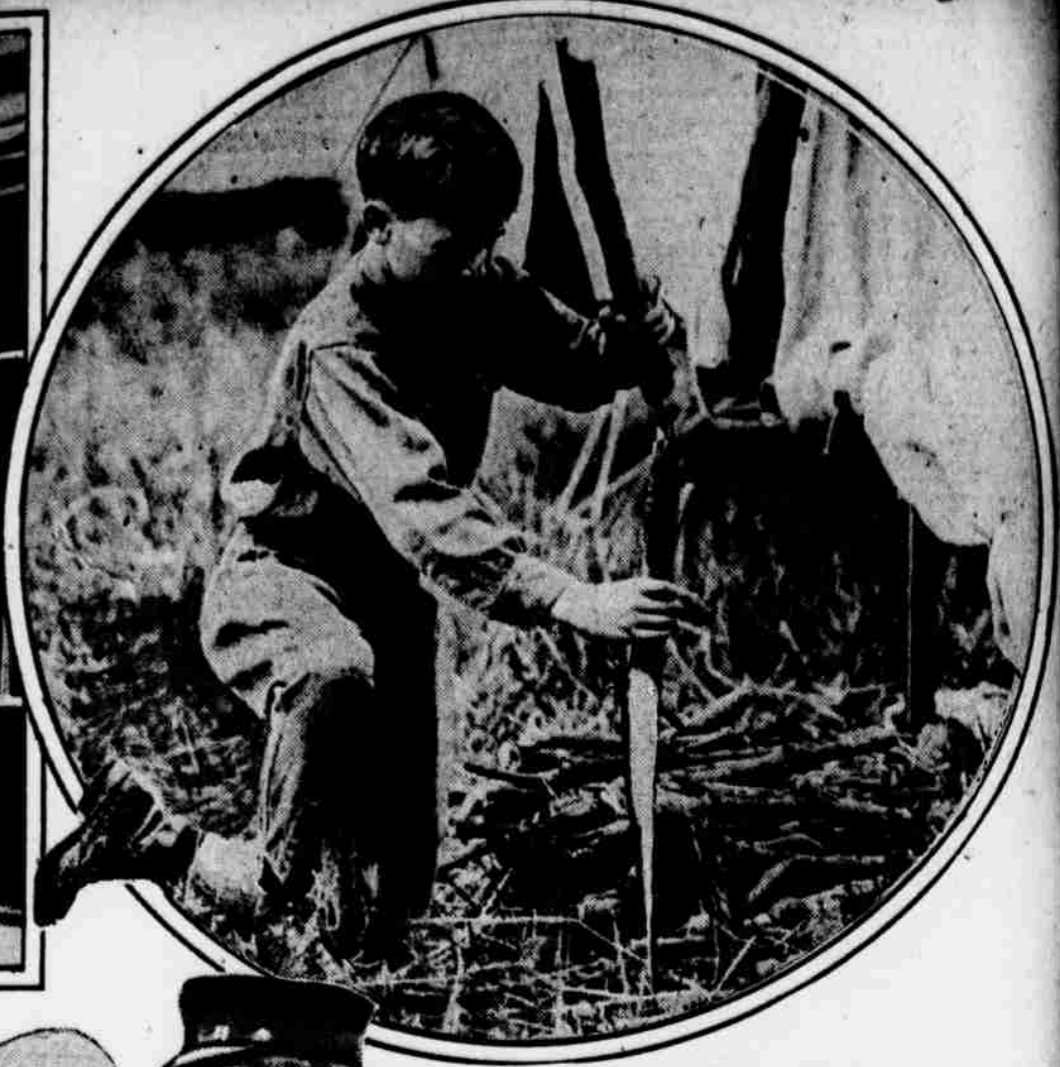
BOY SCOUTS ARE KINDLING SIGNAL FIRES Frequent drills and hikes have brought the several camps hereabouts to a high standard of military efficiency.