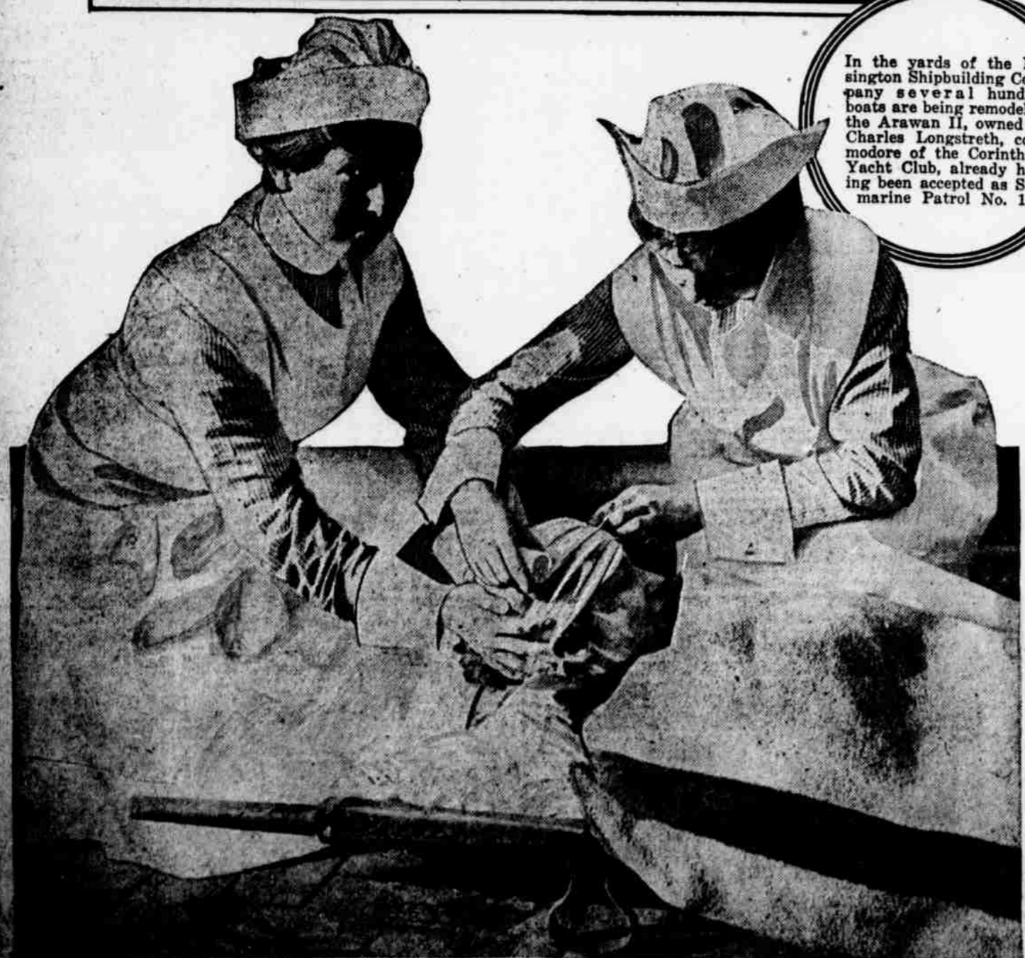
QUALIFYING AS "BATTLEFIELD ANGELS" Roosevelt Hospital nurses are demonstrating their fitness for service, having organized a preparedness band.