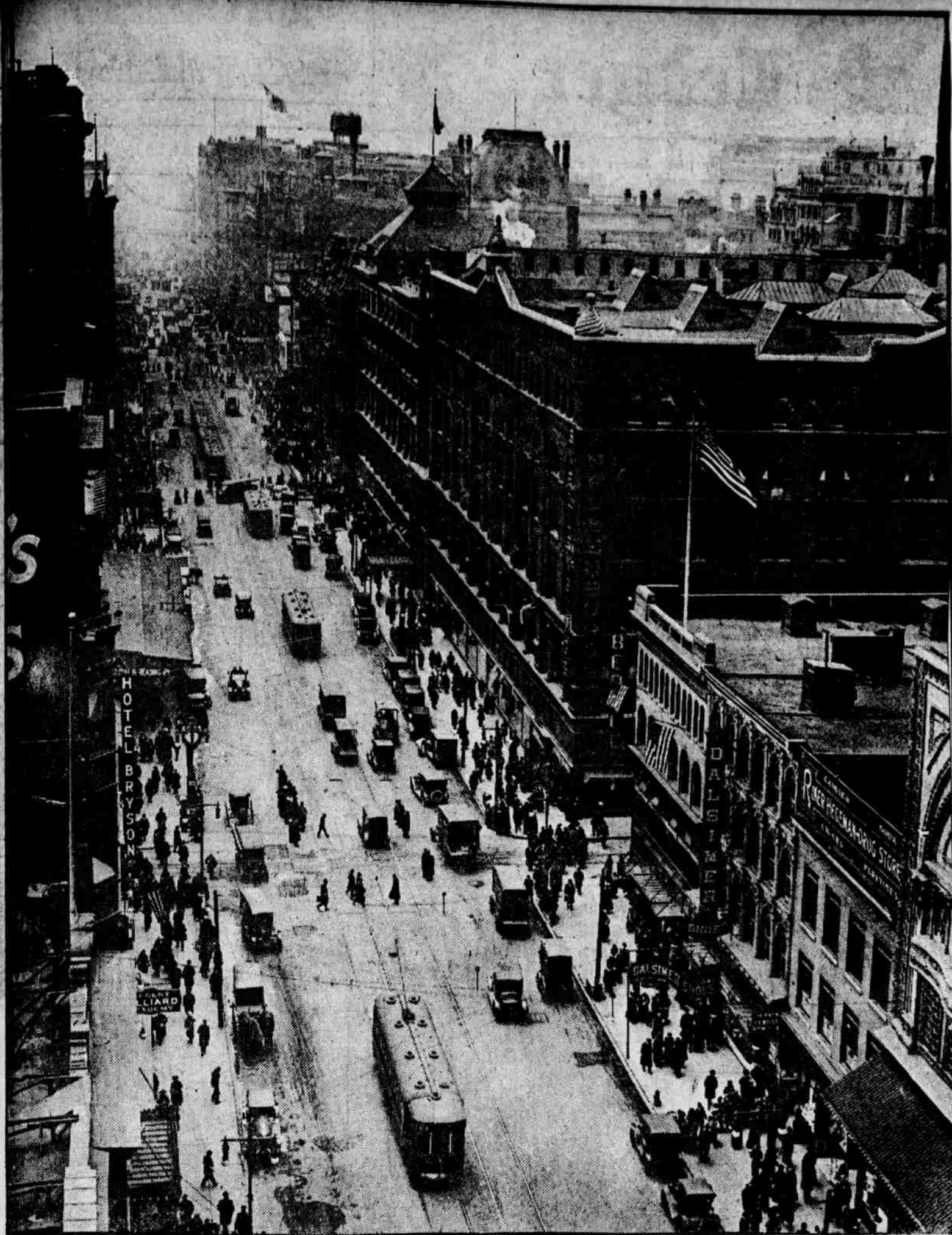
AS THE HIGH STREET OF WILLIAM PENN APPEARS FROM THE FOUNDER'S STATUE TODAY But the camera's eagle eye cannot visualize the equally busy passage of humanity below the shop-lined sidewalks.