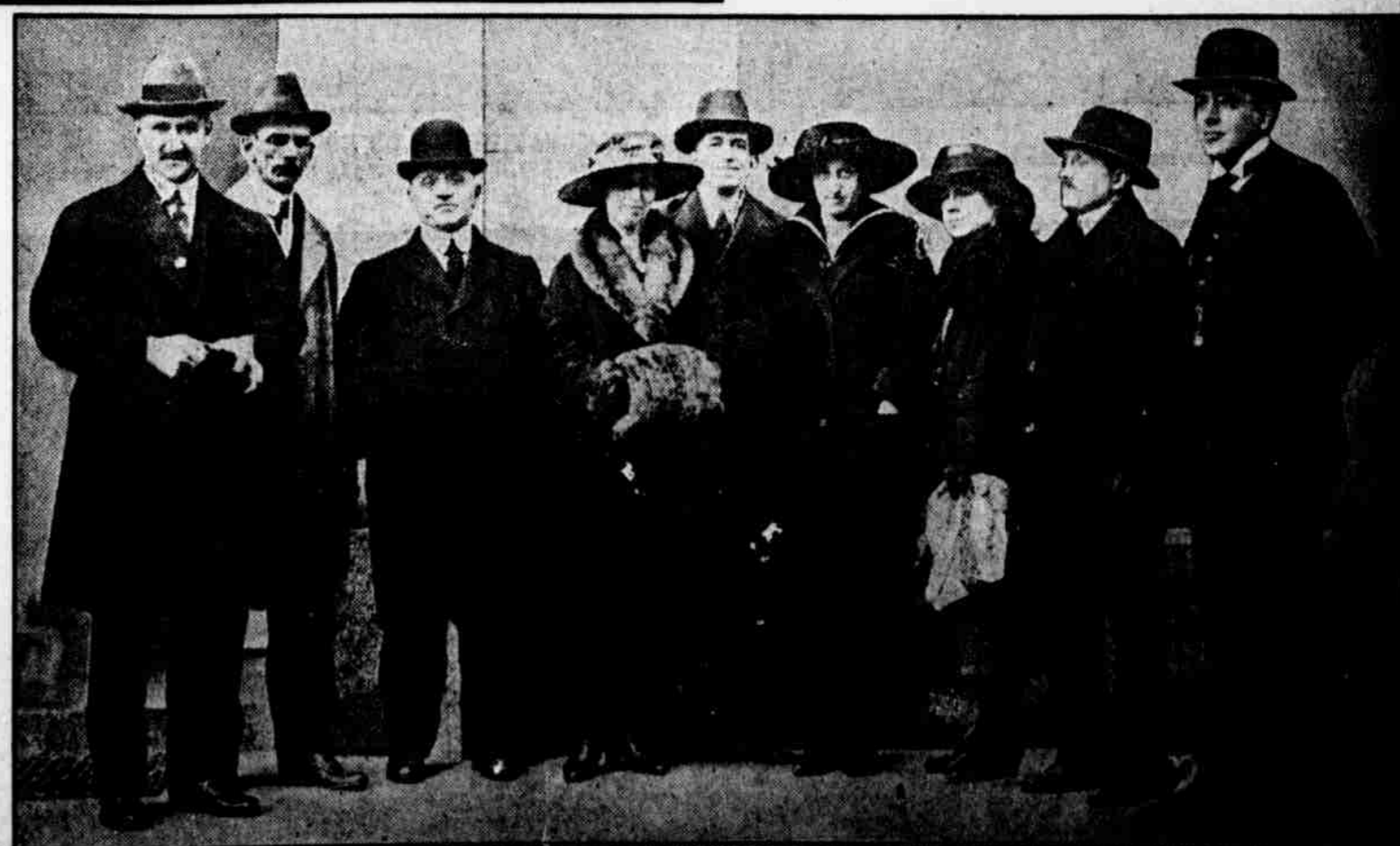
DIET SQUAD "SURVIVORS" WEIGHING IN