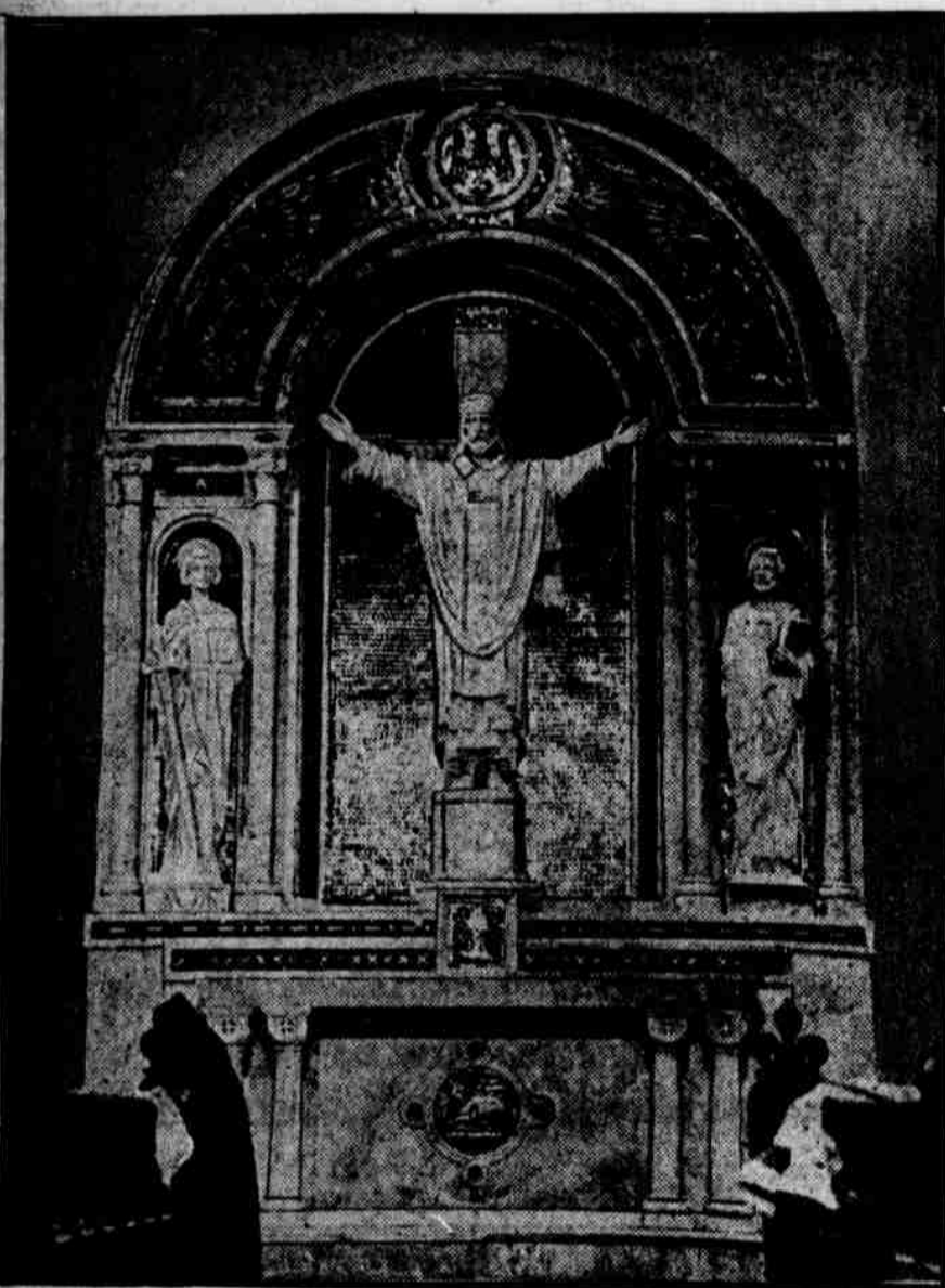
NEW ALTAR GIFT OF ANONYMOUS BENEFACTOR It was blessed and used for the first time yesterday at St. Michael's Chapel, 19th and Lombard streets.