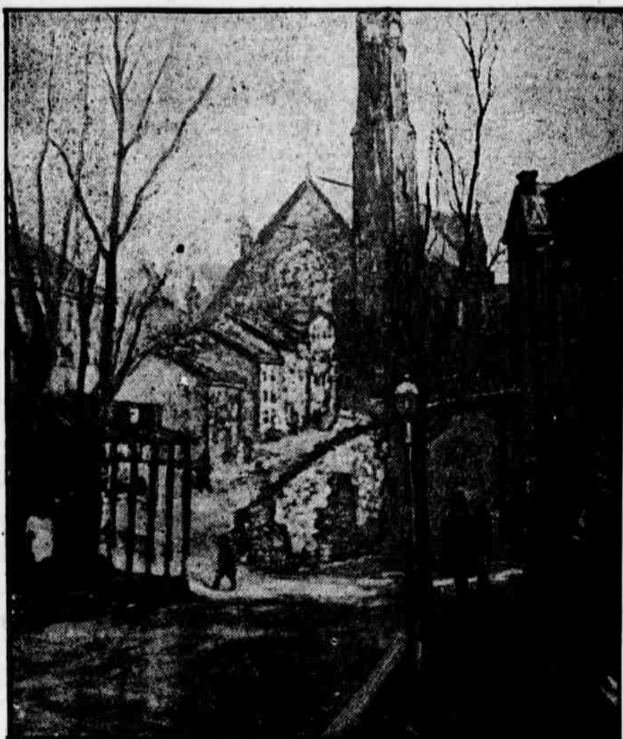
STREET IN MANAYUNK AS IT APPEARS ON CANVAS One of the interesting paintings of Philadelphia at the Academy of the Fine Arts exhibition, painted by C. Joseph Warlow.