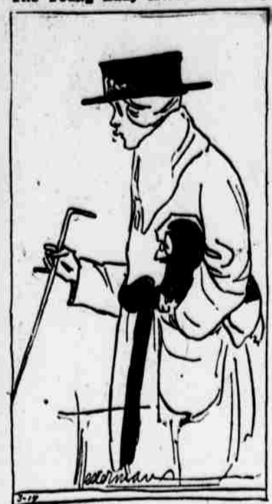
The Young Lady Across the Way

The young lady across the way says there's no place for snobs in a republic and the hot polloi should remember that the common people are every bit as good as they are and often better.