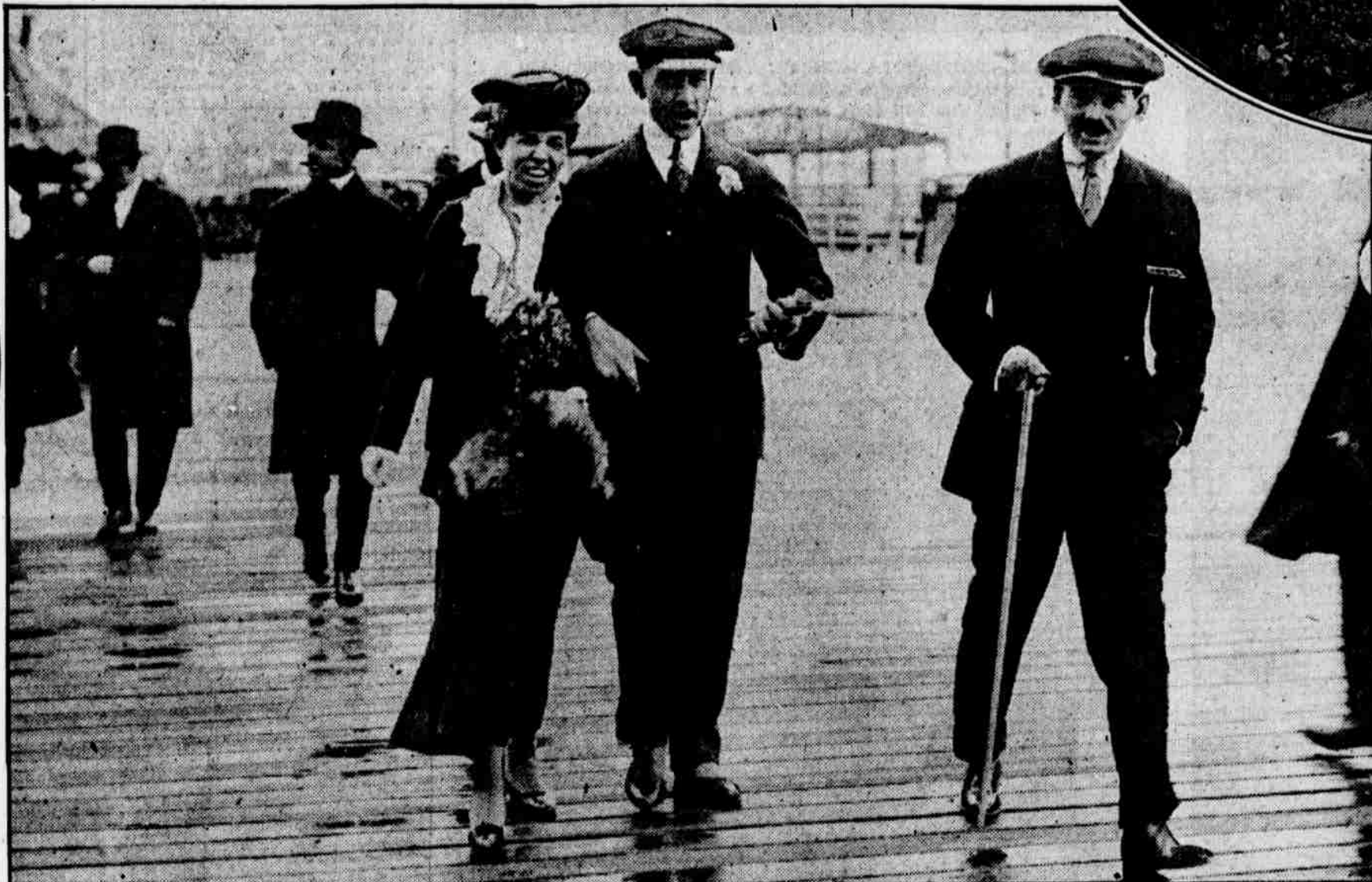
LURE OF THE SEA BECKONS PHILADELPHIA SOCIAL LEADERS