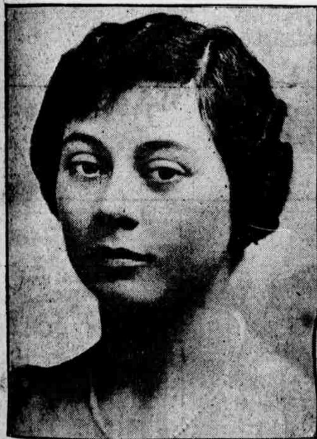
SOCIETY LEADERS HEAD GIRL SCOUT CAMPAIGN