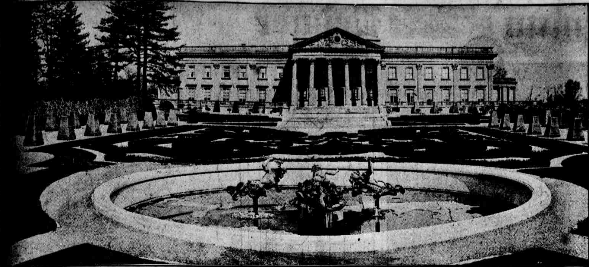
RARE FRENCH MARBLES AWAIT "UNVEILING" AT LYNNEWOOD HALL Two groups of garden statuary of the eighteenth century period by Gillet, recently purchased by Joseph E. Widener at a price said to have been $200,000, border the fountain on the Widener estate at Elkins Park