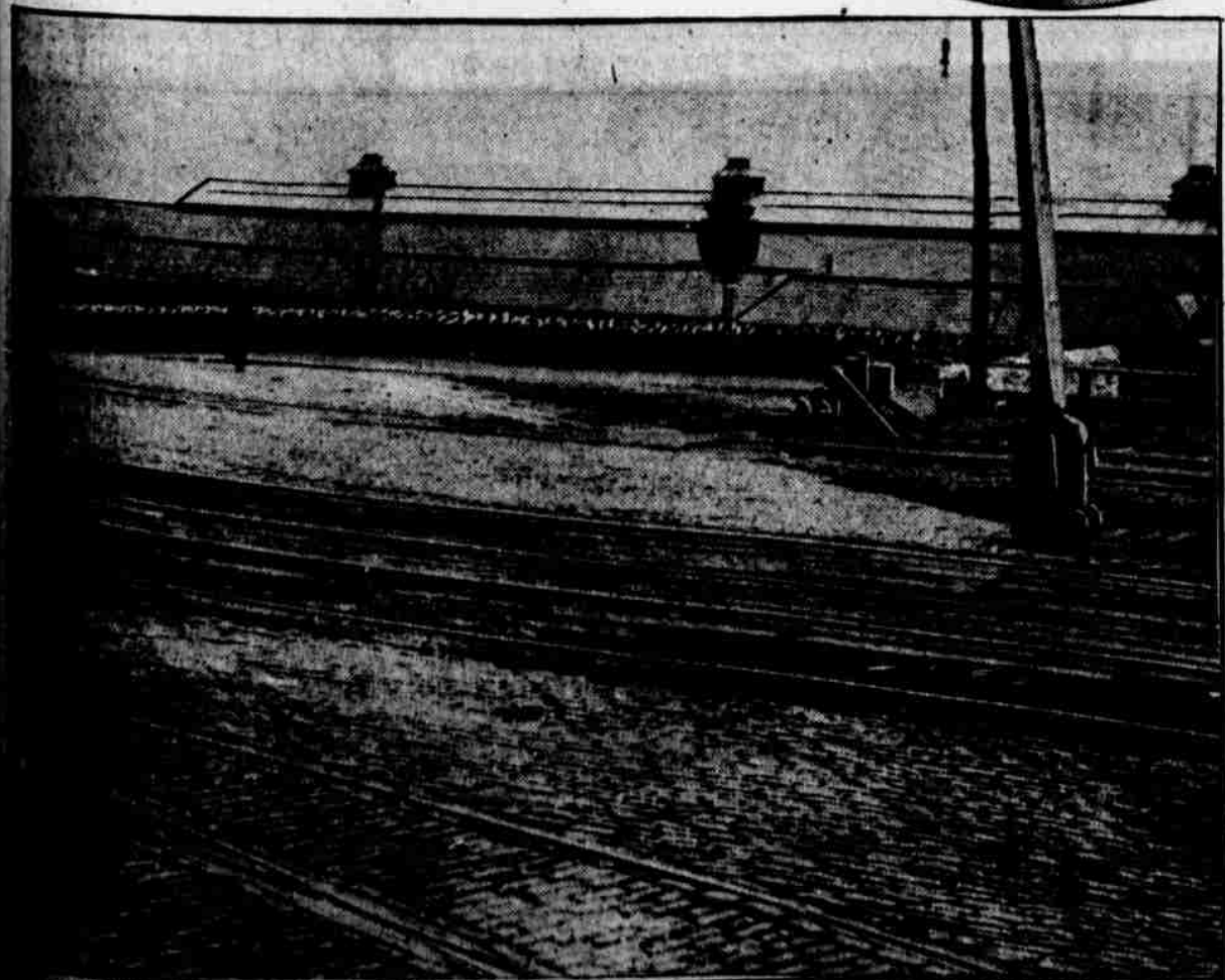
A DEATH-TRAP WHOSE OWN DOOM IS PLANNED

Truckload of songbooks leaving Philadelphia as part of gigantic consignment bound for Billy Sunday's New York campaign.