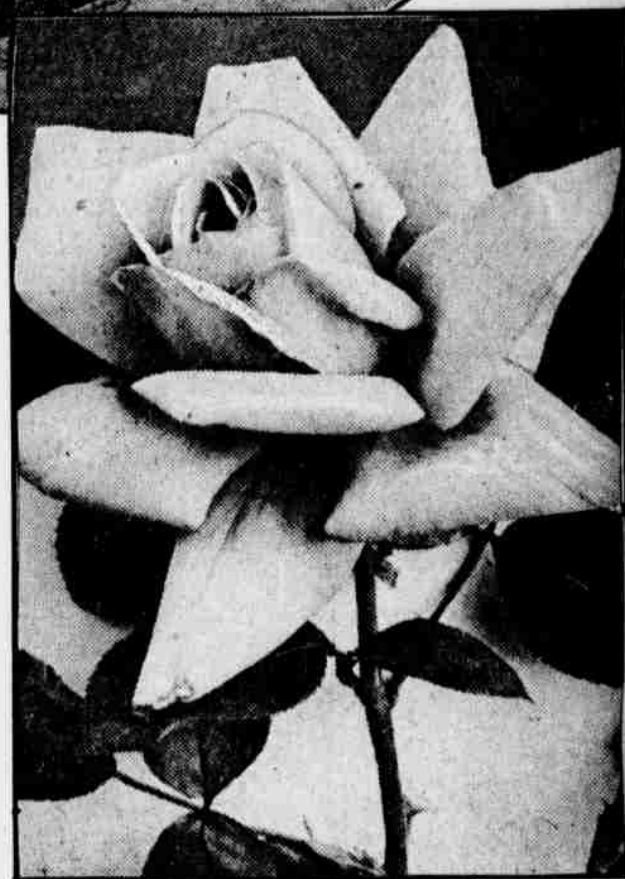
THEY ARE REAL AMERICAN BEAUTIES Roses of that name surround the little maiden, while below them is the "Los Angeles," also to grace the National Rose Festival, which opens tomorrow.