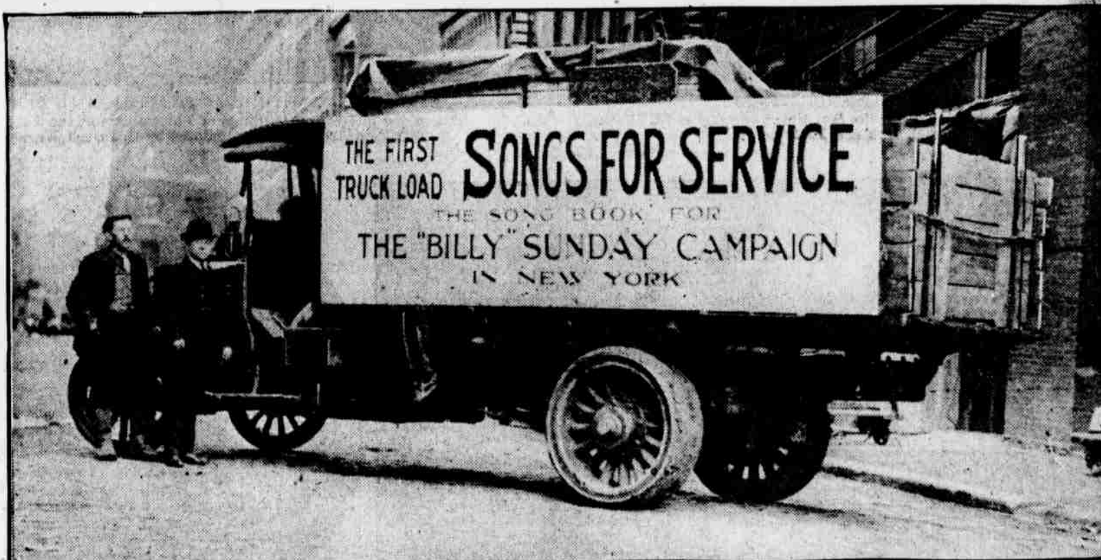
TONS OF MUNITIONS FOR LYRICAL ASSAULT UPON SATAN

Truckload of songbooks leaving Philadelphia as part of gigantic consignment bound for Billy Sunday's New York campaign.