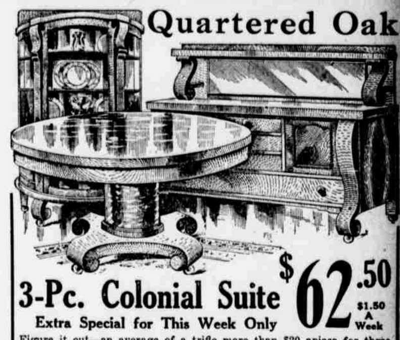
Figure it out-an average of a trifle more than $20 apiece for three massive, beautiful pieces of Dining Room furniture, as illustrated Any one of these pieces is worth $30 each. Terms only $1.50 a week. Come and see this beautiful Suite.

722-724 Market St. Open Saturday Evenings