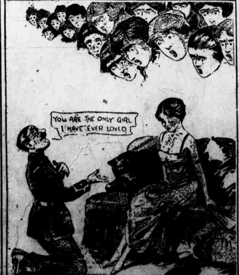
These very unclean-for spooks that appear when you are alone.