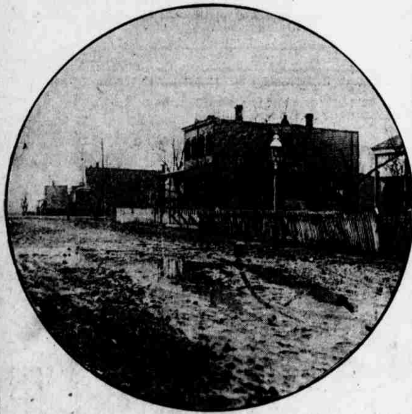
ANOTHER OF PHILADELPHIA'S WATERWAYS Residents in this neighborhood, Laycock avenue near Eighty-eighth street, say they have appealed to the city authorities for relief, but without avail.