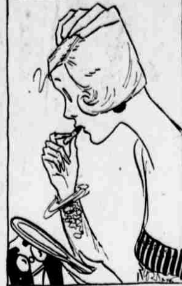
The young lady across the way says that all literature contains nothing finer than Lincoln's address at Valley Forge.

All in the Family "Well, come in, son. What do you want?" "Father, I think it only fair to tell you that I want to borrow fifty cents; I would rather owe it to you than to some rank outsider."—The Lamb.