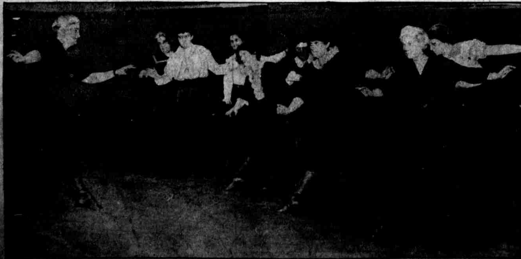
THE CONTENTION THAT DANCING NOWADAY, EVEN OF THE ESTHETIC KIND, IS NOT CONFINED TO THE DANCEFUL WIVES THIS ENTHUSIASTIC CLASS AT THE NEW CENTURY CLUB