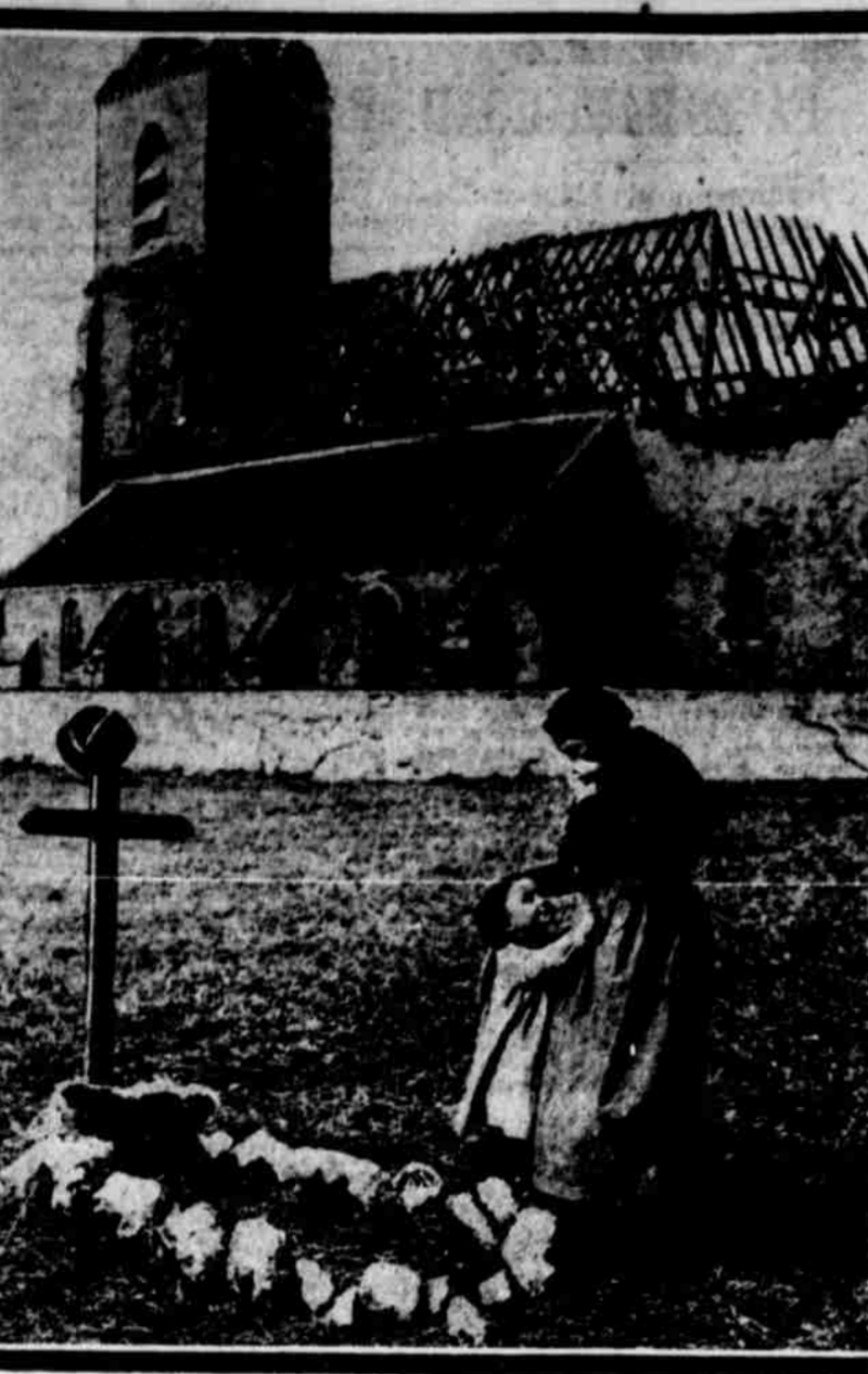
Her native village in the Champagne once more in the hands of the French, the peasant returns to find the grave of her son beside the ruined village church.