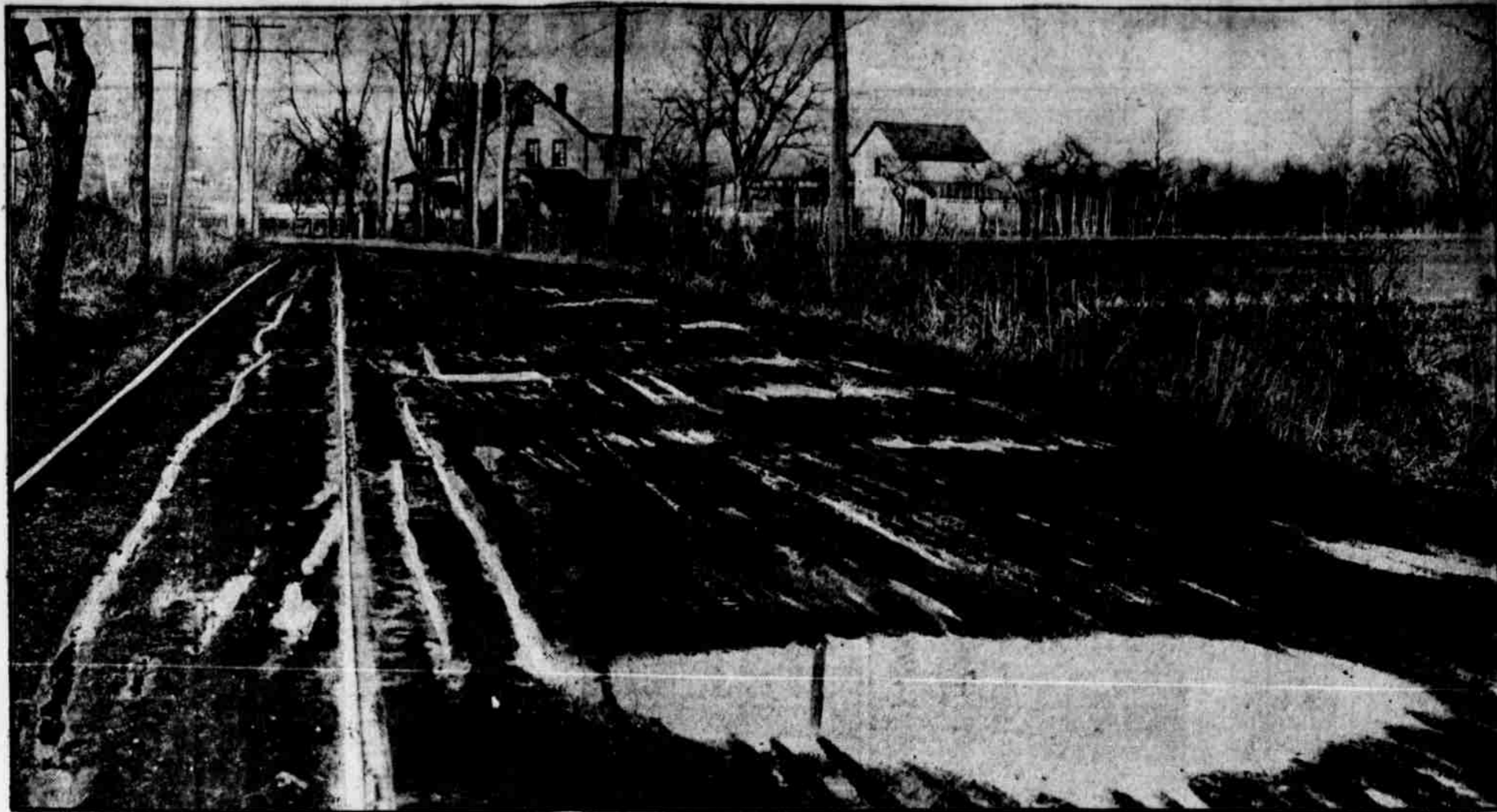
WAR NOTE: BAD ROADS RENDER PHILADELPHIA IMMUNE FROM CAPTURE

Approach, even by friendly force, is well-nigh impossible from this Holland-like bit of the old Lazaretto road, between Prospect Park and Essington