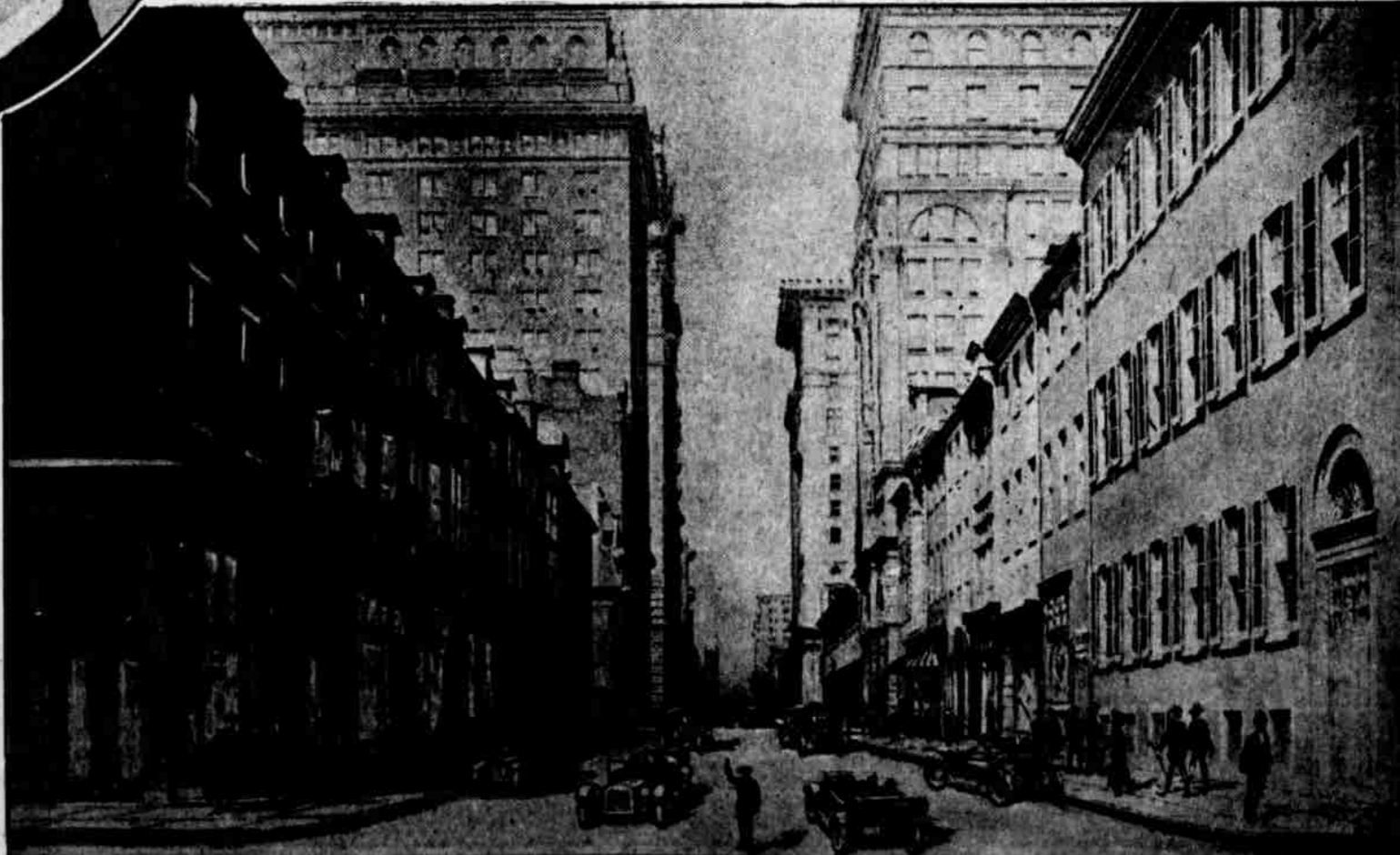
AN IDEALISTIC CITY SHOPPING CENTER Walnut street west from Thirteenth, trackless, wireless and with signs, awnings and other obstructions removed, the sidewalk narrowed to permit wider roadway, a project of the Walnut Street Business Association.