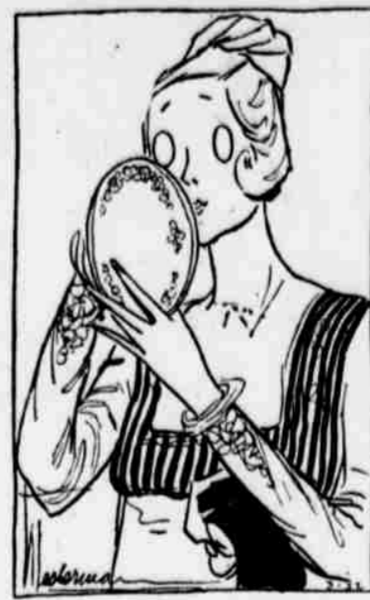
The Young Lady Across the Way

The young lady across the way says she doesn't see how it is possible for the Government to prepare a White Book that can be read as she has always understood that ink of some color has to be used to make the type visible.