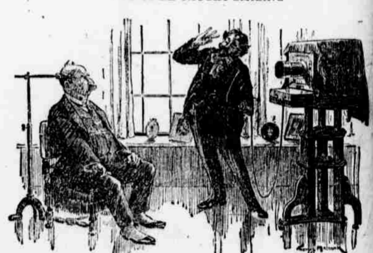
NOT TO BE CAUGHT SMILING

Photographer—Might I suggest the expression be a little less severe? Sitter—No, sir! This portrait is for my nephew, and if he sees me looking pleasant he'll write for money.