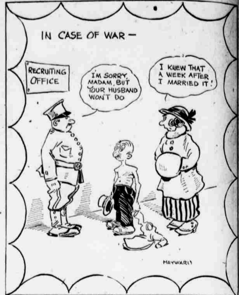
THE PADDED CELL

Mean Thing She frowned on him and called him Mr. Because in fun he merely kr. And then in spite, The following night, The naughty Mr. kr. sr. —Cornell Widow.