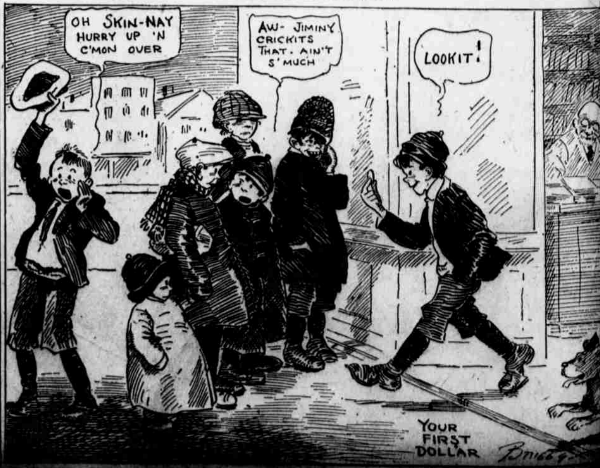
THE DAYS OF REAL SPORT

Photographer—Might I suggest the expression be a little less severe? Sitter—No, sir! This portrait is for my nephew, and if he sees me looking pleasant he'll write for money.