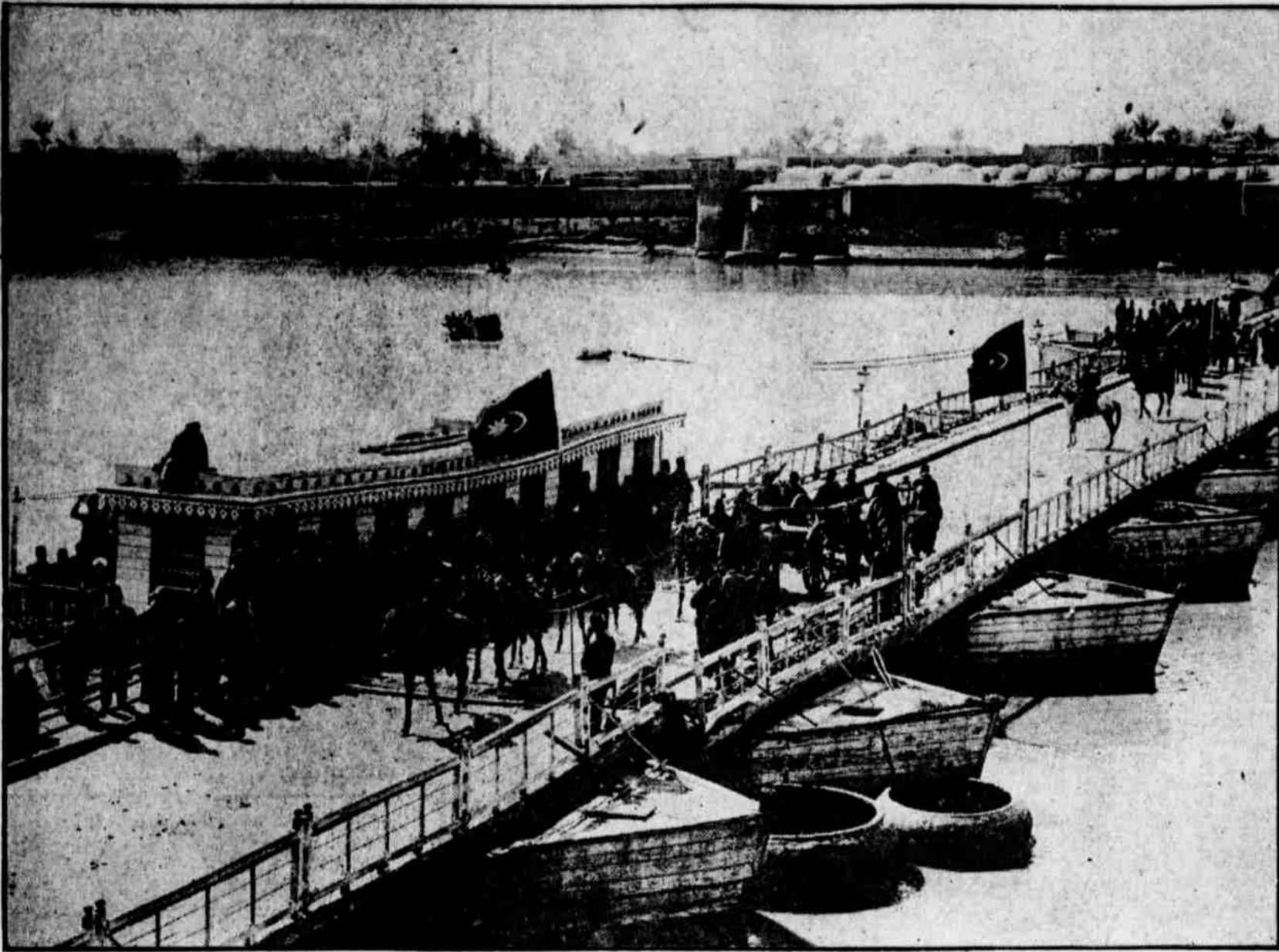
BAGDAD, CITY OF THE CALIPHS, NOW IN BRITISH HANDS Picturesque approach to the Mesopotamian metropolis, whose capture by General Maude is officially announced.