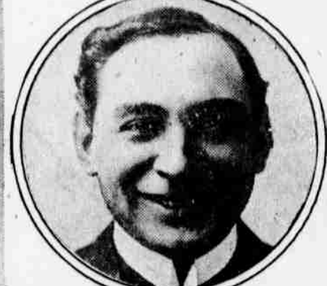
MITCHELL LEWIS HAS MADE A HIT IN "THE BARRIER"