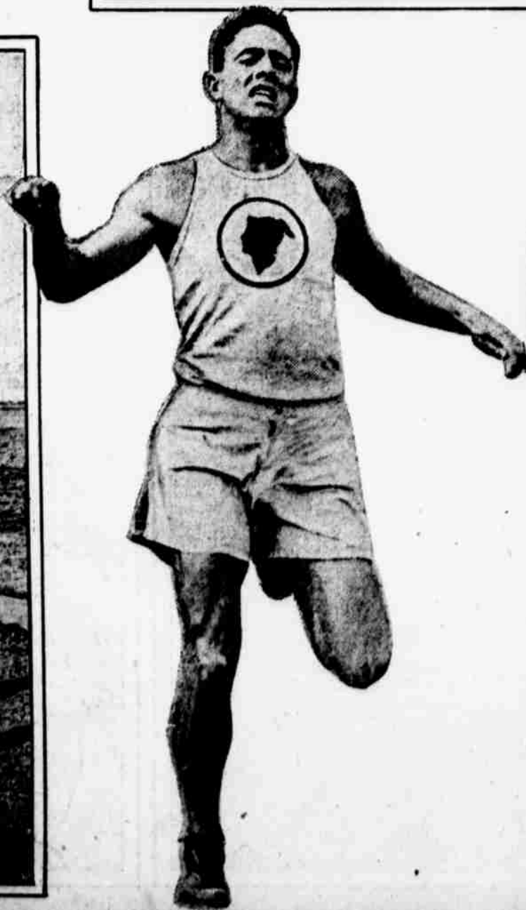
TED MEREDITH MAY BE RELIED UPON TO DEFEND HIS OWN RECORD AS A QUARTER-MILER