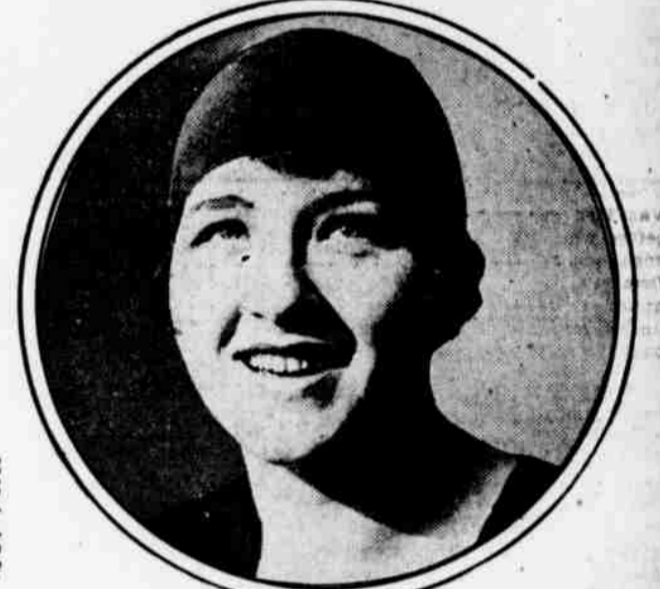
OLGA DORFNER, CHAMPION SWIMMER, IS TRAINING FOR AN EXHIBITION IN DETROIT