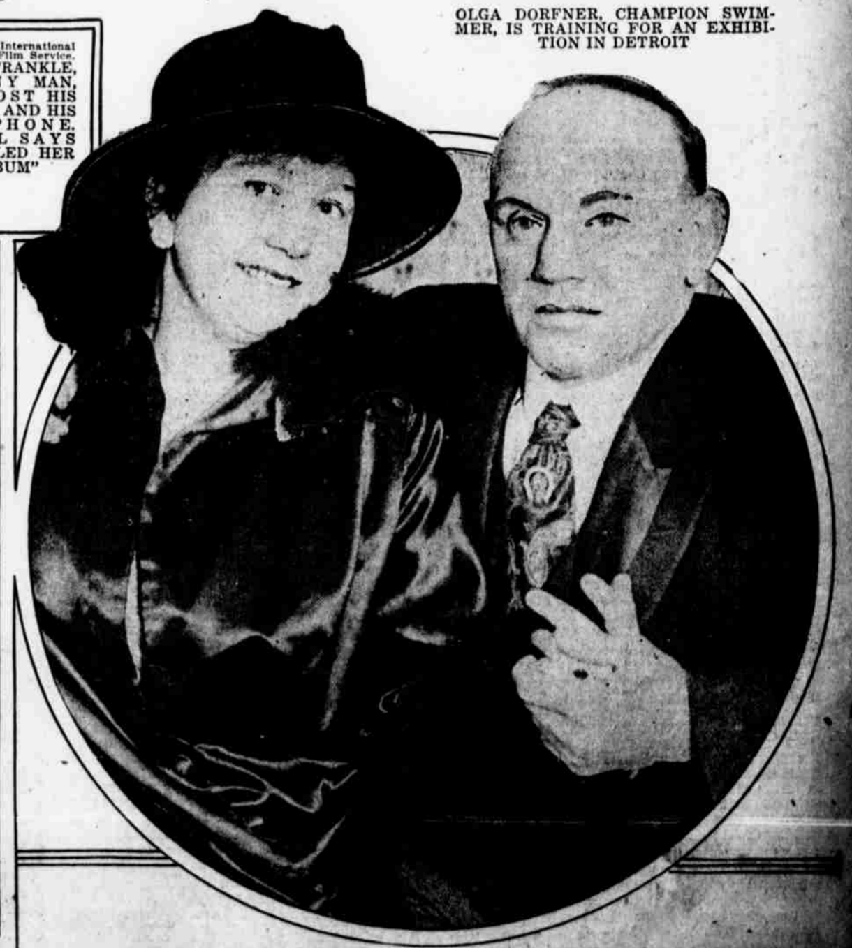
NOW IT'S "BOB" FITZSIMMONS WHO IS GOING INTO THE EVANGELIST BUSINESS. AT LEAST HIS NEW WIFE SAYS HE IS