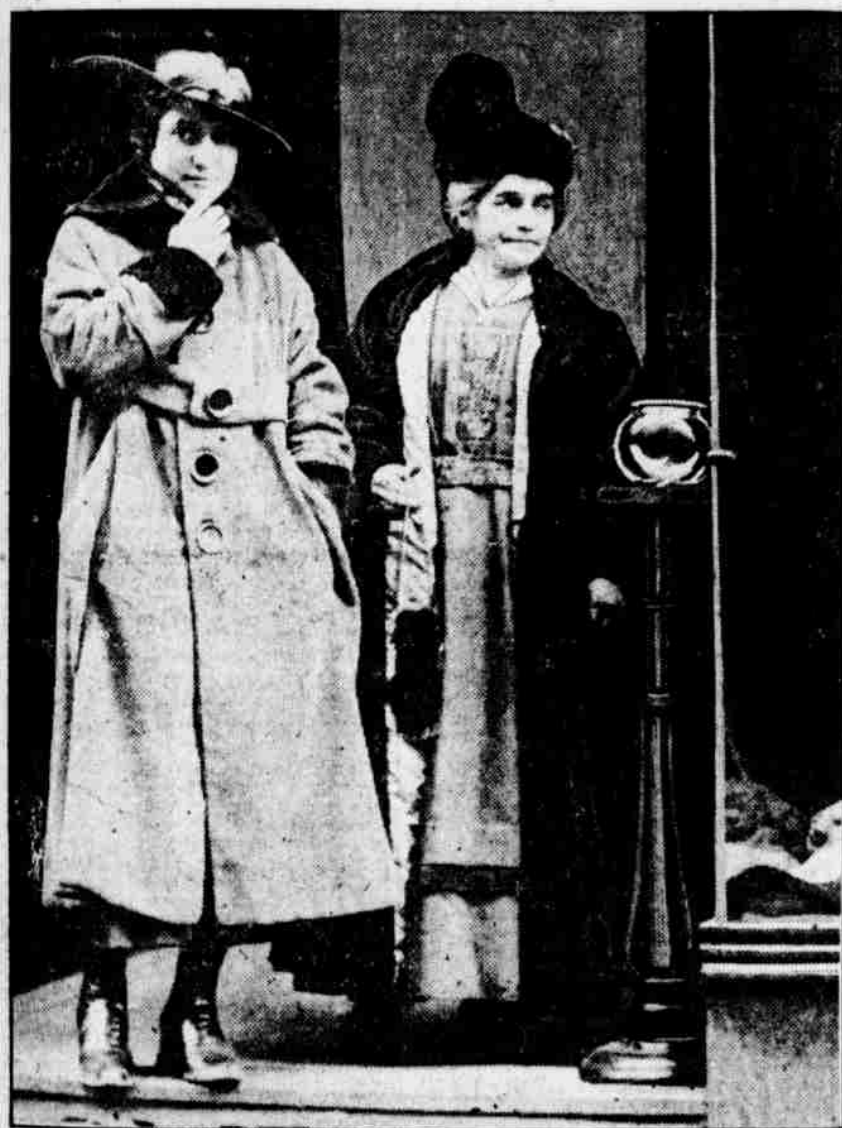
WOMEN CONDUCT SELF-SACRIFICE CAMPAIGN Members of the Jewish Zionist movement collect contributions at 821 Chestnut street to provide medical aid for war sufferers in Palestine.