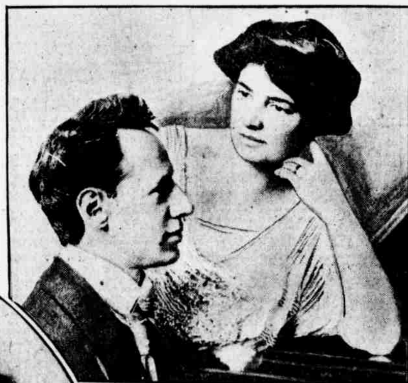
MARK TWAIN'S DAUGHTER A MAIN LINE RESIDENT

The noted pianist, Ossip Gabrilowitsch, and his wife, formerly Miss Clara Clemens, have taken up their abode at Haverford, adding considerably to Philadelphia's prestige as an artistic center.