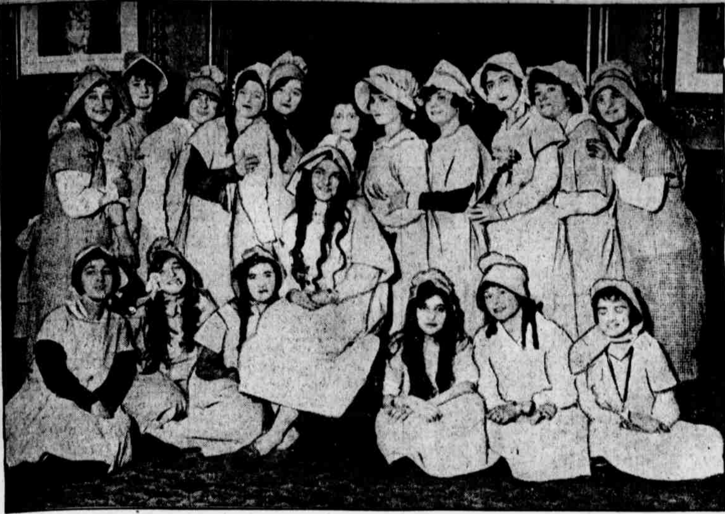
BIG SISTERS ARE BIG HIT AS MINSTRELS The Junior Club of Adath Jeshurun Synagogue provided a treat for those who were fortunate enough to witness the performance.