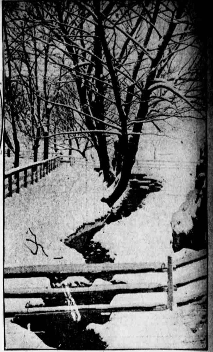
A VIEW THAT DEFIES THE ARTIST'S BRUSH A snow-clad brook out Radnor way taken from its early March concealment at the camera's behest.