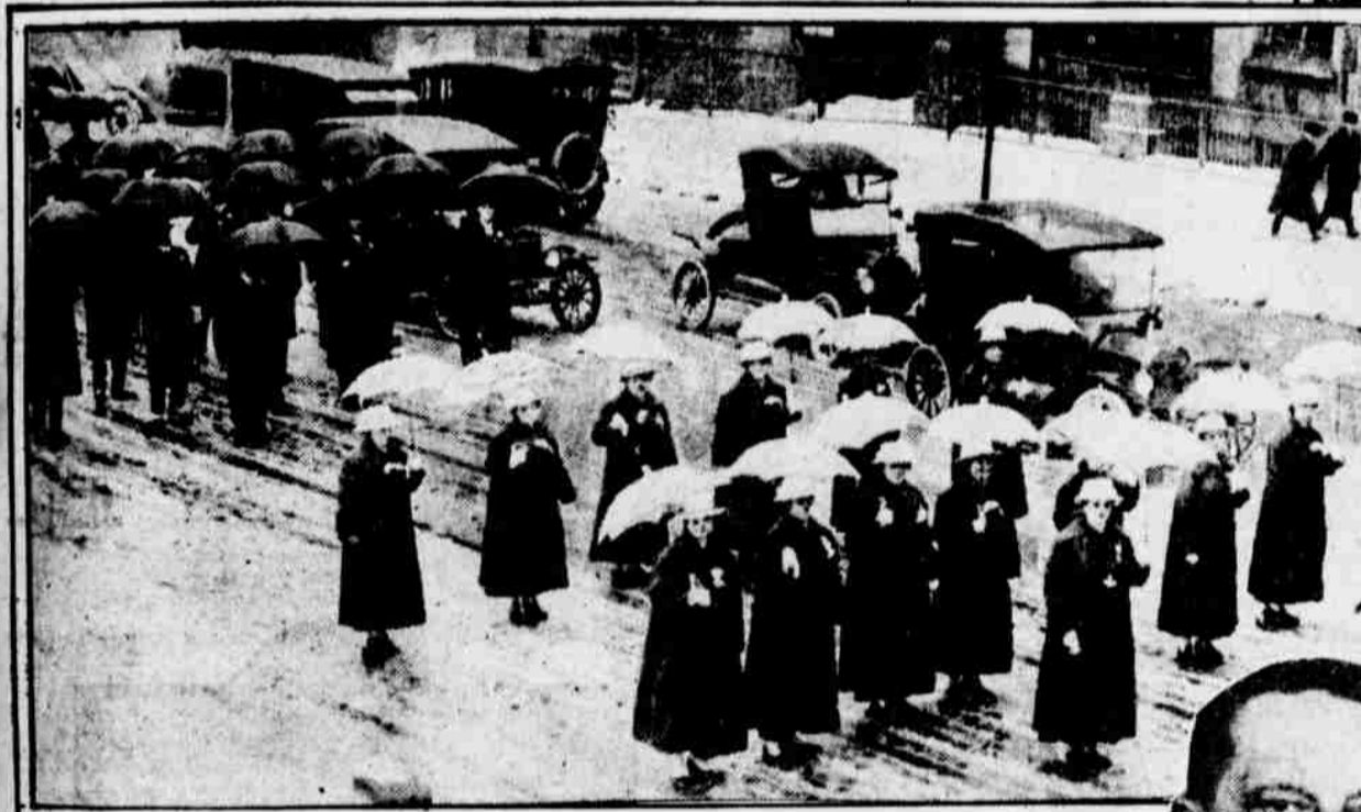
WOMEN MEMBERS OF THE JEFFERSON MARCHING CLUB HIKING ALONG BROAD STREET ON THEIR WAY TO THE STATION AND WILSON'S INAUGURATION