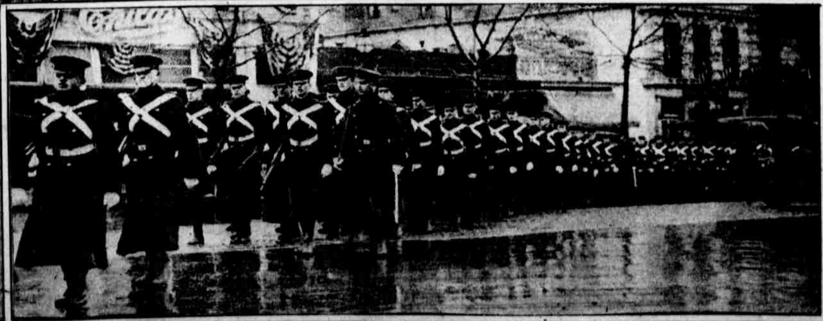
THE BATTALION OF CADETS FROM THE CULVER MILITARY ACADEMY CONTRIBUTED A MUCH-NEEDED DASH OF SPLENDOR TO THE GLOOMY MARCH DAY