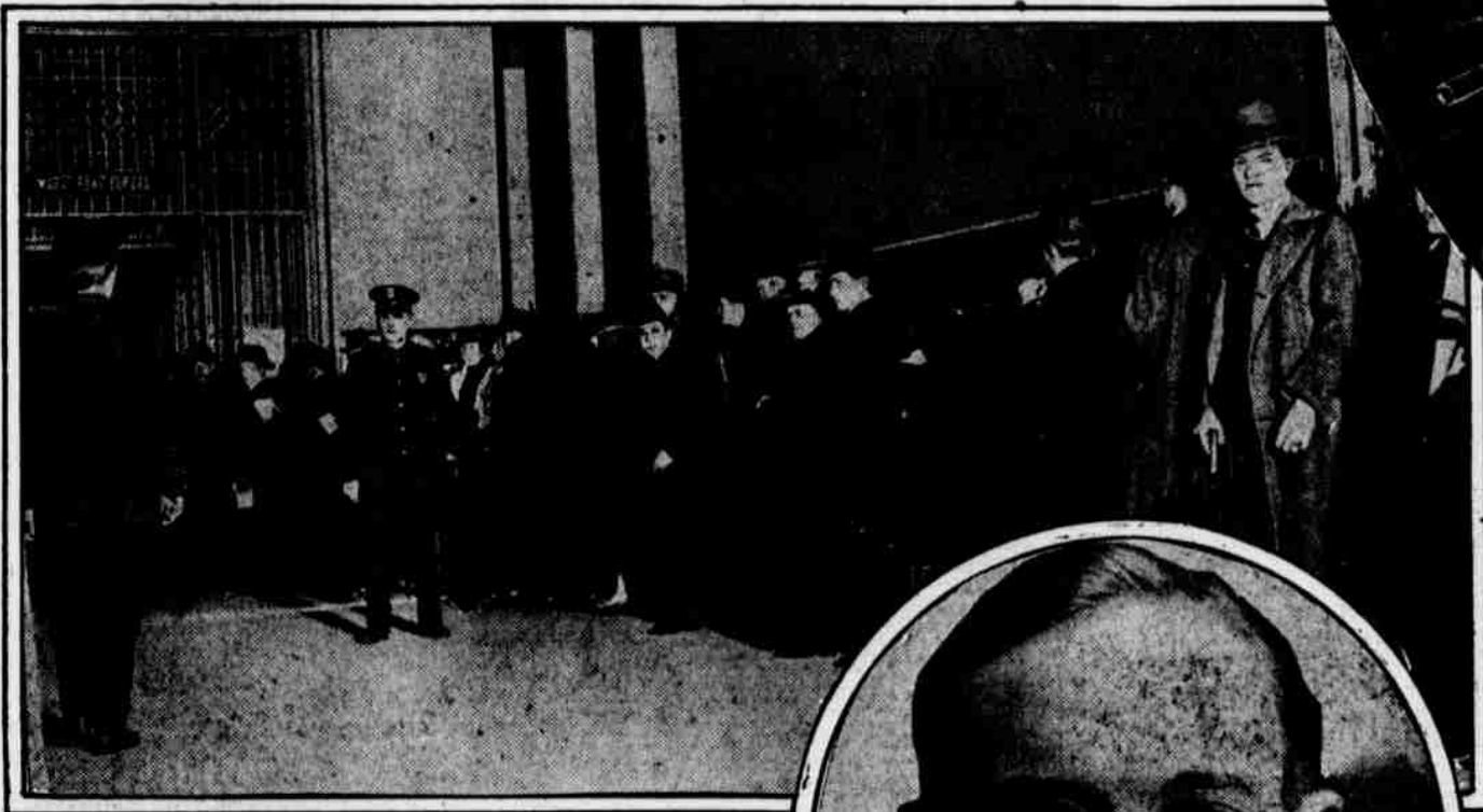
HOUSE OWNERS IN RUSH AT CITY HALL TO PAY TAXES ON WATER METERS DUE THE FIRST OF THE MONTH