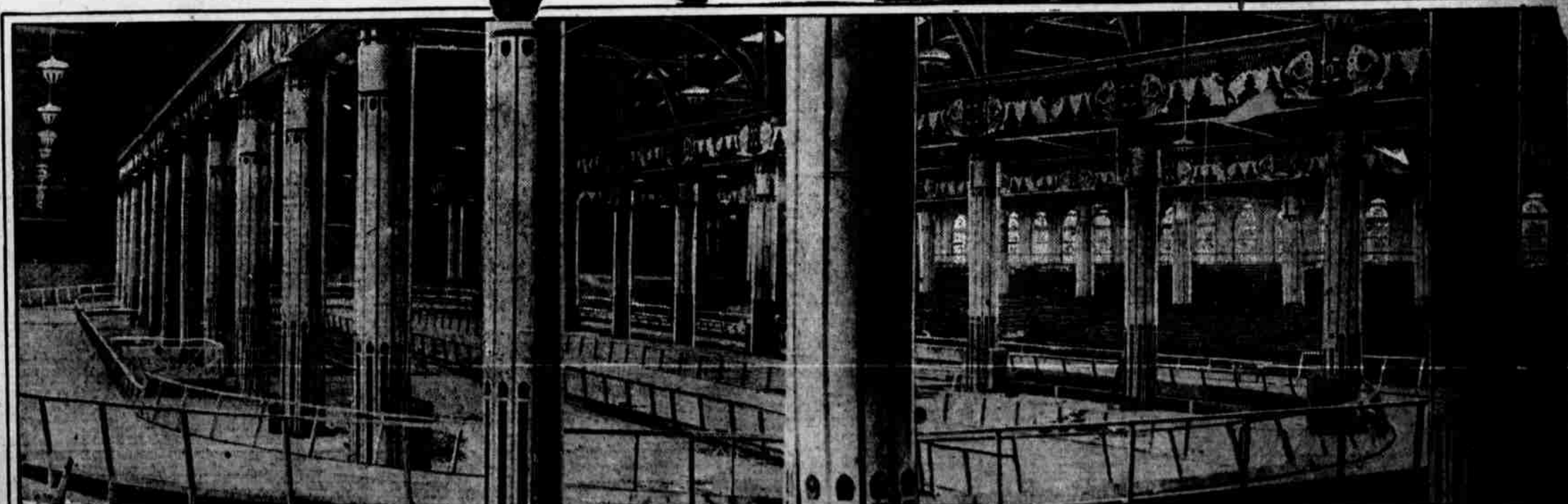
TRACK TRANSFERRED FROM THE MEADOWBROOK CLUB TO THE COMMERCIAL MUSEUM, THIRTY-FOURTH STREET BELOW SOUTH, ON WHICH SPEEDY RUNNERS WILL COMPETE AT THE INDOOR INTERCOLLEGIATE MEET SATURDAY OF THIS WEEK