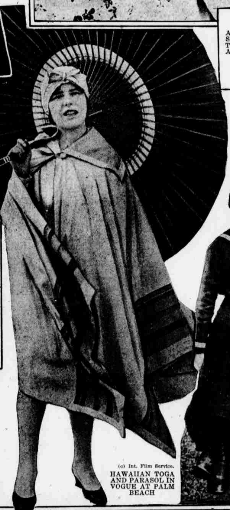
HAWAIIAN TOGA AND PARASOL IN VOGUE AT PALM BEACH