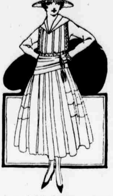
A practical frock of mauve crepe meter, with bayadere sash

THE bayadere sash is featured on many of the smart frocks. It appears in a modified form on this attractive model of mauve crepe meter. The bodice is buttoned and trimmed with bands of dull gold embroidery.