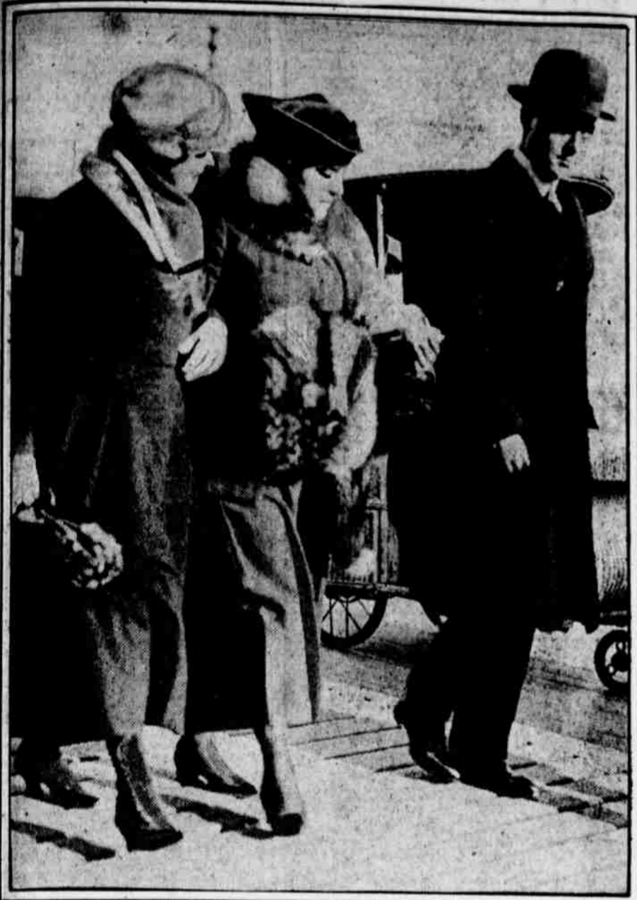
ATLANTIC CITY'S EASTER CAMPAIGN BEGINS NOWADAYS BEFORE THE LENTEN SEASON IS FAIRLY STARTED. THERE IS NO SUGGESTION OF SACKCLOTH IN THE GARB OF FAIR PROMENADERS