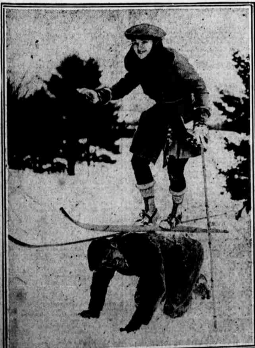
WHO WOULDN'T ENVY THIS FILM FAVORITE? While we may view her on the screen at the Locust Theatre to-night, Ann Murdock finds skiing at her upstate New York country place exhilarating and fascinating.