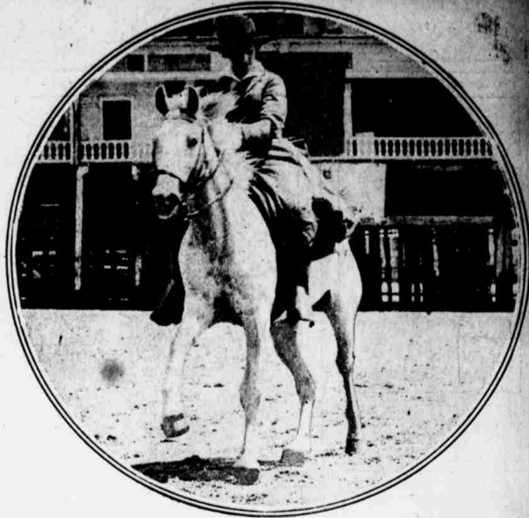
PONY RIDING IS ALREADY POPULAR AMONG BEACH SPORTS