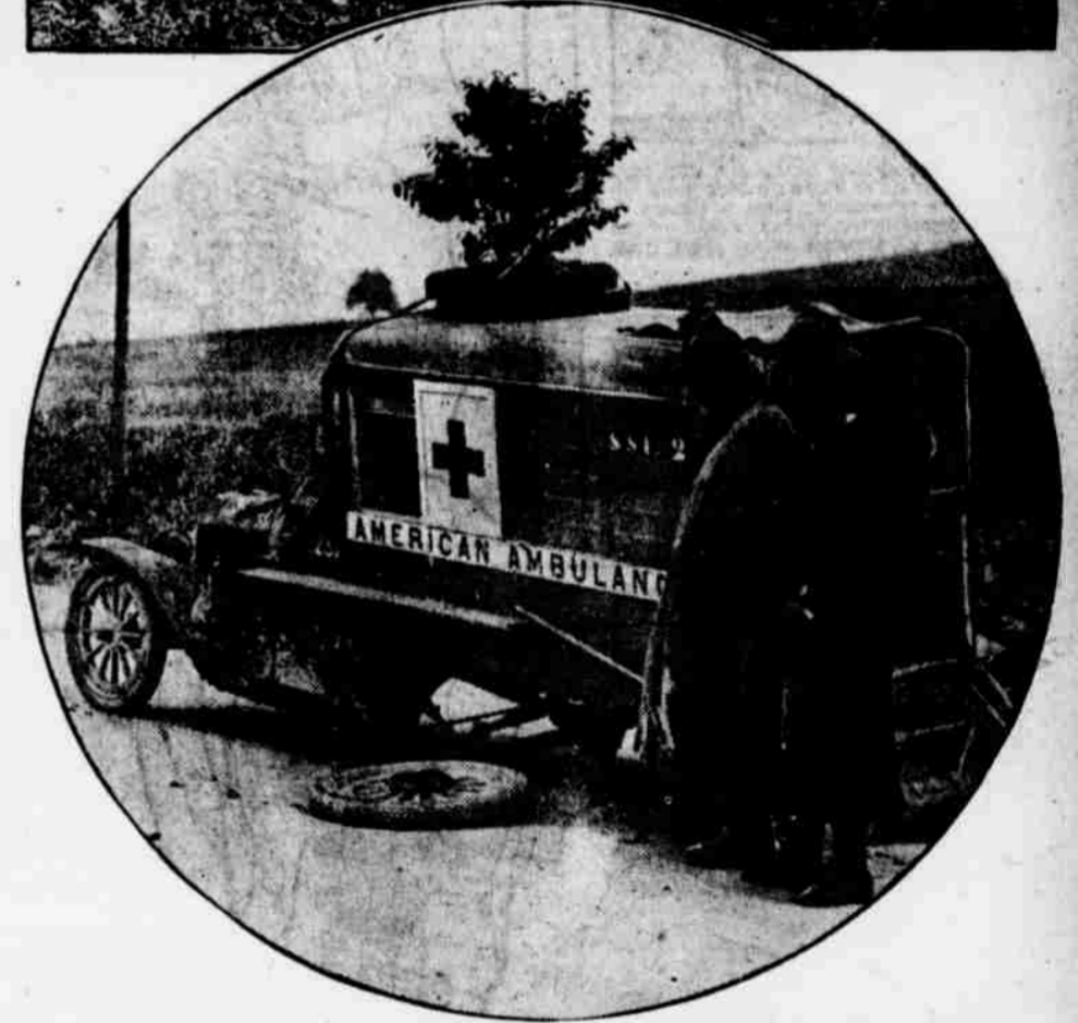
THE PERILS OF THE AMBULANCE DRIVER AS ILLUSTRATED BY PHOTOGRAPHS BROUGHT BACK FROM THE WAR ZONE BY JOHN McFADDEN, A PHILADELPHIAN.