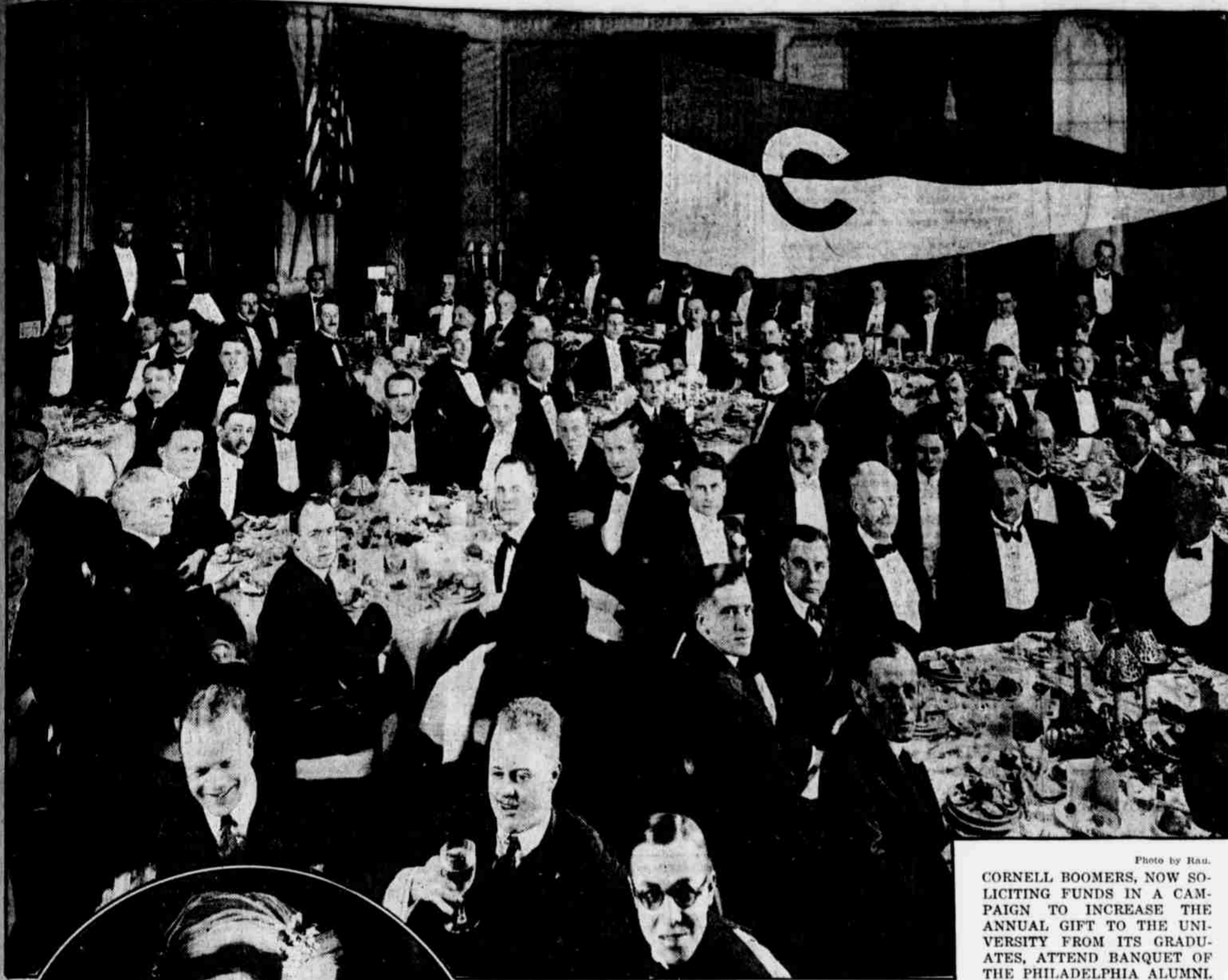
CORNELL BOOMERS, NOW SOLICITING FUNDS IN A CAMPAIGN TO INCREASE THE ANNUAL GIFT TO THE UNIVERSITY FROM ITS GRADUATES, ATTEND BANQUET OF THE PHILADELPHIA ALUMNI.