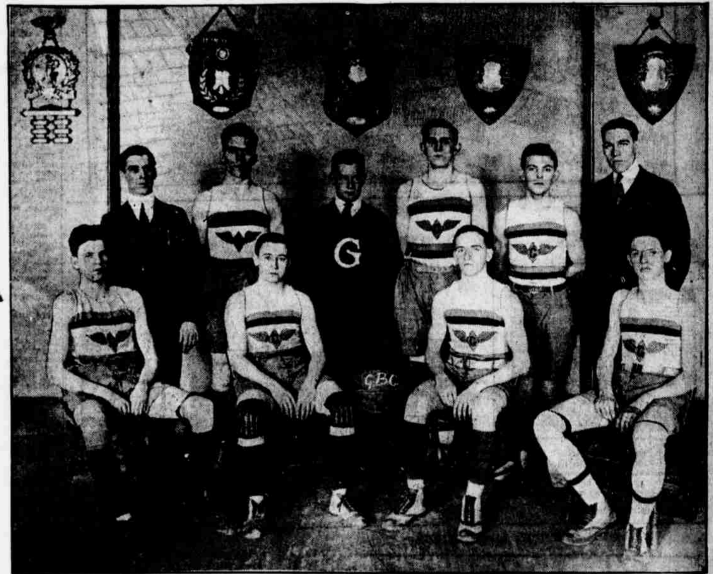
CRACK BASKETBALL TEAM OF THE GERMANTOWN BOYS' CLUB