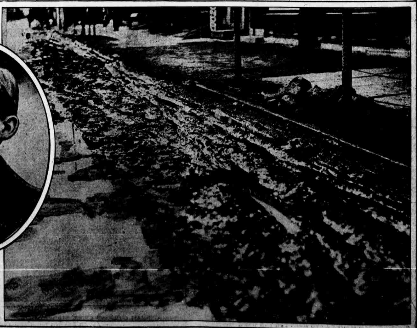
NOT ALL THE MUD IS ON EUROPEAN WAR FRONTS There is plenty to be found in Ridge avenue, west of Twelfth street, where it remained undisturbed, to the discomfort of neighboring residents.