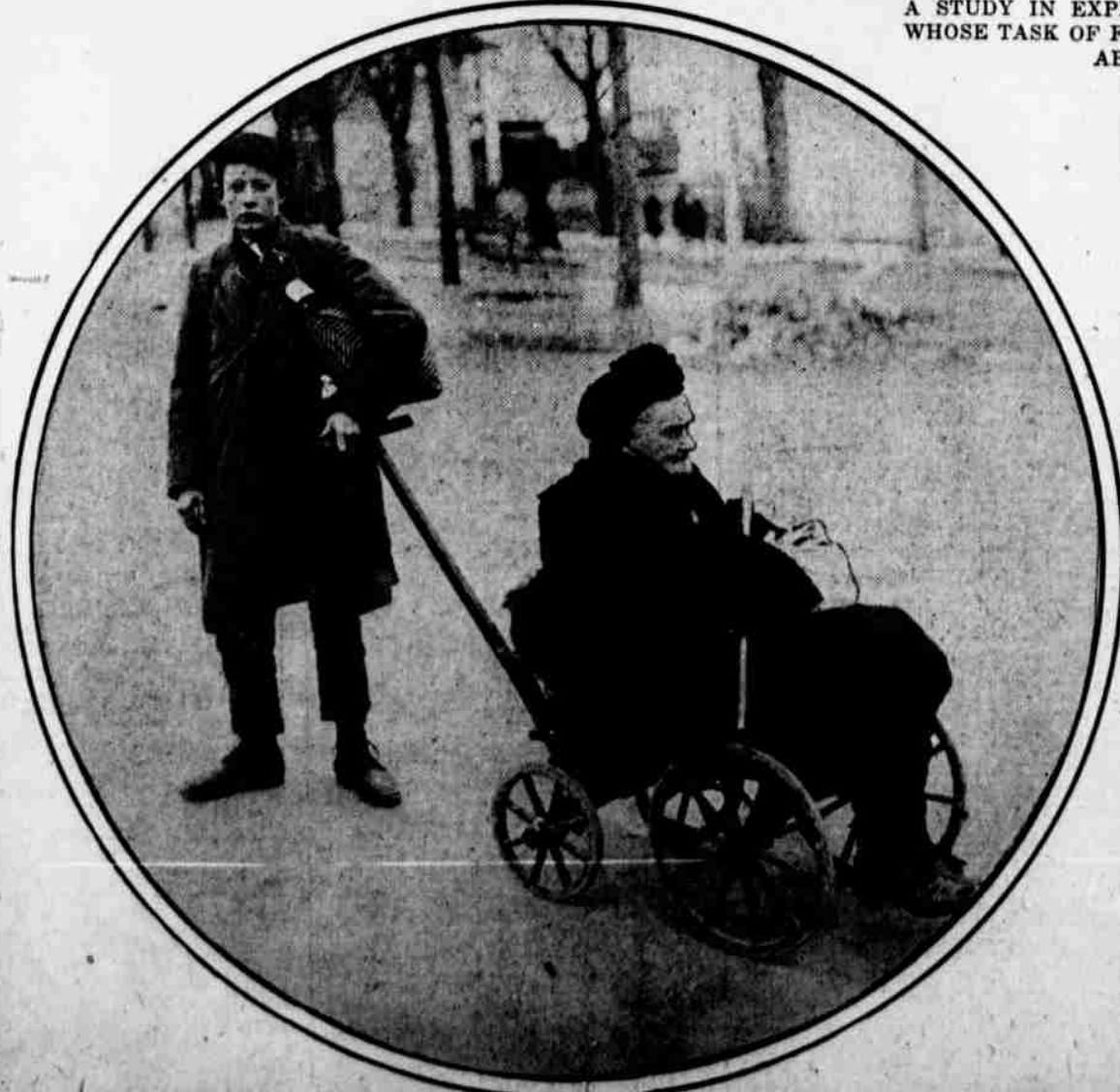
HER SECOND CHILDHOOD IN WAR TIME—A BOY AND HIS "GRANNY" One of the many touching scenes enacted when Germany released 20,000 civilian war prisoners who had been deported from France to southern France.