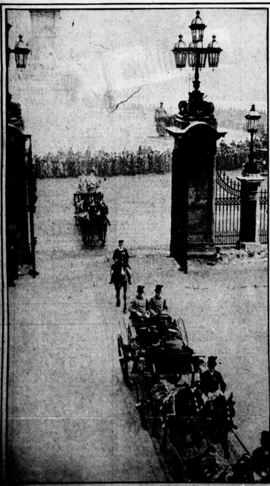
... WHEN PARLIAMENT RESUMED ITS SESSIONS. ... BUCKINGHAM PALACE