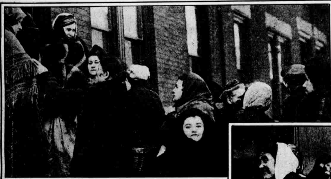
ANGRY WORKINGMEN'S WIVES DEMAND SATISFACTION AT HOME OF COMMISSION MAN WHO IS SAID TO CONTROL POTATO MARKET IN SECTION OF SOUTH PHILADELPHIA