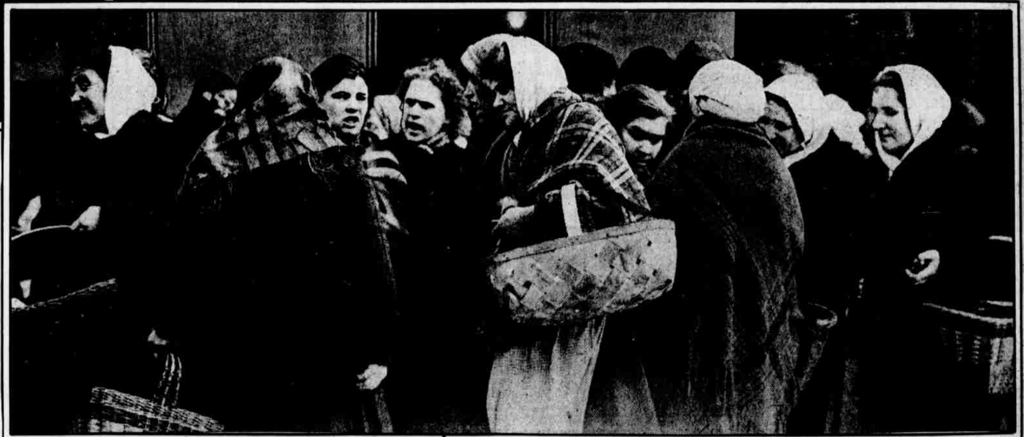
A STUDY IN EXPRESSIONS ON THE FACES OF A GROUP OF MOTHERS WHOSE TASK OF FEEDING THEIR HUNGRY BROODS HAS GROWN UNBEARABLE BECAUSE OF THE FOOD SHORTAGE