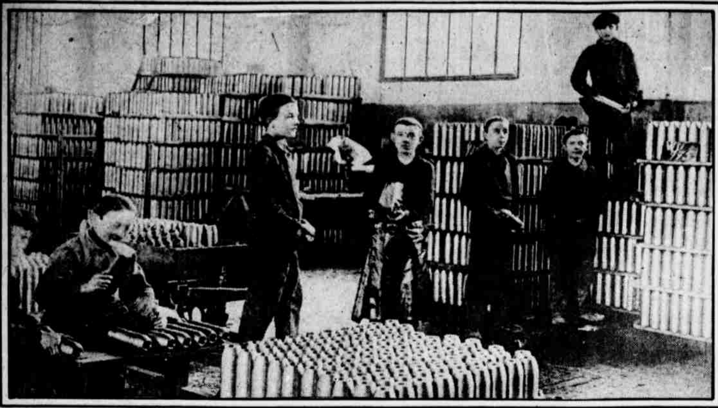
THE GOD OF WAR IS NO RESPECTER OF CHILD LABOR LAWS French boys of eight and ten years have been called on to aid in the defense of their country by replacing their brothers of fighting age in the munition factories.