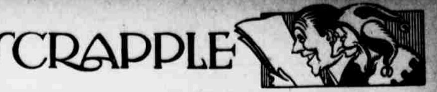
THE PADDED CELL