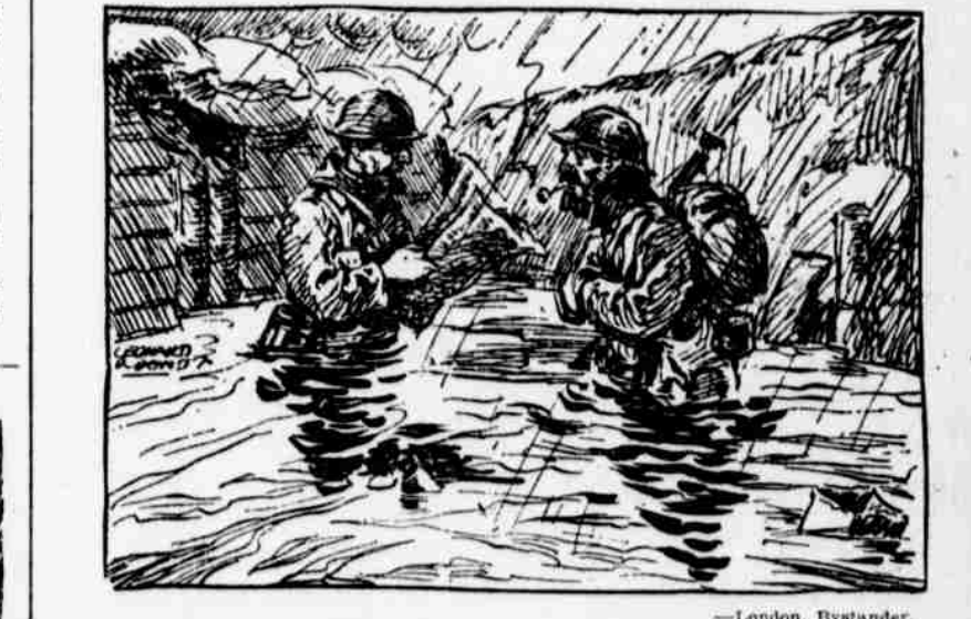
Tommy (reading) - It says 'ere that a fund is being raised for the purpose of proving portable baths for the trench.