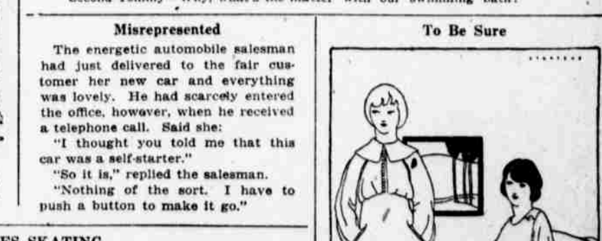
Eve (reading) - I thought you told me that this car was a self-starter.