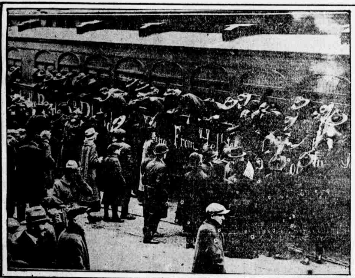
HOMECOMING OF MEMBERS OF SIXTH INFANTRY, N. G. P., ON TROOP TRAIN ARRIVING AT BROAD STREET AND WASHINGTON AVENUE