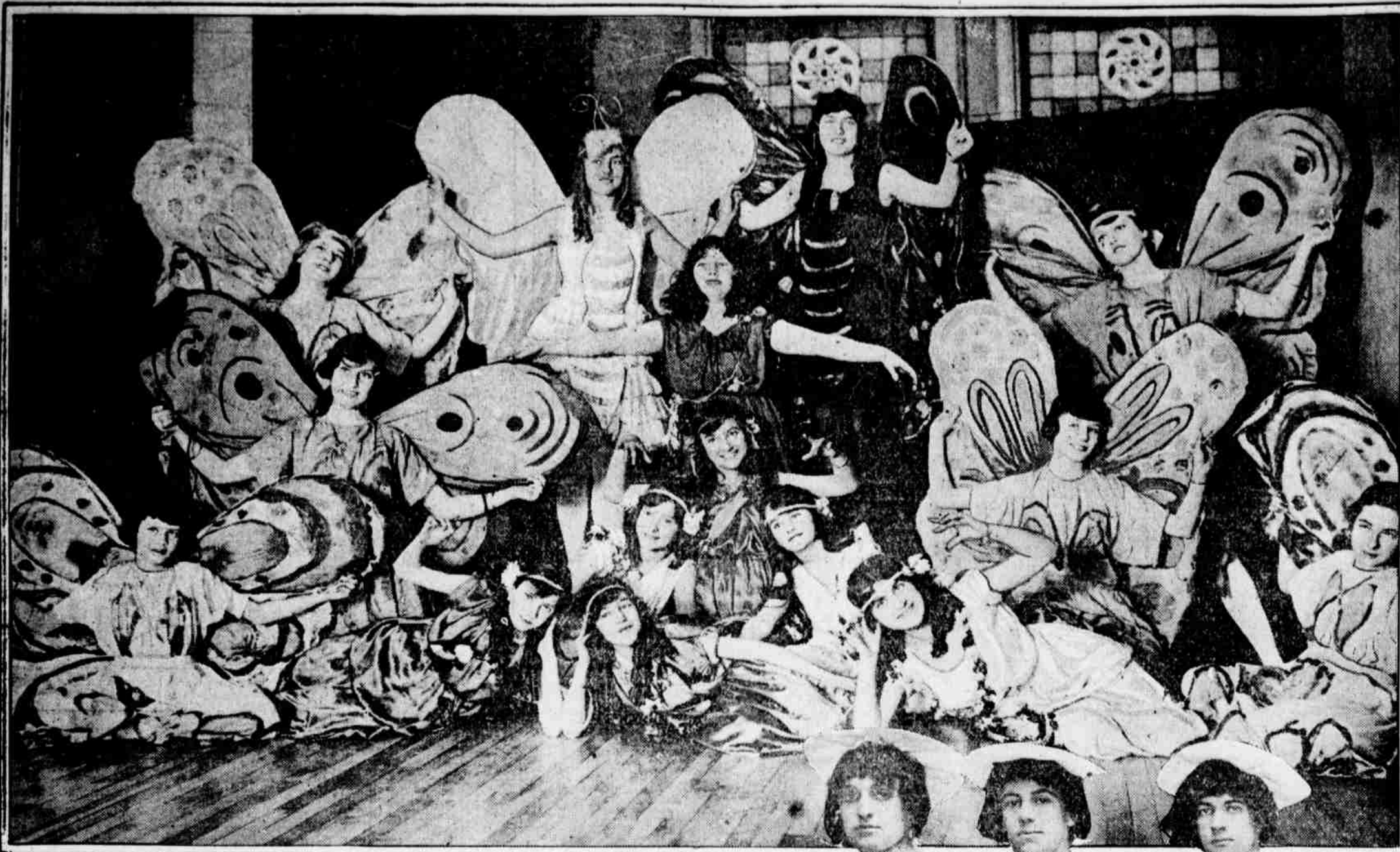
"BUTTERFLY BALLET" OF YOUNG GIRLS. A NOVEL OFFERING WHICH WILL APPEAR AT THE PERFORMANCE OF THE PHILADELPHIA OPERATIC SOCIETY ON THURSDAY EVENING