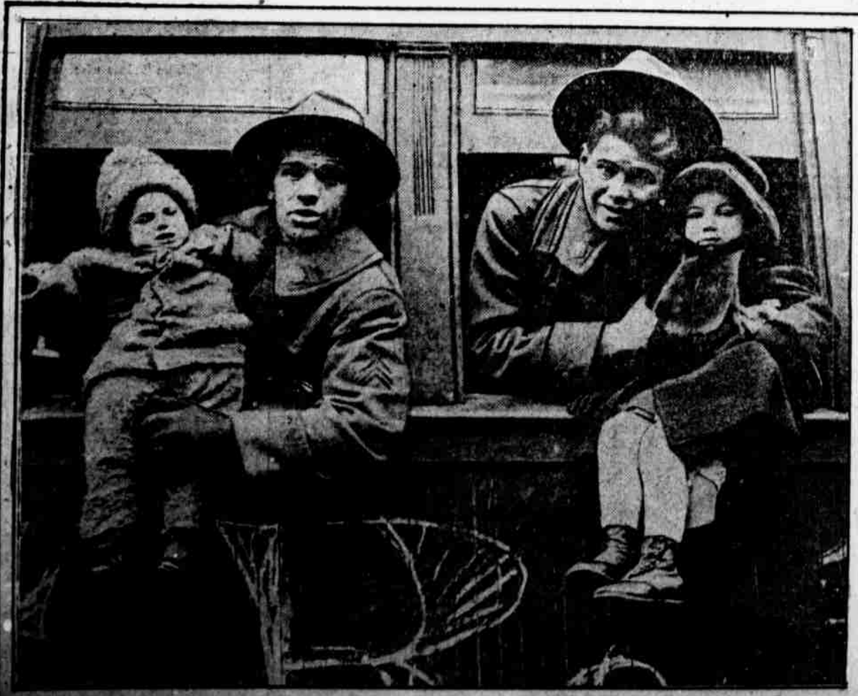
AS THIS WERE ENACTED WHEN "DADDY" CAME "SOLDIERING" ON THE BORDER