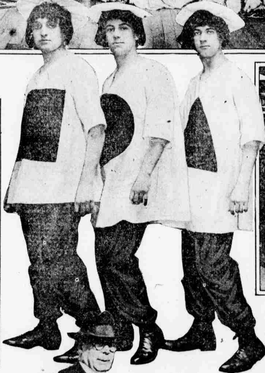
PENN ARCHITECTURAL STUDENTS WHO WILL BE AMONG THE PERFORMERS IN THE ARTISTS' MASQUE, "SAECULUM," TONIGHT