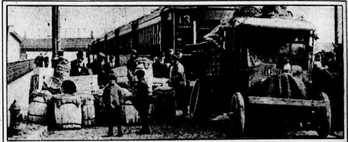
WHAT HAPPENED TO TRAFFIC WHEN A MOTORTRUCK BROKE DOWN AT THE WEST END OF WALNUT STREET BRIDGE OVER THE SCHUYLKILL