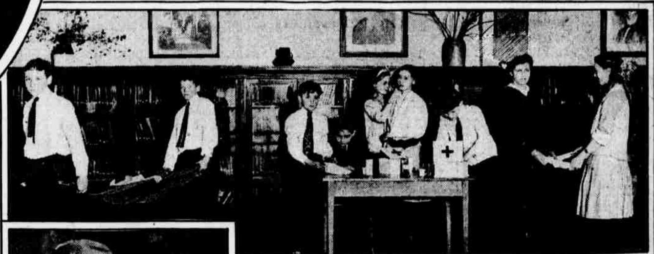
FIRST AID FOR THE INJURED PRACTICED BY CLASS IN HYGIENE AT FRIENDS' GIRARD AVENUE SCHOOL