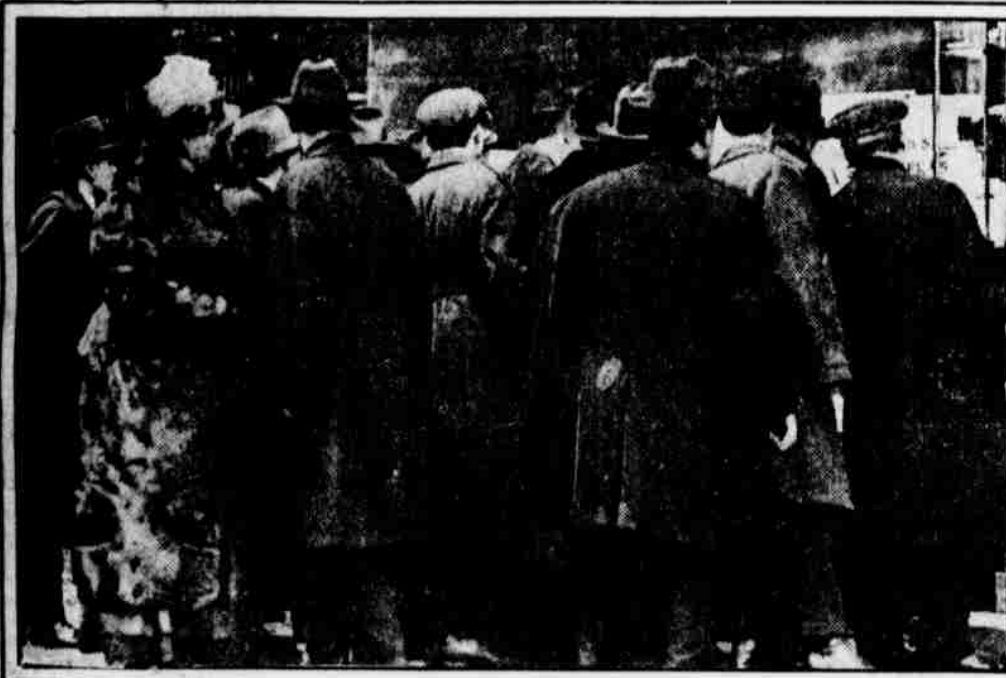
EXHIBIT OF PICTURES MADE BY STAFF PHOTOGRAPHERS OF THE LEDGERS ATTRACTS CROWD TO WINDOW OF CHESTNUT STREET STORE