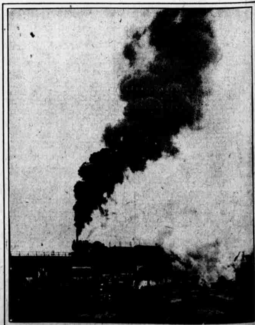
THE SMOKE NUISANCE IN PHILADELPHIA AS VIEWED FROM THE WALNUT STREET BRIDGE OVER THE SCHUYLKILL