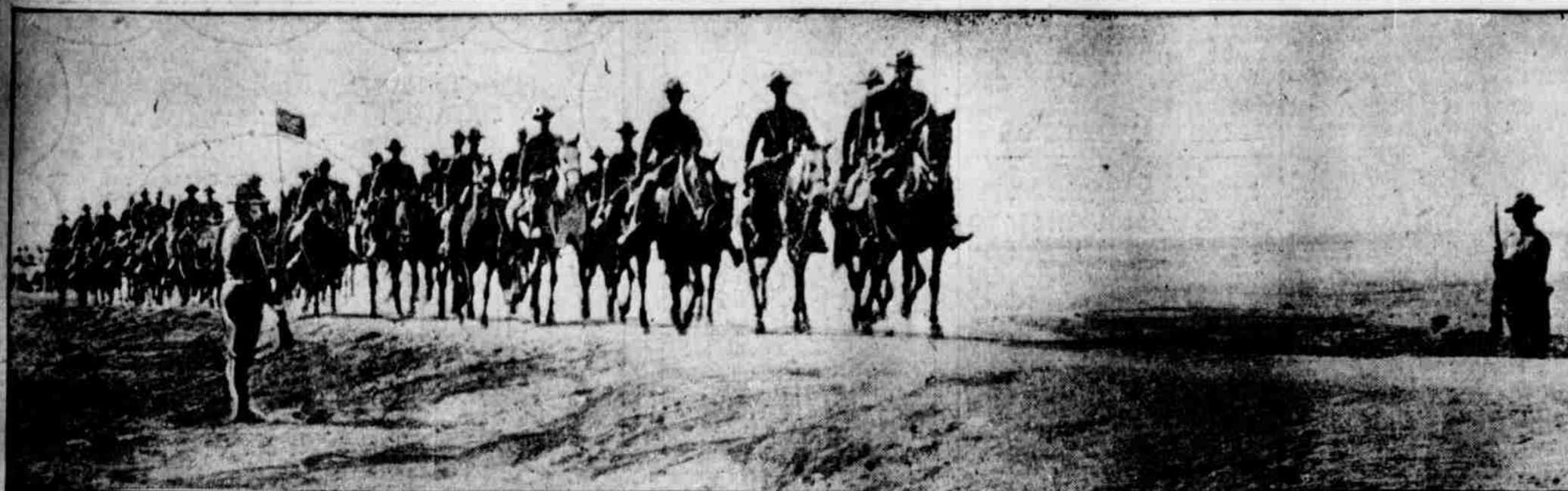
GENERAL PERSHING AT THE HEAD OF HIS COMMAND AS HE WAS ABOUT TO CROSS THE INTERNATIONAL BOUNDARY INTO THE UNITED STATES