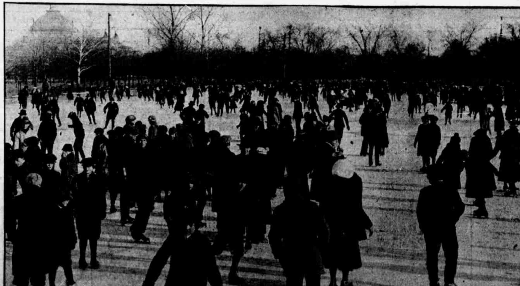
HOLIDAY CROWD OF OUTDOOR SPORT LOVERS THAT THROGGED CONCOURSE LAKE IN FAIRMOUNT PARK ON LINCOLN'S BIRTHDAY AND ENJOYED THE EXCELLENT SKATING