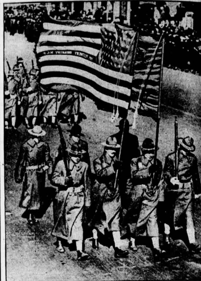
COLOR GUARD AND COLORS OF THE FIRST REGIMENT N. G. P., AS THEY APPEARED IN THE LINCOLN DAY PARADE