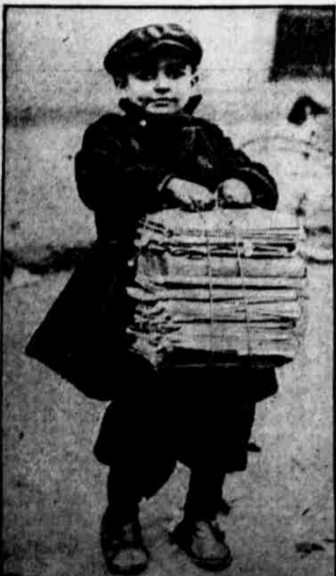
PAPER SHORTAGE A GOD-SEND TO THE SMALL BOY