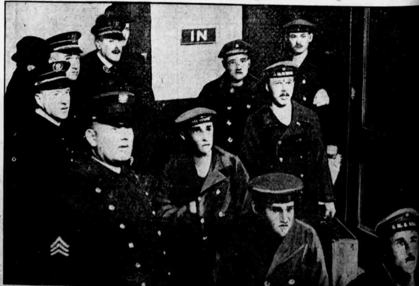
MEMBERS OF THE PRIZE CREW OF THE STEAMSHIP APPAM SNAPPED ON THEIR ARRIVAL HERE FROM NORFOLK