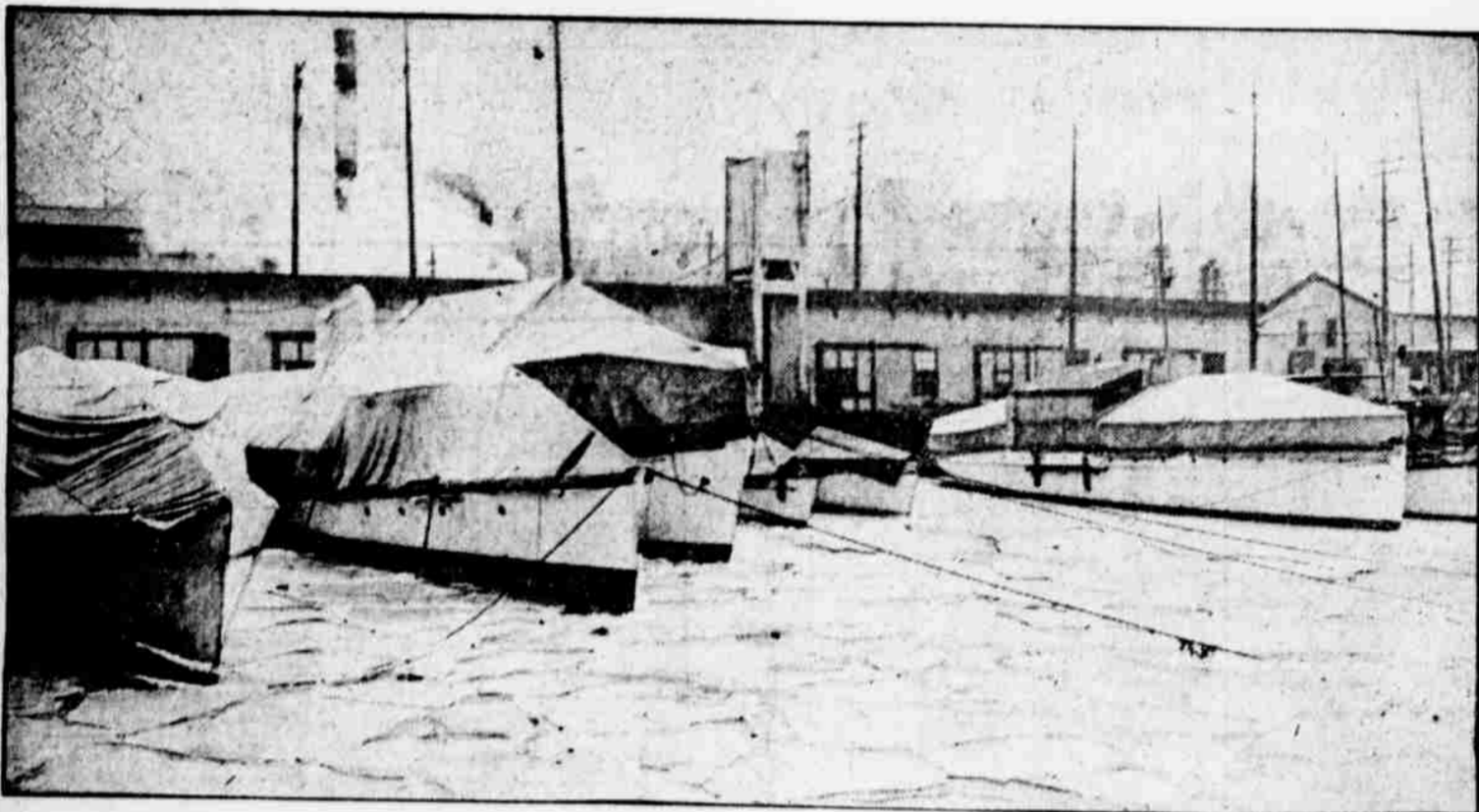
FLEET OF SPEEDY SUBMARINE CHASERS WHICH READILY CAN BE PRESSED INTO SERVICE BY THE UNITED STATES These fast little boats have been turned out for the Allies by Seabury's Boat Works, of New York, and now are awaiting delivery. Thousands of other motor craft could be commandeered in event of war.