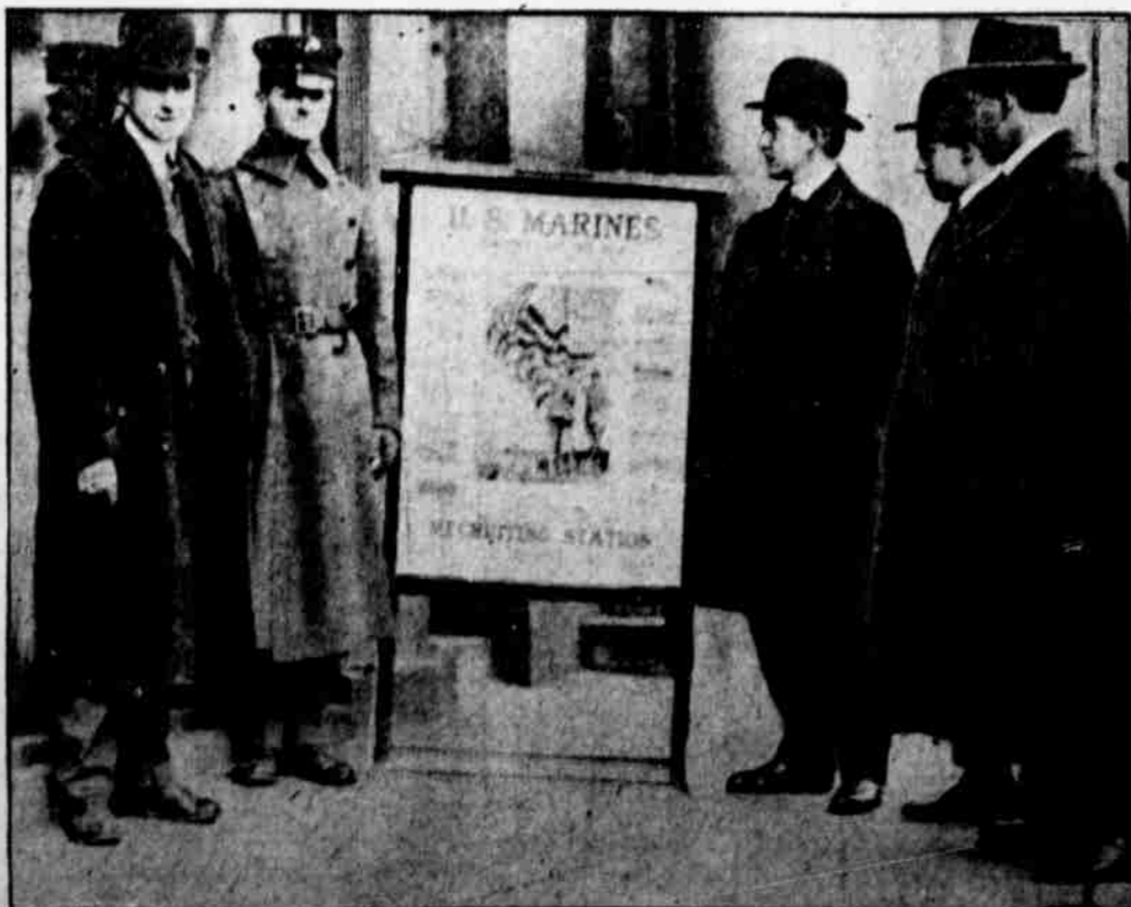
RECRUITING OF MEN TO FILL UP THE GAPS IN THE UNITED STATES NAVY MADE EASIER BY WAR TALK