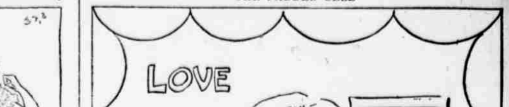
THE PADDED CELL