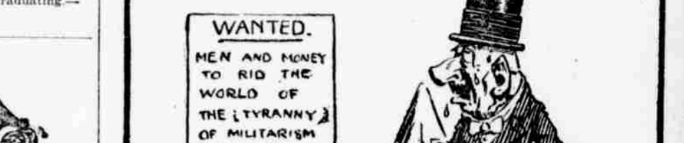
The Soft Answer That Turneth Away Wrath

Short and Sweet Johnny had a Thomas cat That warbled like Curuso; A neighbor threw a baseball bat, Now Thomas doesn't do so.