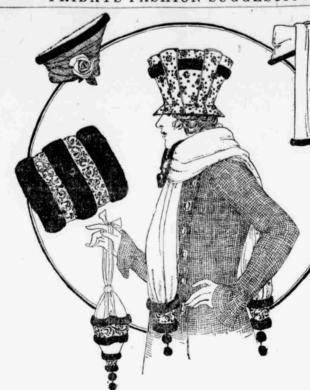
How bits of fur are used. Above, at the left, is a turquoise velvet girdle edged with chinchilla. The muff, below, is of paisley banded with sealskin. Above, at the right, is a "stock" girdle with trimmings of sealskin, while the hat, stole and bag in the center illustration are of black velvet ornamented with gold embroidery and Kinsky.