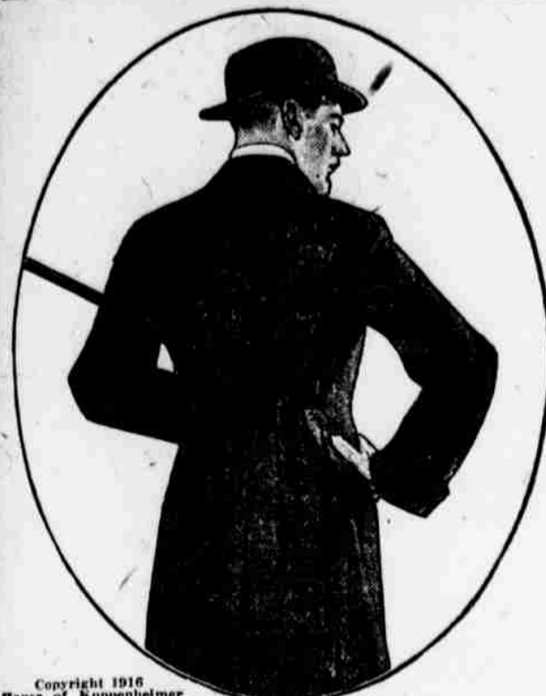
Copyright 1916 House of Kuppenheimer

pair of lined knickerbockers)—ages 8 to 18, $9, values $12.50 and $13.50. Boys' Overcoats—for ages 4 to 17 years, and Boys' Norfolk Suits (mostly with extra pair of lined knickerbockers)—for ages 8 to 18, $7, values $10 and $12. Boys' Overcoats—for ages 3 to 16 years, and Boys' Norfolk Suits (many with extra pair of full lined knickerbockers)—for ages 8 to 18, $5, values $7.50 to $8.50. Boys' Mackinaws—for ages 8 to 17 years, $5.75, values $8.50 and $10. Pinched back with skate pockets or patch pockets. Boys' $2 to $3.50 Washable Suits—for ages 3 to 10 years, at $1.35. Junior Norfolk or Tommy Tucker styles; neat stripes, in navy, cadet or brown. Also of blue or tan poplin—good models, with patch pockets. —Gimbels, Third floor