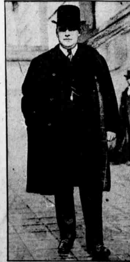
Senator William C. Sproul, who introduced the resolution for the Drumbagh probe.

The photograph shows the White Star liner Cedric, flying the British flag, with a 6-inch gun mounted aft. It is this method of armament against which Germany has protested vigorously ever since the war began, and which is the immediate cause of the resumption of a "ruthless U-boat policy."