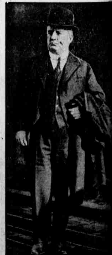
Senator Edwin H. Vore is discovered wearing a grimly illigent expression.