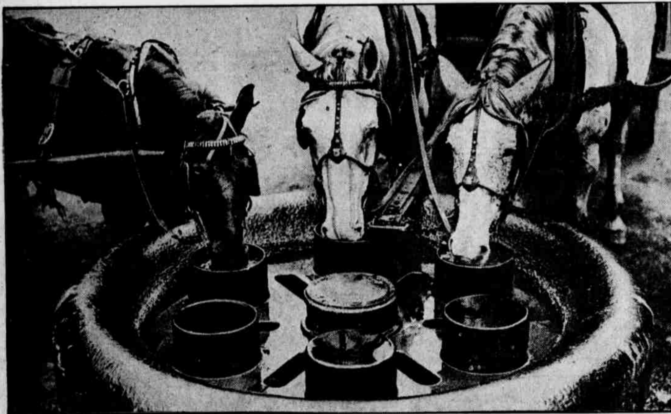
"INDIVIDUAL CUPS" ARE PROVIDED ON THE NEW DRINKING FOUNTAIN ERECTED BY THE PENNSYLVANIA SOCIETY FOR THE PREVENTION OF CRUELTY TO ANIMALS