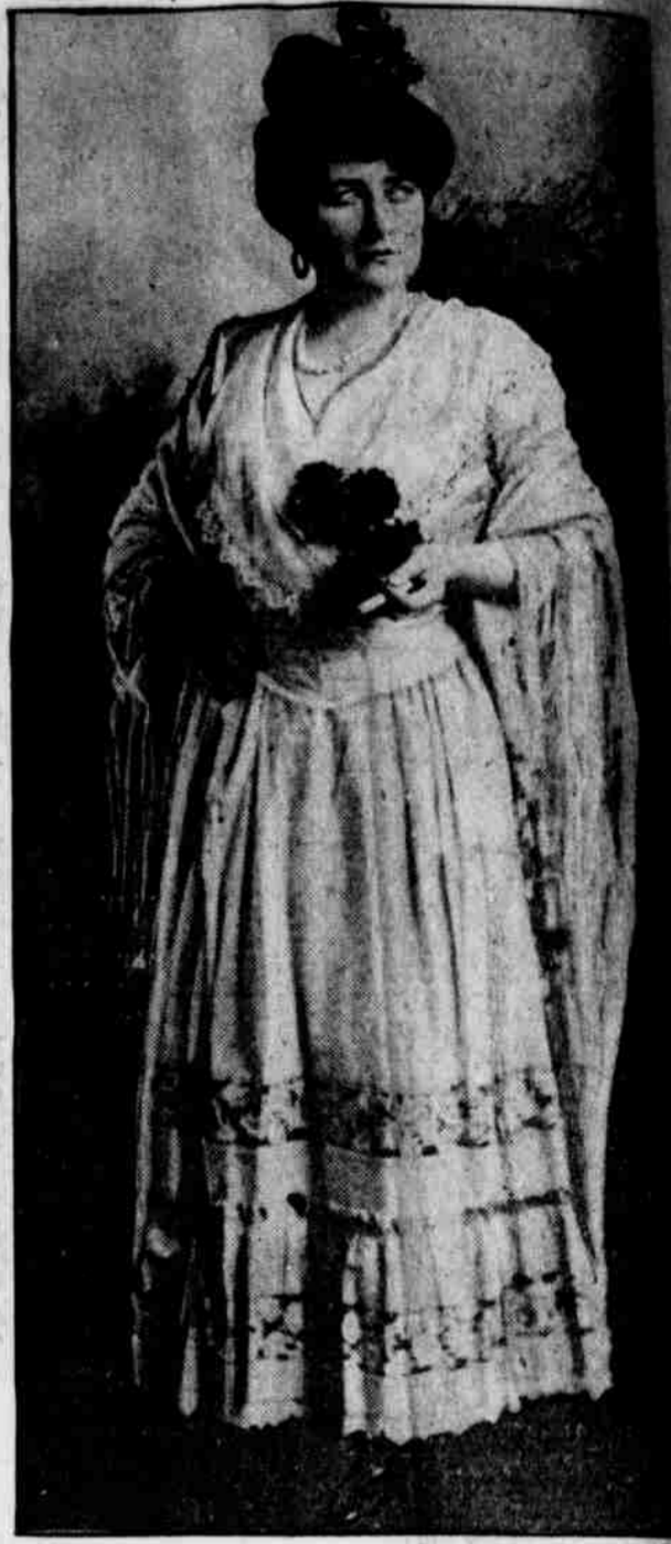
SHE SUCCUMBS TO THE MOVIE LURE Mary Garden, the ever-interesting, has gone and signed for an appearance on the screen.