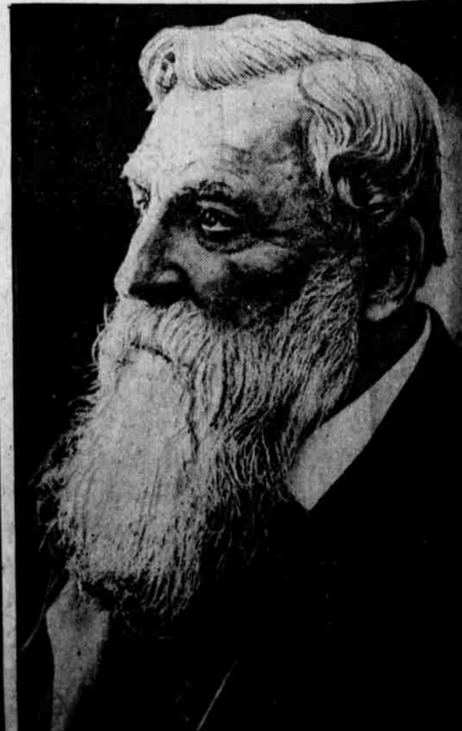
RODIN RENEWS HIS YOUTH It was all a mistake about the sculptor, it transpired. He was not sick; merely married—for the second time at the age of seventy.