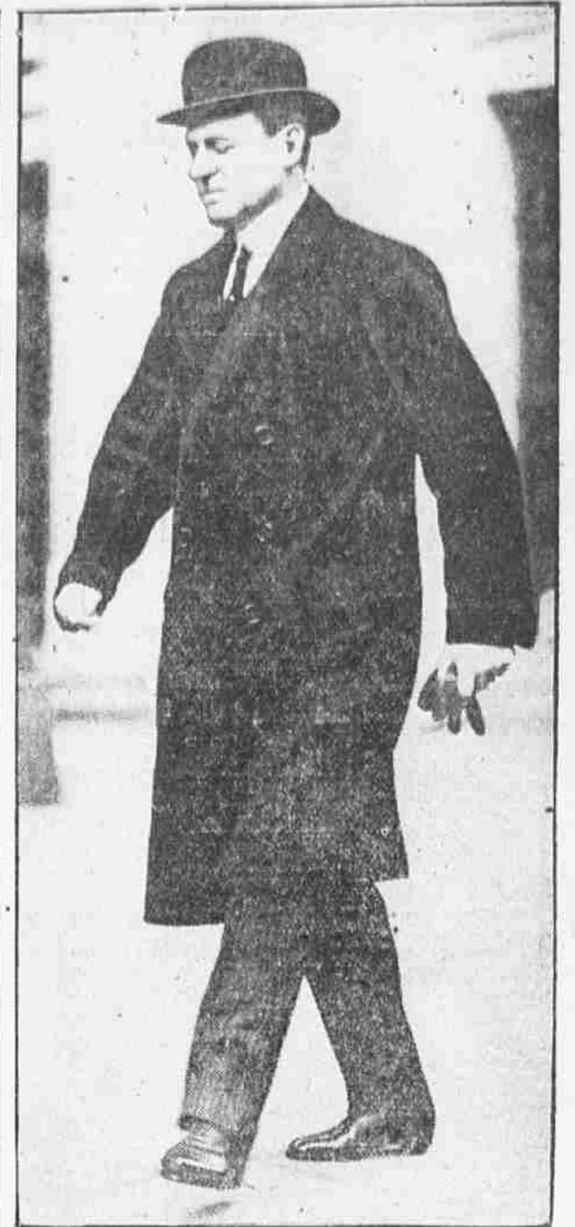
JOSEPH E. WIDENER Capitalist, patron of art and admirer of blooded horseflesh.