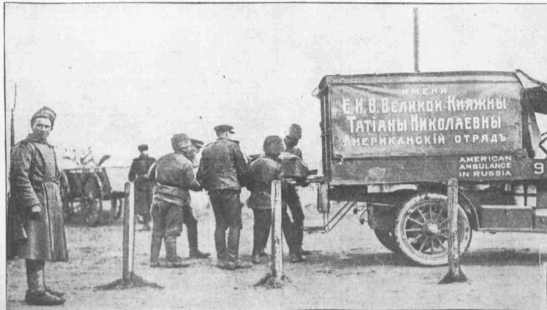
AMERICAN AMBULANCE, THE 'GIFT OF RUSSIAN RESIDENTS OF THE UNITED STATES, ON DUTY AT THE RUSSIAN FRONT.