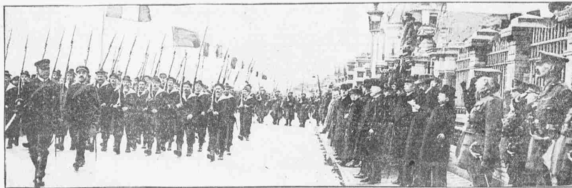
BELGIAN MARINES, WHOSE OPENING OF THE DYKE GATES STOPPED THE GERMAN ADVANCE IN FLANDERS, REVIEWED BY BRITISH OFFICERS AT THE ANNIVERSARY OF THE BATTLE OF THE YSER.