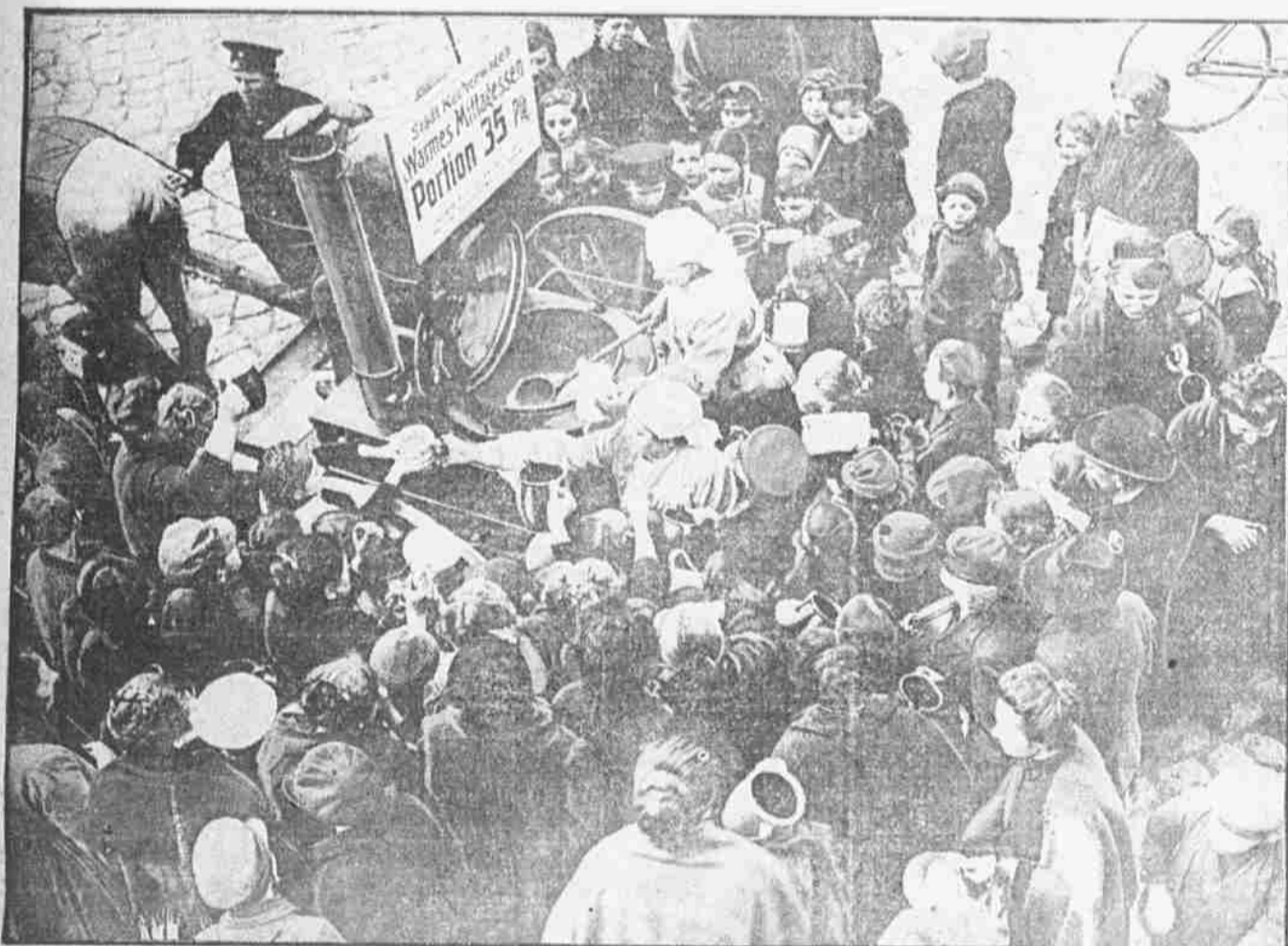
BERLIN FEEDS ITS POOR LARGELY WITH THE MUNICIPAL COOK WAGON These traveling food purveyors are playing a prominent part in coping with the food shortage. A fairly substantial meal is sold for thirty-five pfennigs, about ten cents in American money.