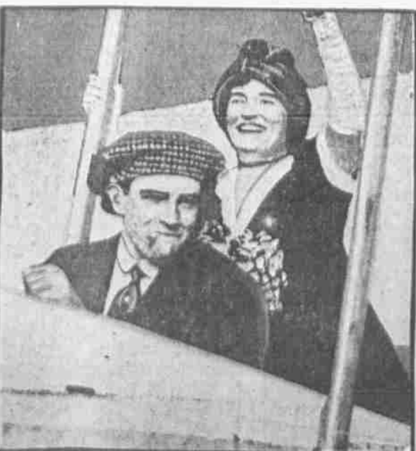
CLAUDE GRAHAME WHITE, BRITISH AVIATOR, AND HIS NEW WIFE, WHO WAS ETHEL LEVY, FORMER WIFE OF GEORGE M. COHAN