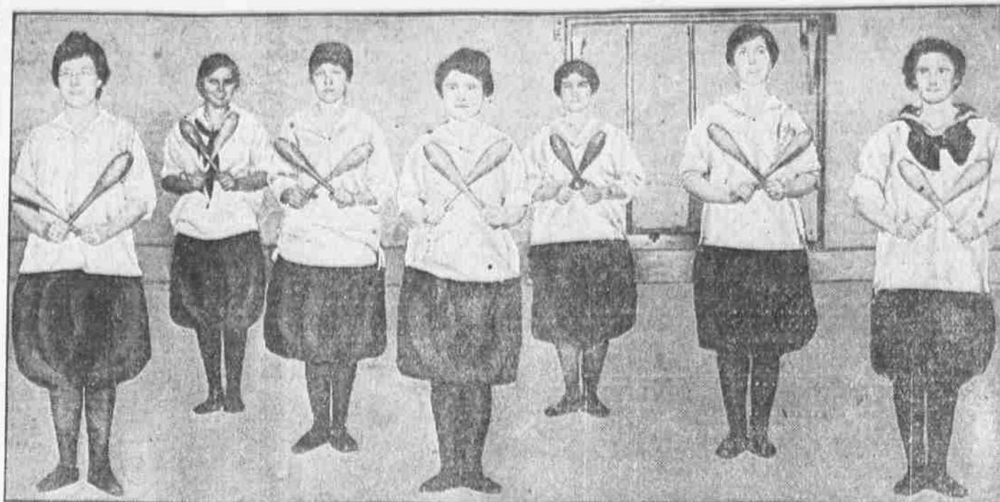
GIRLS OF THE GERMANTOWN YOUNG WOMEN'S ASSOCIATION GIVE EXHIBITION IN DANCING AND ATHLETIC DRILLS FOLK DANCE BY THE YOUNGER MEMBERS CLASS IN INDIAN CLUB SWINGING