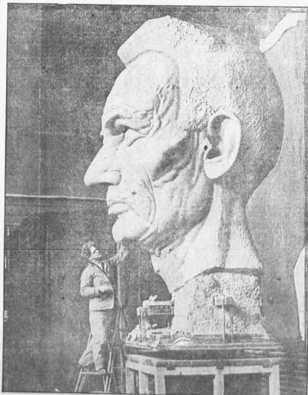
SCULPTOR GEORGE GREY BARNARD AT WORK ON HIS HEAD OF LINCOLN, WHICH MISS IDA TARBELL CALLS "THE PROFOUNDEST THING YET DONE ON THE MAN"