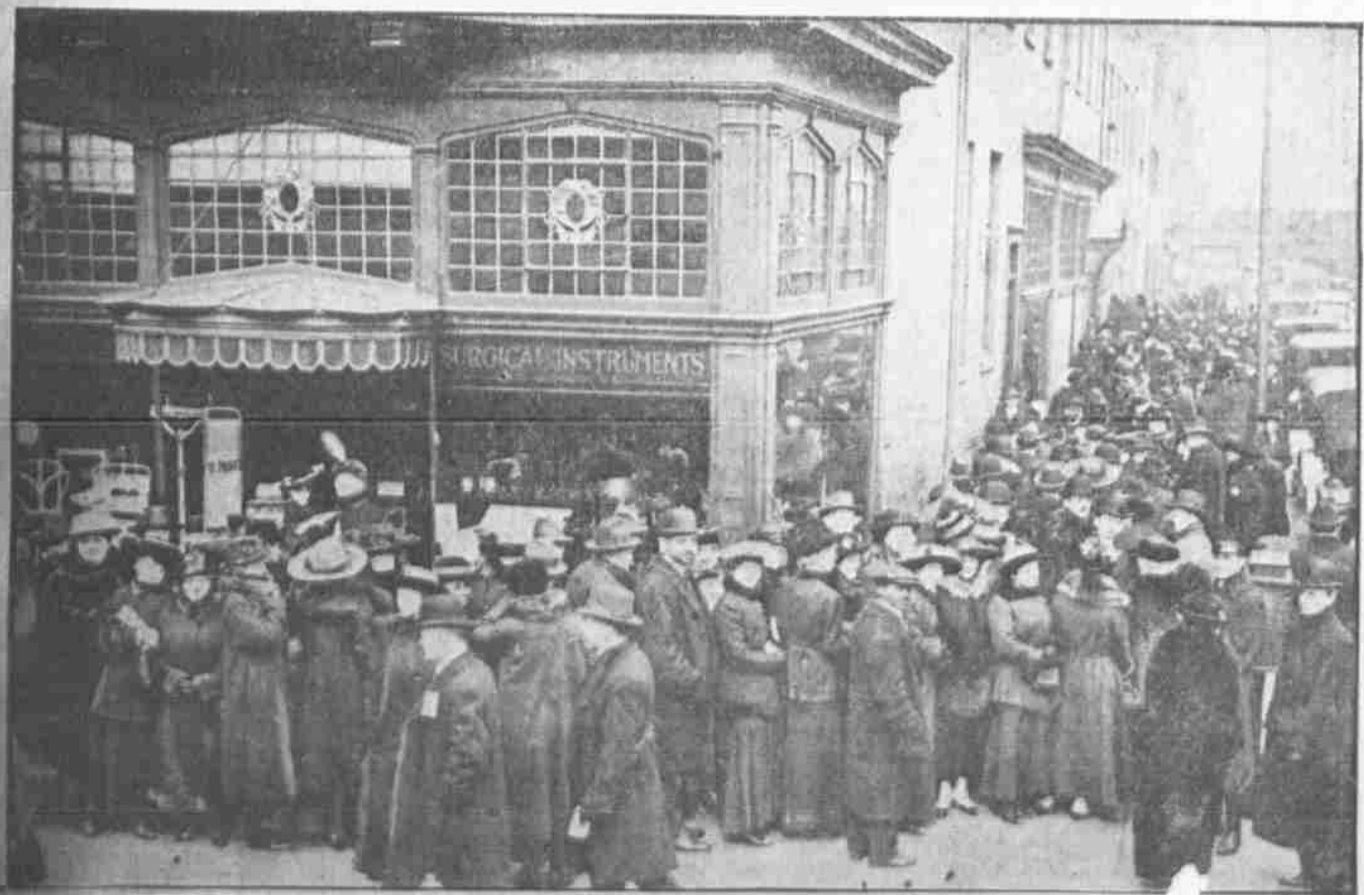
ELECTION OF NEW OFFICERS OF WOMEN'S PENNSYLVANIA S. P. C. A. DRAWS REMARKABLE CROWD OF PARTISANS, WHICH BESIEGES OFFICE ALL DAY