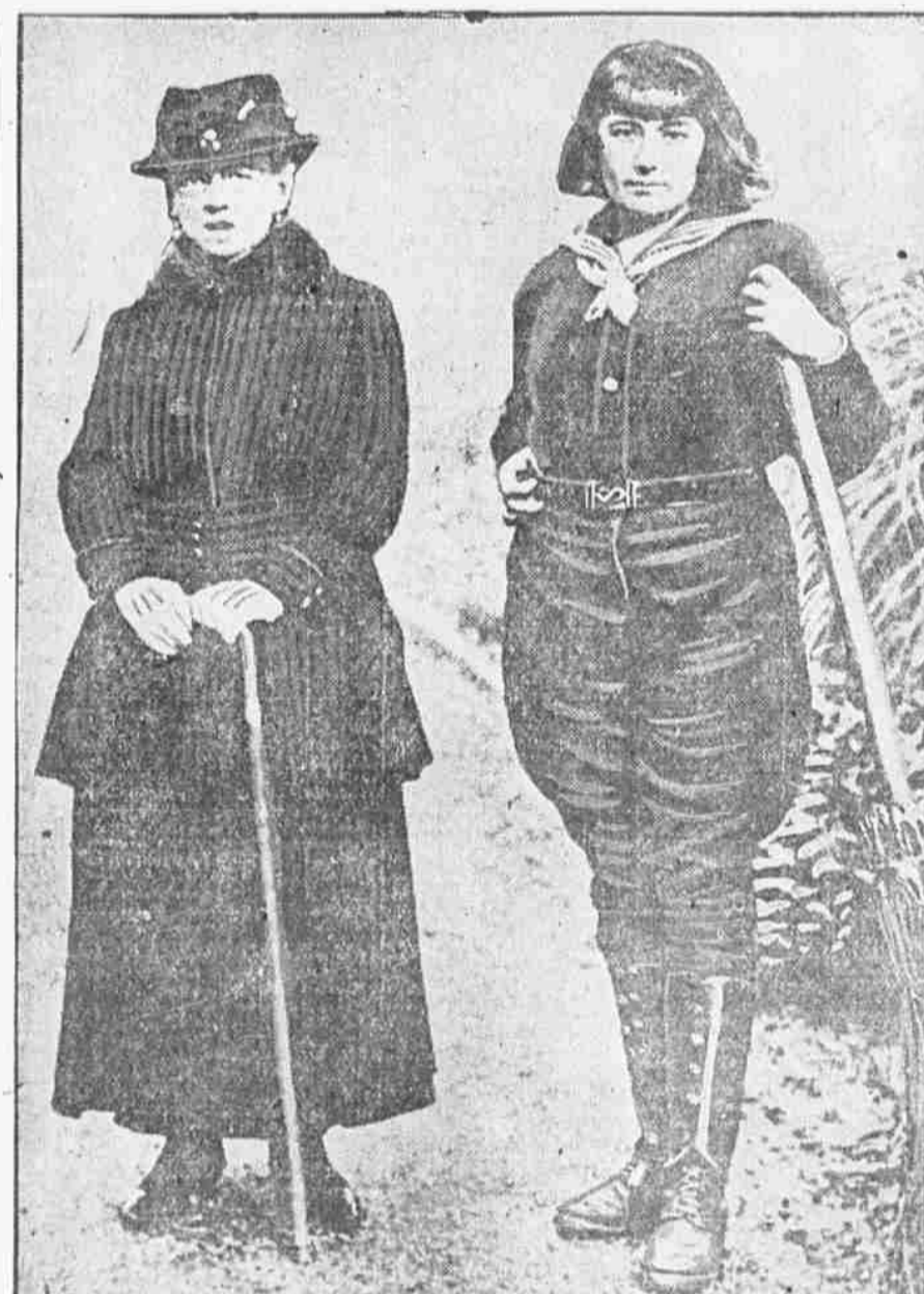
LADY COWDRAY, WIFE OF THE BRITISH CAPITALIST, PUTS HUSKY GIRLS TO WORK ON HER ESTATE AS GARDENERS