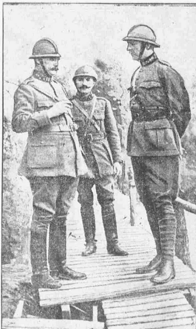
KING ALBERT (ON RIGHT) DONS TRENCH HELMET WITH WHICH BELGIAN ARMY HAS BEEN EQUIPPED