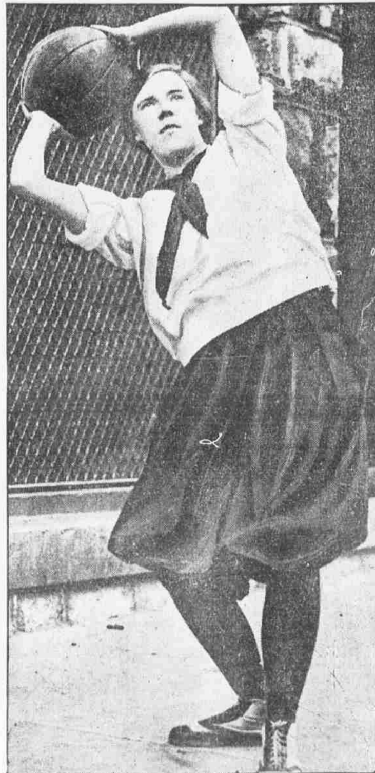
MISS BAKER IS ANOTHER CAGE EXPONENT FROM TEMPLE, NOTED FOR ITS ATHLETIC GIRLS