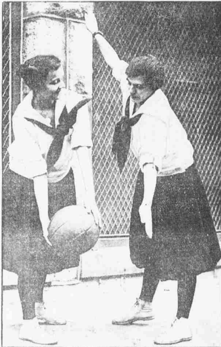
MISSSES FRAZER AND SHARK, TWO OF TEMPLE UNIVERSITY'S BASKETBALL STARS