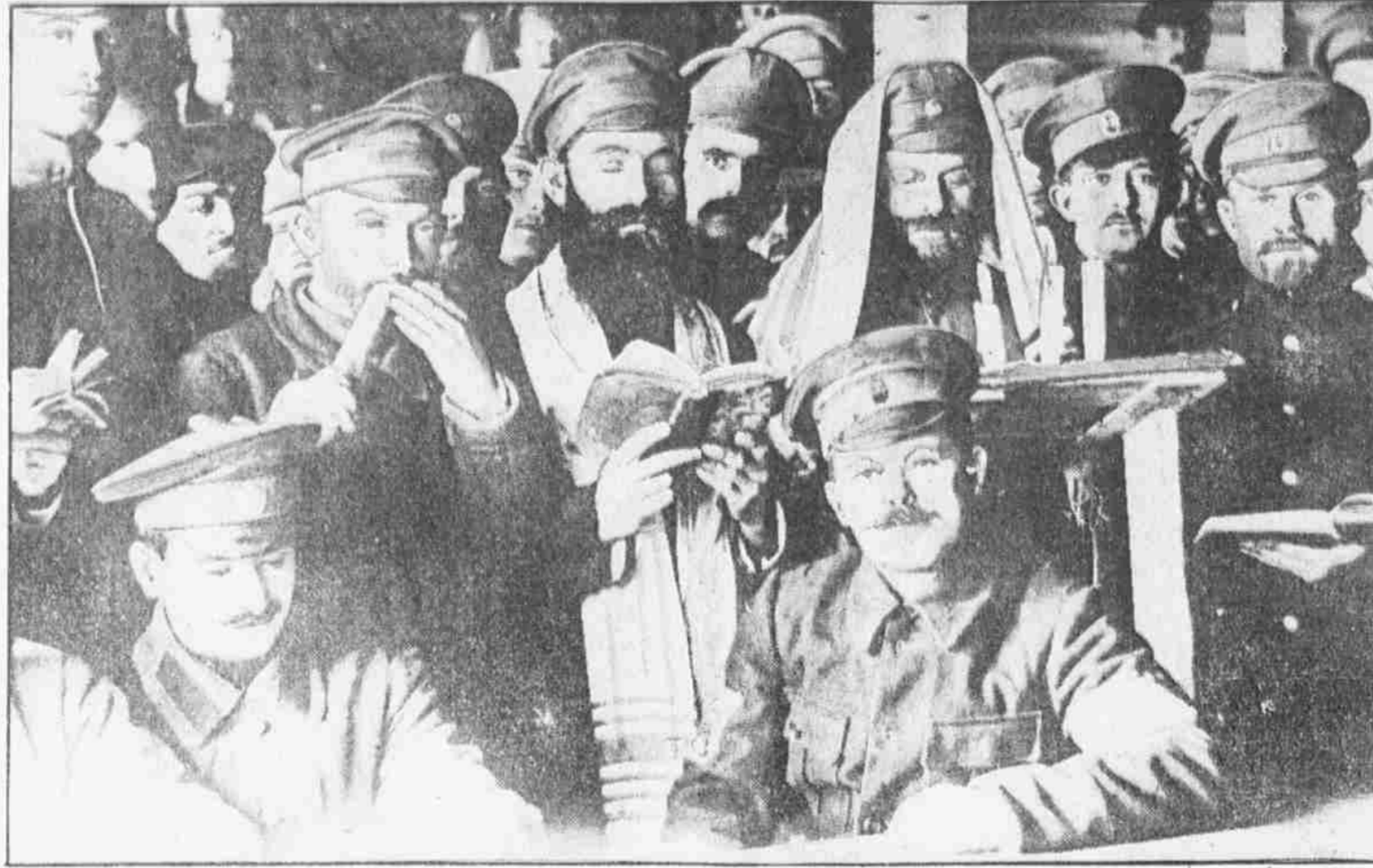
JEWISH SOLDIERS FROM THE RUSSIAN ARMY AT PRAYER IN A GERMAN PRISON CAMP