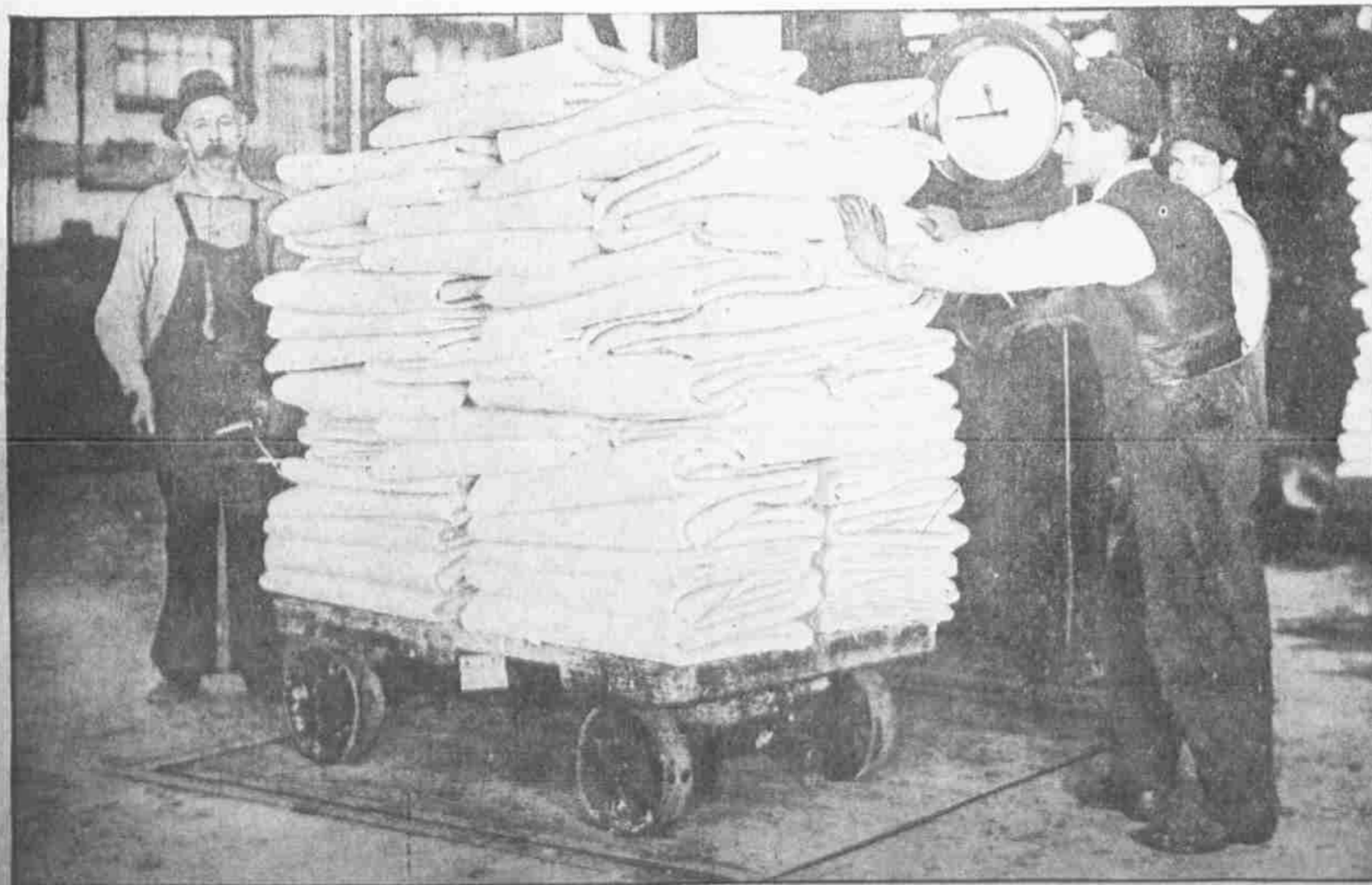
A STAGE IN THE MAKING OF THAT COSTLY MODERN COMMODITY, PAPER What seem to be white blankets here are sheets of wood pulp, made from logs soaked and then ground up. It is possible to convert a log into a newspaper in ten hours.