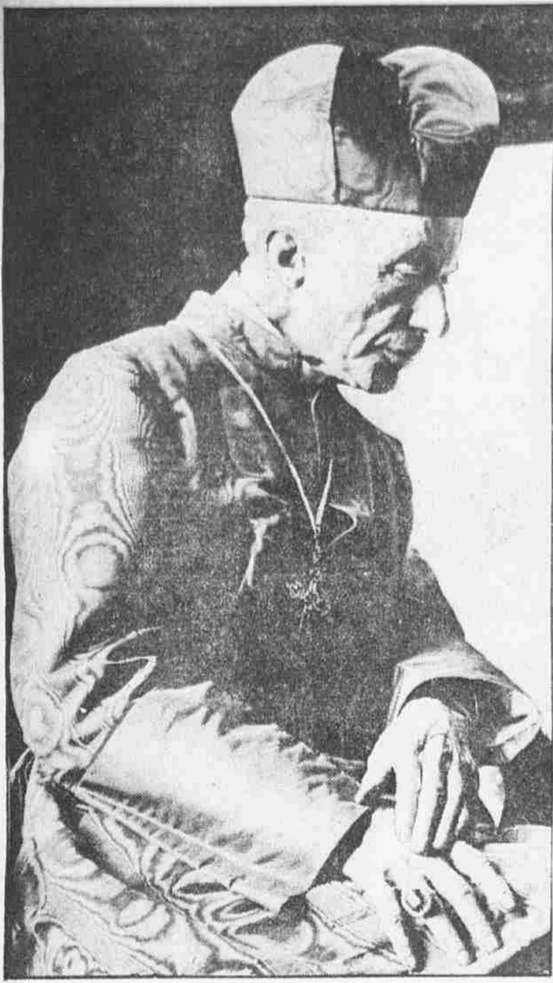
CARDINAL GIBBONS AS HE APPEARED HERE YESTERDAY IN HIS RED BIRETTA AND CARDINAL'S RING