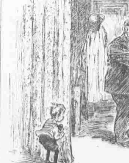
Tommy—Gee whiz! I hope he doesn't like white meat!