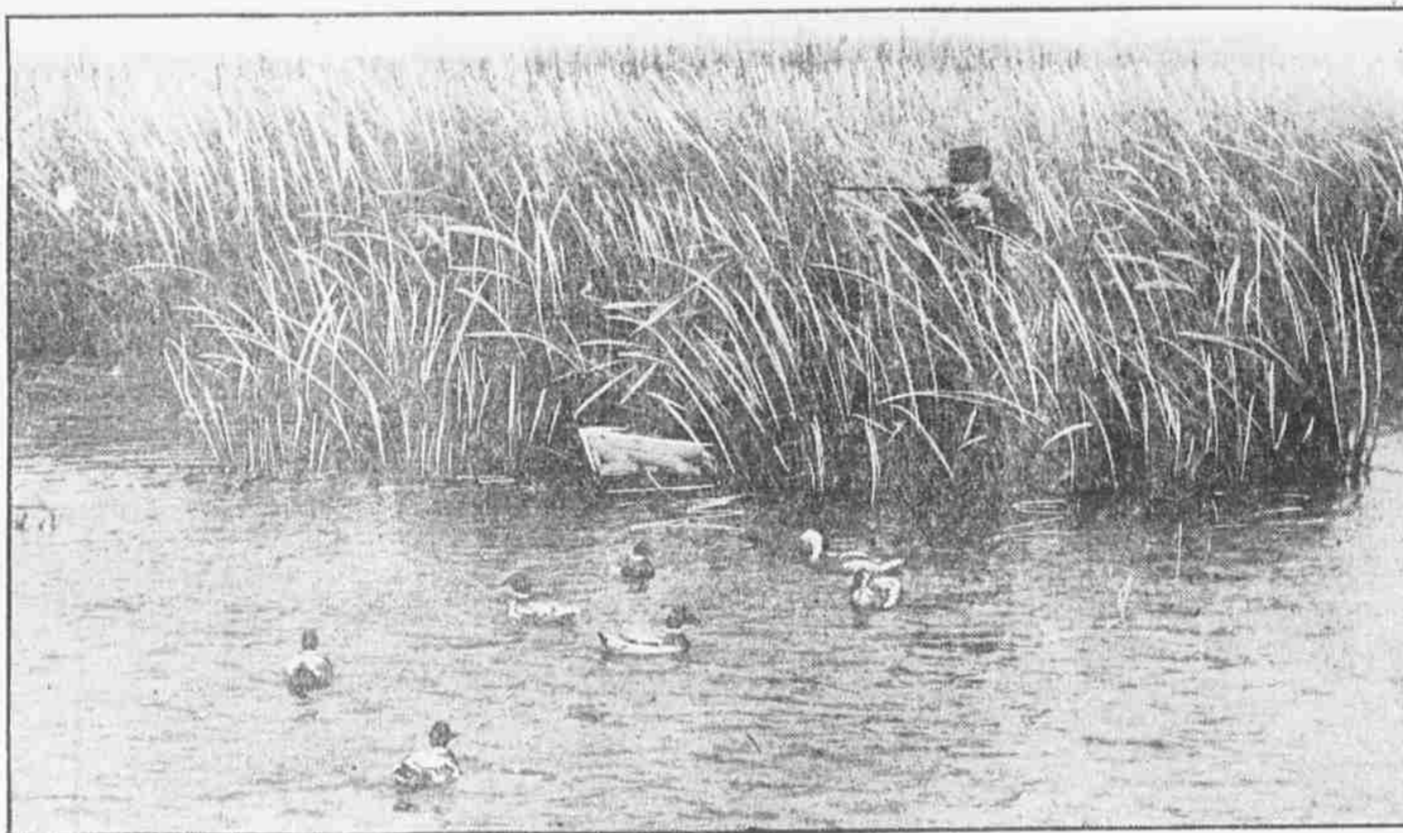
DECOY DUCKS THAT BROUGHT RAID FROM A CRUISING EAGLE A moment after this picture of a Philadelphia hunter in South Carolina was taken an eagle swooped down and carried off one of the ducks. Judge his feelings when he found it was a wooden one.