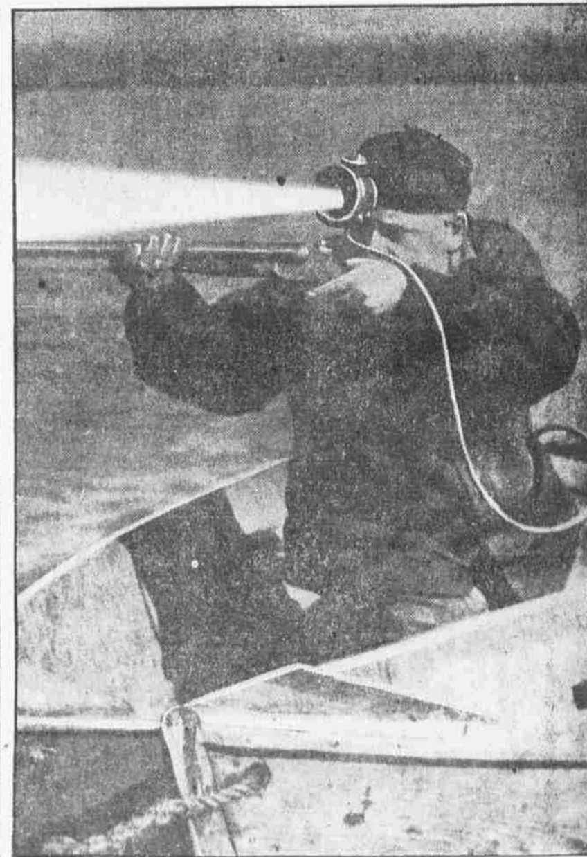
PHILADELPHIAN'S "DEER-SHINING" DEVICE The head searchlight catches reflections in the quarry's eyes when hunting on water at night.