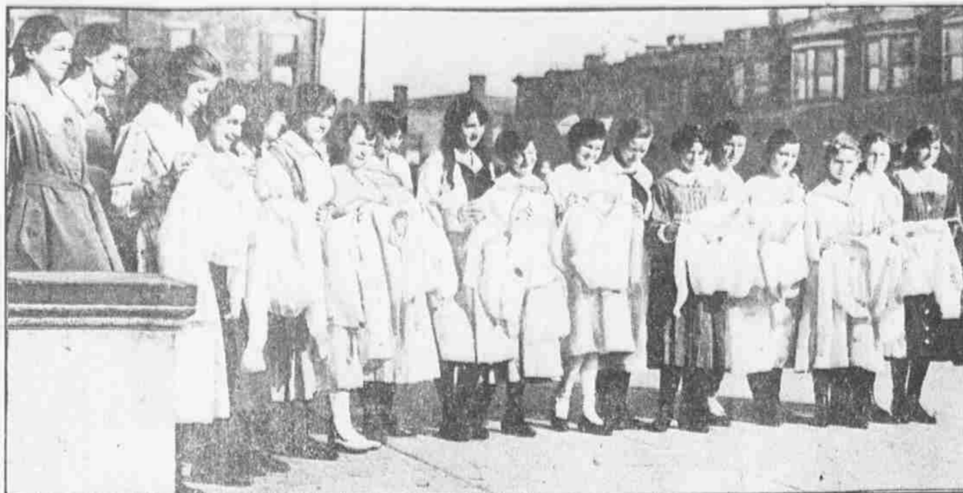
GRADE 8-B, COMPRISING GIRLS FROM EIGHT TO FIFTEEN, EXHIBIT THE GARMENTS THEY PLANNED AND SEWED ALL BY THEMSELVES