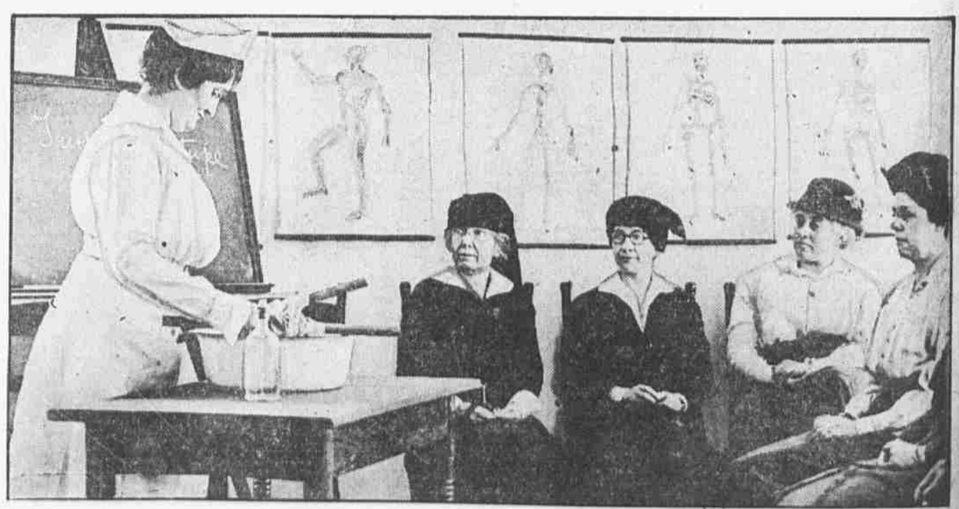
RED CROSS CLASS IN SESSION AT WAYNE Lectures and demonstrations are given in the art of supplying first aid where needed.