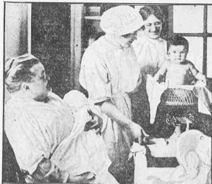
Weighing babies to see if they have put on the proper amount of flesh.