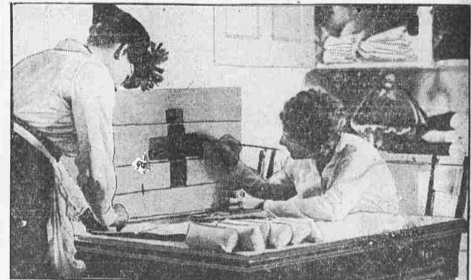
WOMEN OF WAYNE OPEN RED CROSS HEADQUARTERS Marking outward-bound goods and packages with the sign of the cross.