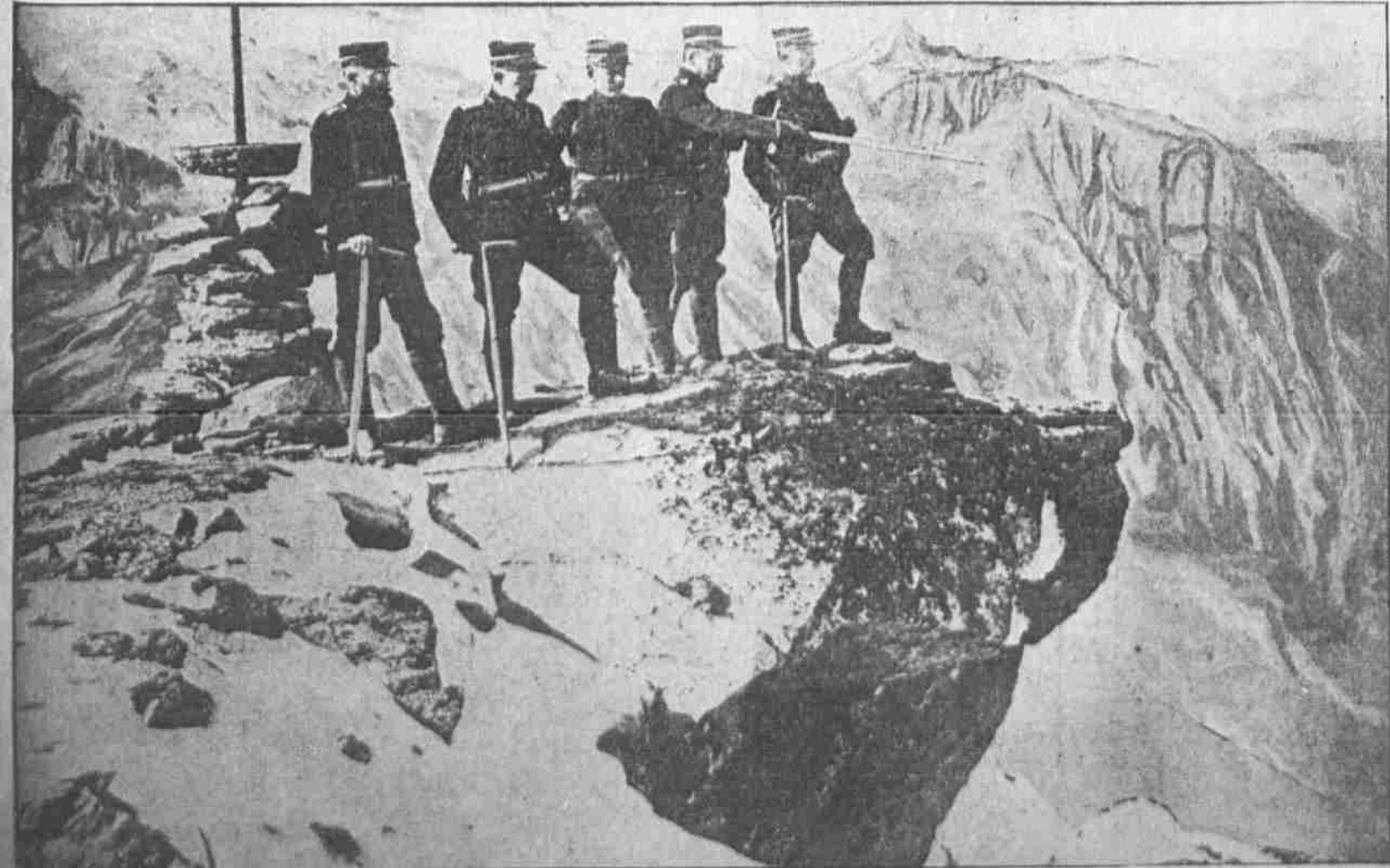
SWISS ARMY OFFICERS INSPECTING FRONTIER WITH A VIEW TO STRENGTHENING DEFENSES AGAINST POSSIBLE INVASION BY POWERS AT WAR