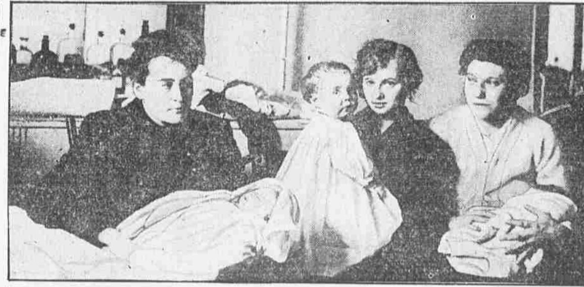
Mothers who have come to report on the results of a week's special diet.