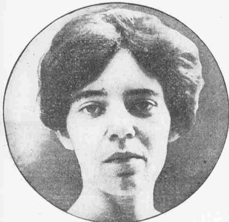
EDITING PROOFS FOR THE SUFFRAGE PAPER WHILE HELPING TO PICKET THE WHITE HOUSE IS THE EXPLOIT OF MISS ALICE PAUL