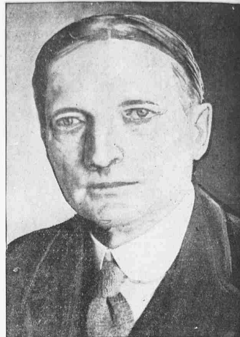
THE DAY'S PESSIMIST "Continuous mental intoxicants are undermining the sturdiness of our younger generation," says Senator J. P. McCumber, of North Dakota.