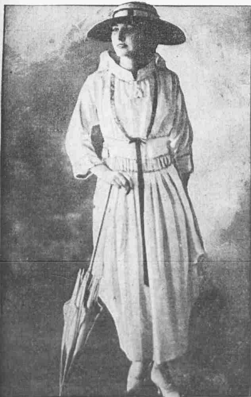
THE SPRING SKIRT WILL LOOK HOBBLED, BUT IS CUNNINGLY DESIGNED SO AS TO PERMIT THE WEARER TO MOVE