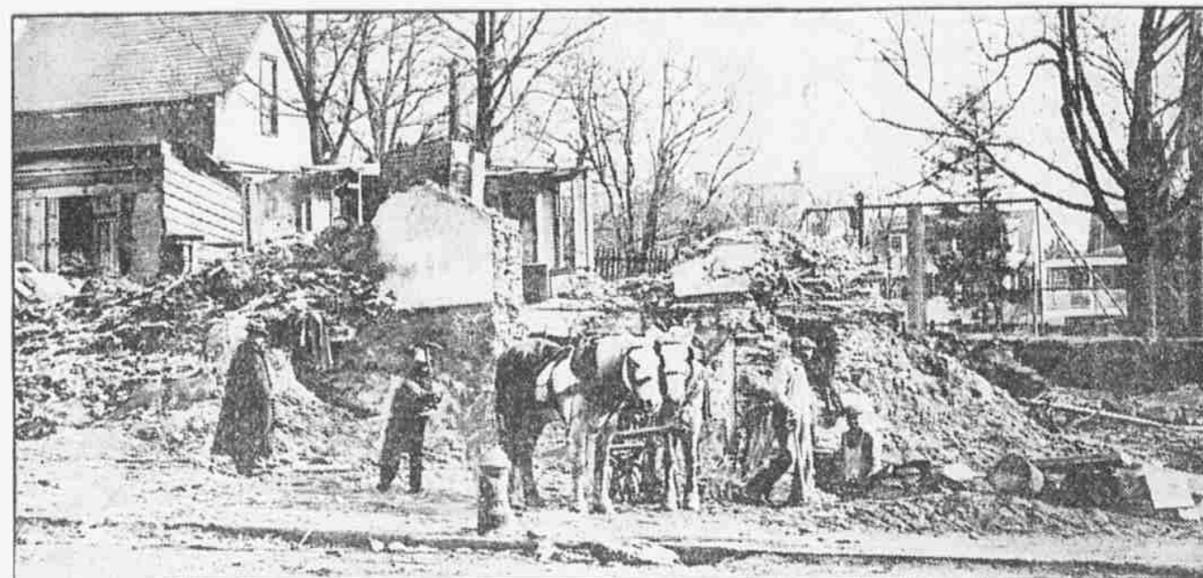
HISTORIC RODNEY HOUSE, AT GERMANTOWN AVENUE AND DUVAL STREET, BEING REMOVED TO MAKE WAY FOR STORE BUILDINGS