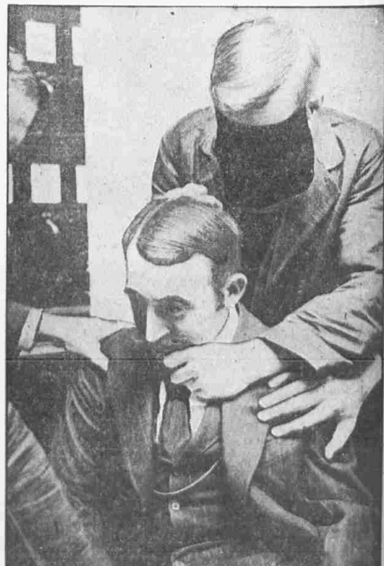
"MUGGING" (TAKING THE PHOTOGRAPH) OF AN UNWILLING PRISONER AT THE DETECTIVE BUREAU, CITY HALL