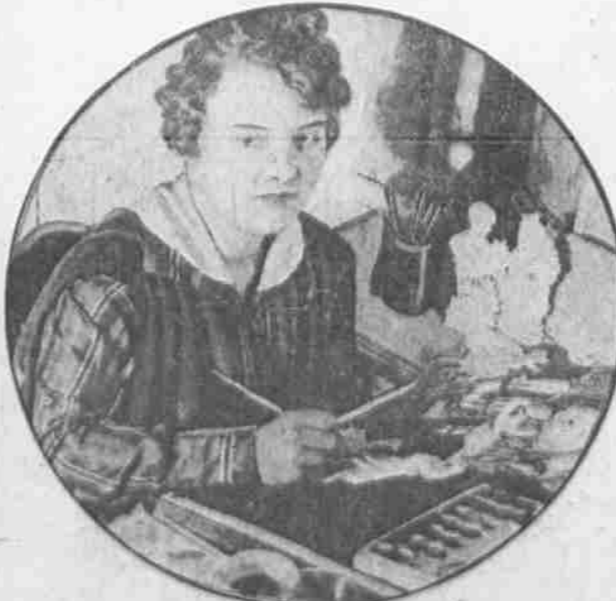
GIRL DESIGNER AT WORK IN FACTORY IN WORCESTER, MASS., WHICH TURNS OUT VALENTINES BY THE TON