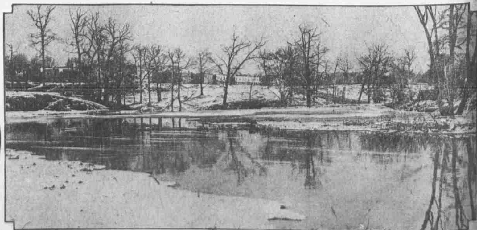
FAILURE OF MUNICIPAL ICE POND AT SIXTY-NINTH STREET, COBB'S CREEK, TO FREEZE OVER DISCOVERED TO BE DUE TO SUBMERGED HOT-WATER PIPE