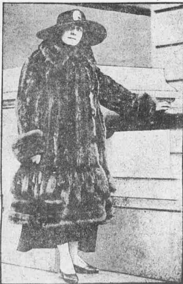
COAT OF RUSSIAN SABLE VALUED AT $24,000 TO BE AUCTIONED AT THE PHILADELPHIA ART GALLERIES. THE BUTTONS ARE VALUED AT $7.50 EACH