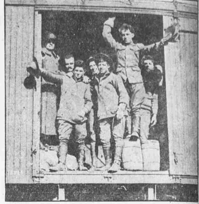
SCENES ATTENDING THE RETURN OF PHILADELPHIA'S CAVALRYMEN FROM THE MEXICAN BORDER, SHOWING THE UNLOADING OF THEIR EQUIPMENT FROM FREIGHT CARS PENDING THEIR FORMAL MUSTERING OUT WITHIN A SHORT TIME