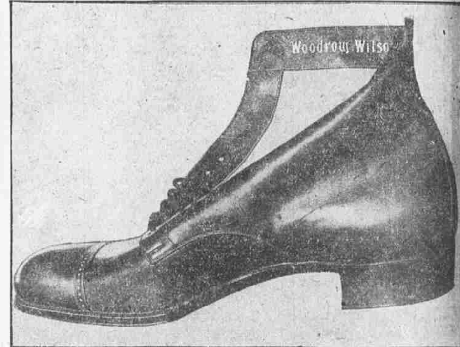
PRESIDENT WILSON'S SHOES, MADE BY BROCKTON, MASS., FACTORY, WHICH USES 42 SEPARATE PIECES OF LEATHER