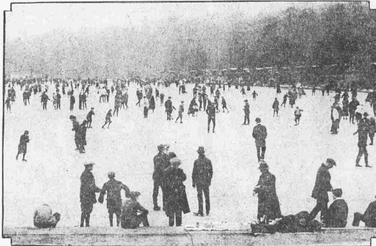
GUSTINE LAKE IS A FAVORITE WITH SKATERS FROM MANAYUNK