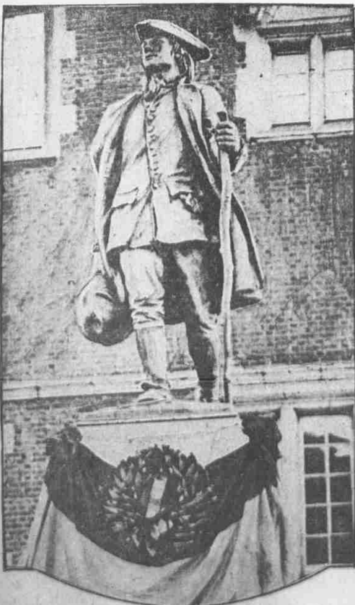
FRANKLIN STATUE AT THE UNIVERSITY GYMNASIUM IS DECORATED BY CLASS OF 1904