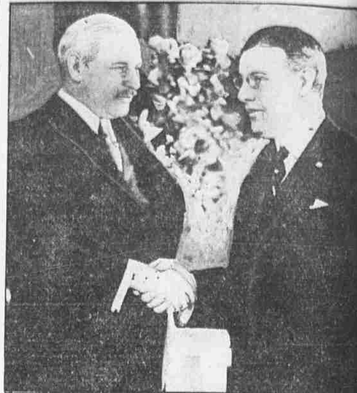
GOVERNOR EDGE AND EX-GOVERNOR FIELDER MEET IN EXECUTIVE CHAMBER