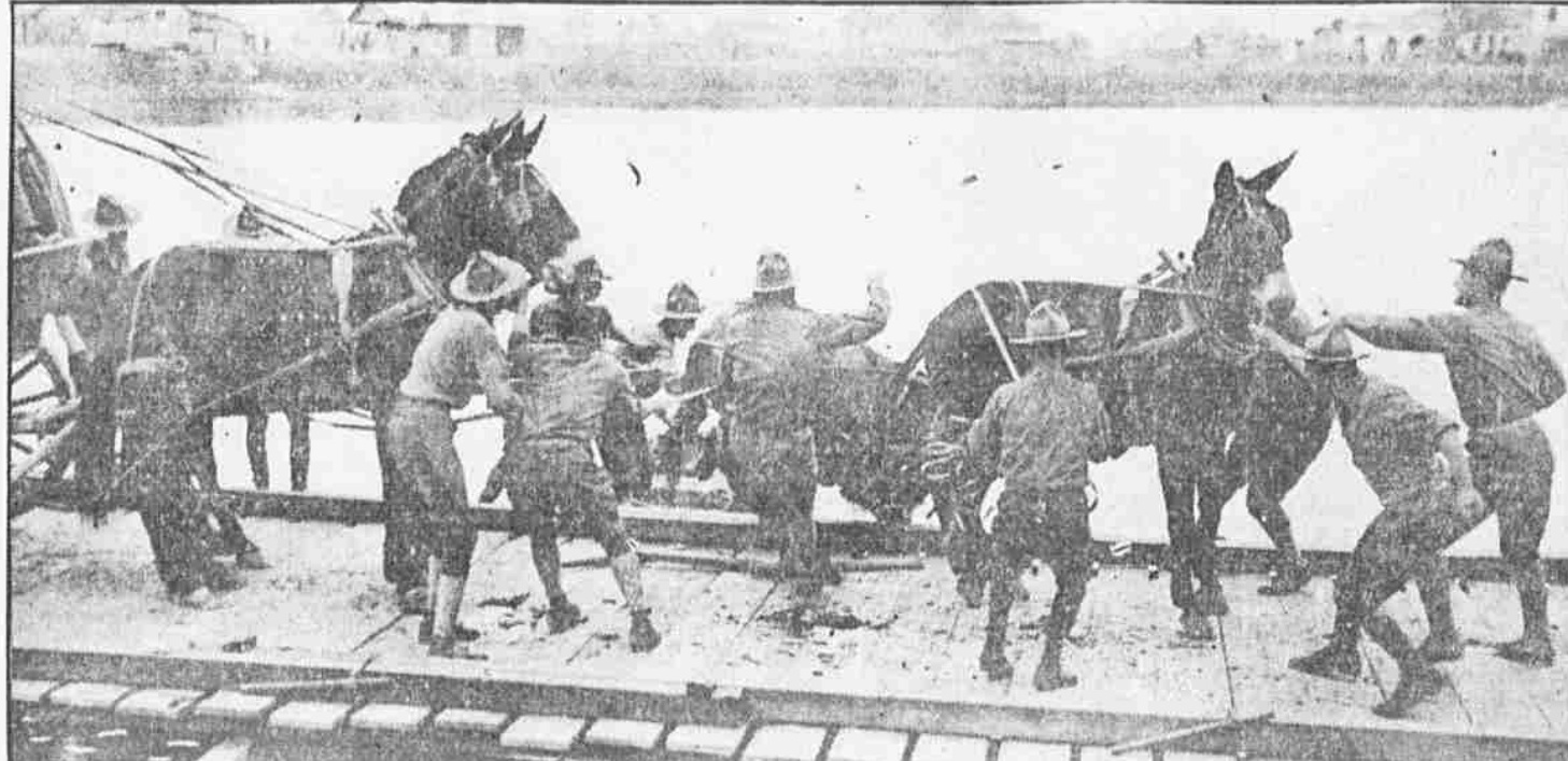
TROUBLES NEVER END DOWN ON THE MEXICAN BORDER AS LONG AS THERE IS AN ARMY MULE TO KICK OVER THE TRACES