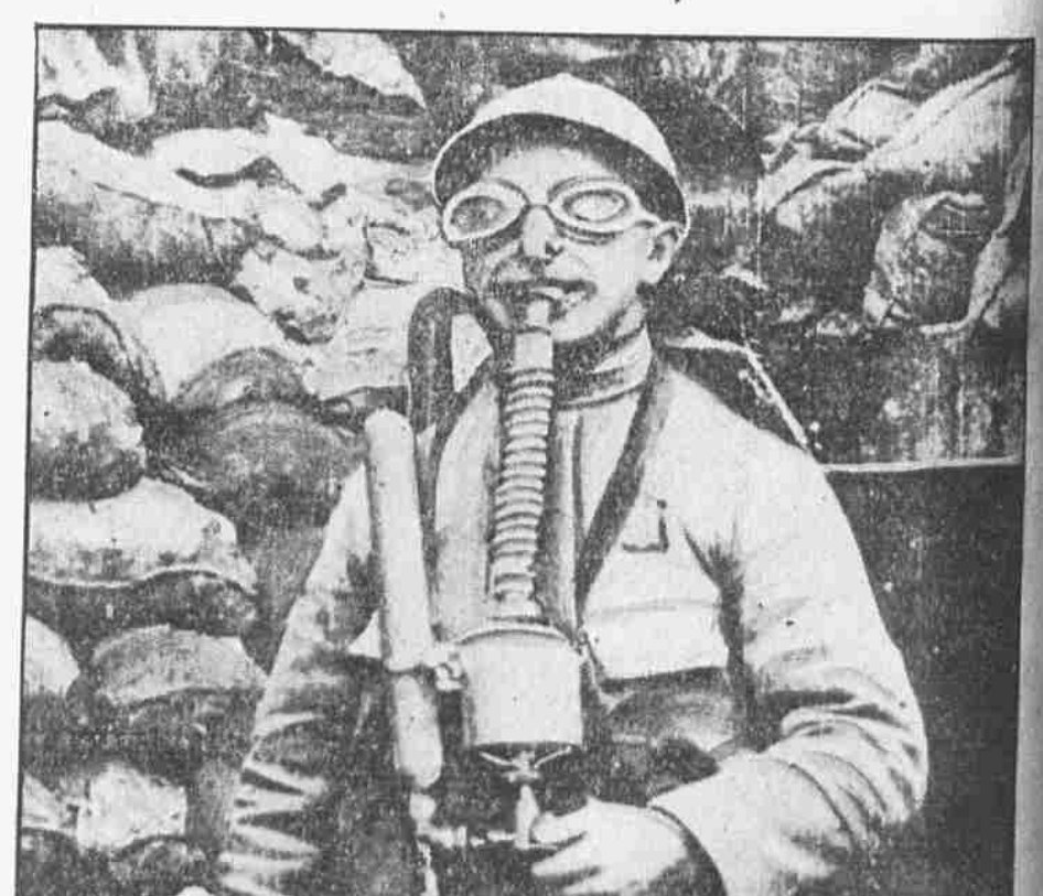
ELONGATED RESPIRATOR IMPARTS ADDITIONALLY GRO- TESQUE APPEARANCE TO THE NEWLY EQUIPPED FRENCH SOLDIER