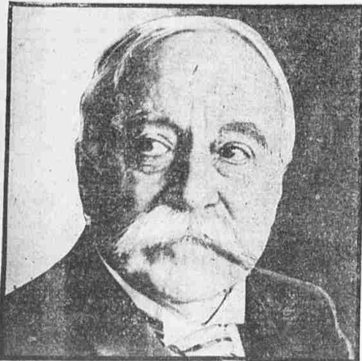
IN THE DEATH OF GEORGE DEWEY AMERICA LOSES ITS ONLY ADMIRAL