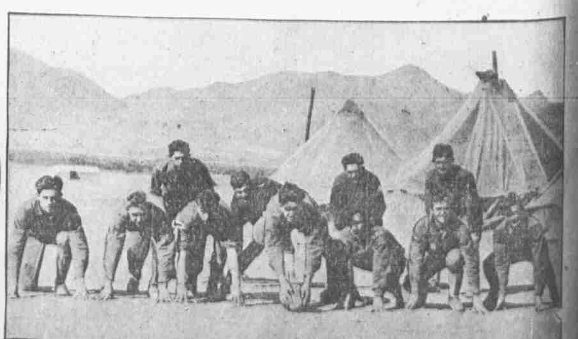
COMPANY M, OF THE SIXTH PENNSYLVANIA INFANTRY, PRODUCED THIS FOOTBALL TEAM, CHAMPION OF CAMP STEWART