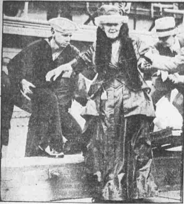
GEORGE DEWEY, WIDOW OF ADMIRAL DEWEY, FROM HER MOST RECENT PHOTOGRAPH.