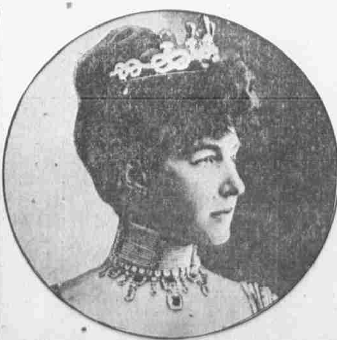
DUCHESS OF AOSTA MAY BE GREECE'S NEW QUEEN IF ALLIES CARRY OUT REPORTED PLANS