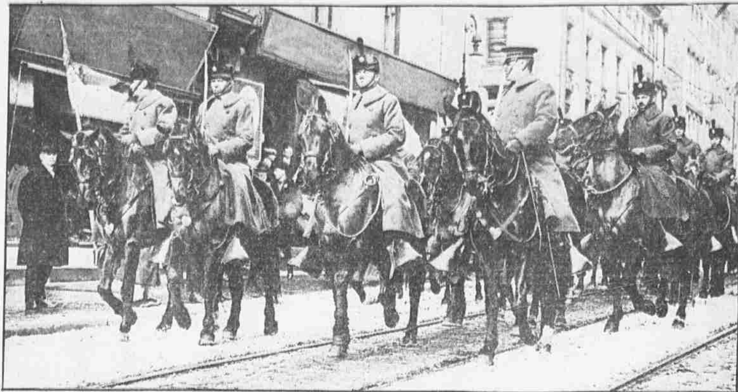
ESSEX TROOP ACTING AS GUARD OF HONOR AT INAUGURATION OF GOVERNOR EDGE AT TRENTON